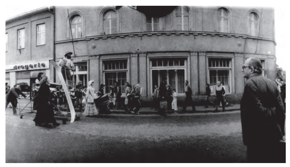
A Street Performance of HaDivadlo in Prostějov (1983).