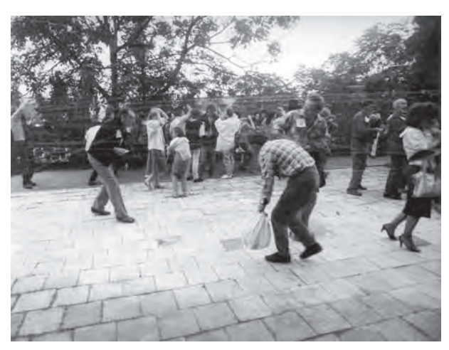
Street Performance Divadlo v pohybu III (Theatre in Movement III) of the Theatre Goose on a String on the Terraces of the Capuchin Gardens near St Peter and Paul's Cathedral in Brno (1987).

Caravane concluded its tour. Václav Havel observed that when MIR Caravane stopped in Prague at the beginning of July 1989 it was in the form of a rehearsal for the non-violent spirit of the Czechoslovakian 'Velvet Revolution'.