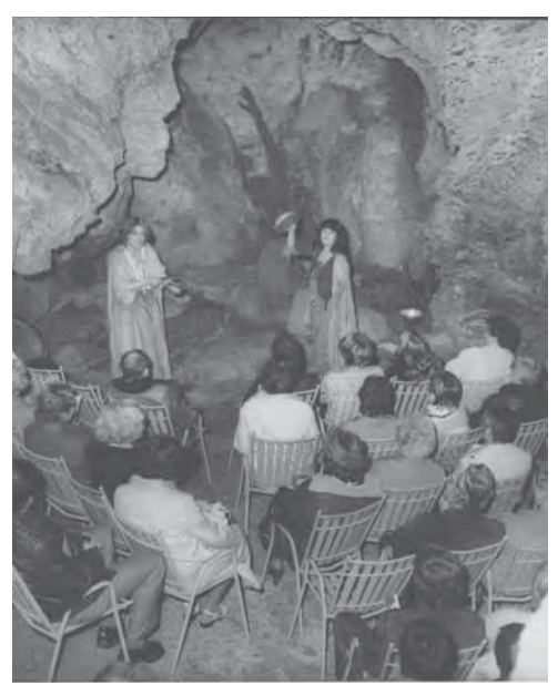
A Performance of Antonín Přidal's Pěnkava s loutnou in the Zbrašov Aragonite Caves (1983).

into the biggest 'dome' (The Marble Cave), where they had to find themselves an appropriate place to stand, sit or lean – adjusting to the cold and uncomfortable rocky stumps. Besides expectation, the dominant emotion was loneliness in the vast space. Humbleness enforced by the cave hall was reflected in the audience's mood. Time before the start of the performance passed in silence, in spectators' whispered comments, in their looking for the most appropriate niche in which to stand, or a flatter spot on which to perch. Another production of the Studio Forum in Zbrašov Aragonite Caves was Antonín Přidal's balladic play Pěnkava s loutnou (Chaffinch with a Lute) in 1983. The performance for three actresses was built as a medieval dispute with fate and death unfolding the resonating theme of art and its liberating power, undoubtedly supported by the authentically archetypal, semantically concentrated irregular space.