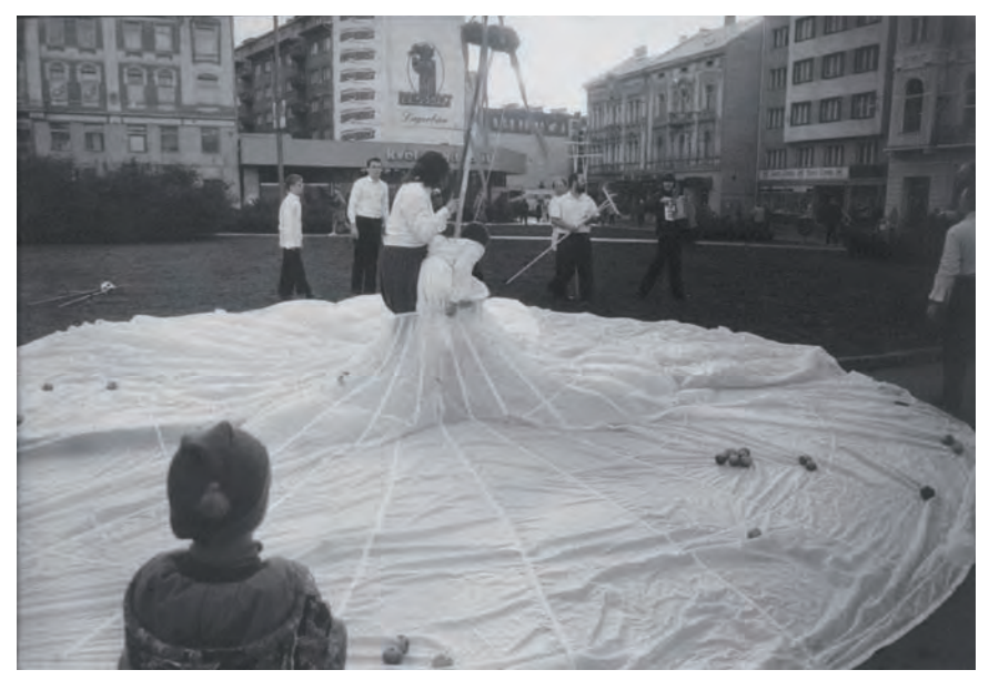
Street Performance Bílé sny (White Dreams) of the White Theatre in Ostrava (1984).

in the former Masaryk Square, and in other cities. Another open-air project by the White Theatre was Máj (May, 1985), based on the famous poem of 1836 by K. H. Mácha, performed on the bank and in the waters of the pond in Klímkovice park by Ostrava (NĚMEČKOVÁ 2007: 36). The typical trait of the White Theatre performances has always been a form of theatrical event associated with examining various possibilities of the theatrical encounter and so-called 'public space', where the audience together with the performers turn into authentic participants in an imaginative event.