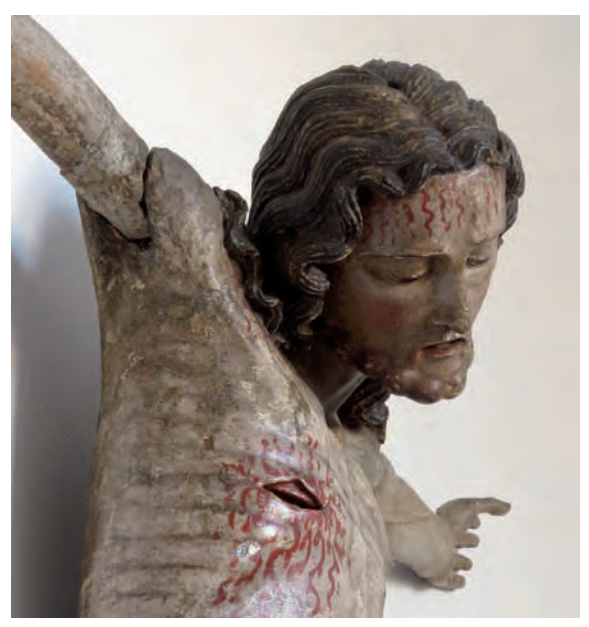
Illustration 5. Crucifix. Christ with Movable Arms to be Placed in the Easter Sepulchre from the Church of St Benedict at Hradčany in Prague; around 1350. A Detail of the Joint Mechanics.

of St John. Here, a surviving statue (Ill. 1), somewhat unconventionally, consists of two parts: an ass and a Christ that sits atop the animal as a separate object. The two sections of the whole date from different periods (a Baroque-style Christ probably dates back to the early eighteenth century, whereas the ass statue is older and is carved from different material). Despite the aforementioned proximity of the Church of St Procopius to German-speaking lands, it is nevertheless possible that the practice of pulling the Palmesel at this site could have been a reflection of Prague ritual. The above-cited breviary of the Church of Our Lady below the Chain (where the practice was also said to have taken place) had in fact been, since the Hussite Wars and therefore up to the 1470s, in the possession of the Strakonice Commandery, from whence it returned to Prague (PETR 1990: 51). If the use of a Palmesel was not general practice in the Order of St John, it could have been introduced in Strakonice as a result of use of this breviary. What is also interesting in this case is the character of the Strakonice sculpture (i.e. the fact that it consisted