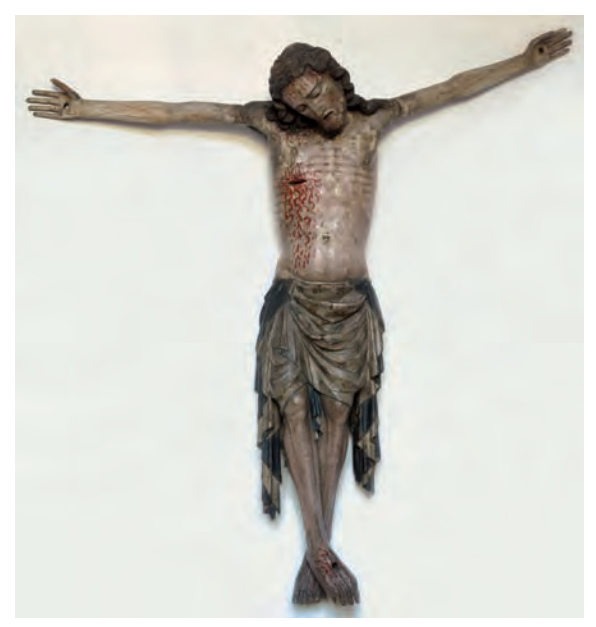
Illustration 4. Crucifix. Christ with Movable Arms to be Placed in the Easter Sepulchre from the Church of St Benedict at Hradčany in Prague; around 1350.

end of the fourteenth century). The fact that the St Peter at Vyšehrad manuscript was adjusted in line with contemporary St Vitus breviaries is also attested to by a rubric concerning the ass, written down in its already adjusted form (including the Saviour's statue and omitting the part concerning the bringing out of relics). The pulling along of the wooden statue of Christ mounted on an ass was thus also produced in Prague by the end of the fourteenth century at St Peter at Vyšehrad, and it is possible that it was at this time that the practice was first introduced, together with the St Vitus liturgy.