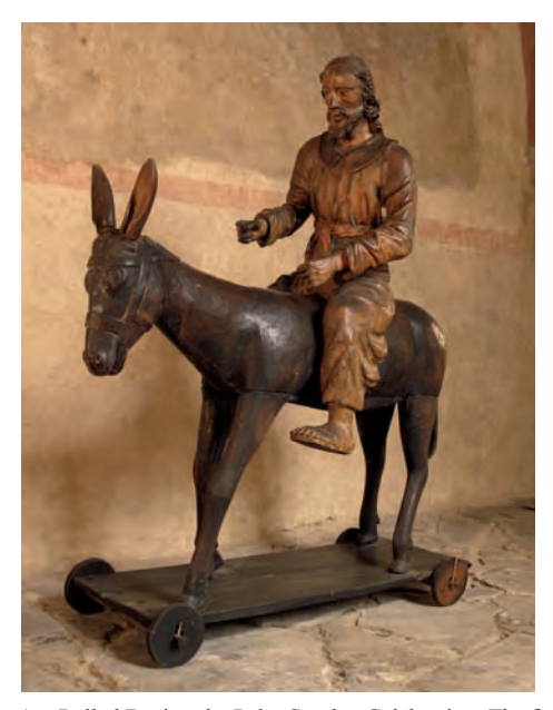
Illustration 1. Christ on an Ass Pulled During the Palm Sunday Celebration. The figure of Christ dates to the eighteenth century, the ass is of an earlier date; condition in 2009. Muzeum středního Pootaví , Strakonice.

The sacred object was destroyed in this astonishing action; nevertheless, the remarkable tradition of the procession with a statue of Christ on Palm Sundays resumed in the same way after the end of the Hussite Wars. Liturgical books preserved in great numbers describe the events of a ceremony of this sort regularly held in St Vitus Cathedral.<sup>2</sup> They were published at the end of the fifteenth century as imprints in a form that codifies the programme of performance throughout the previous century. Hence, in a breviary published in 1492,<sup>3</sup> it is first recorded that in the Church of St