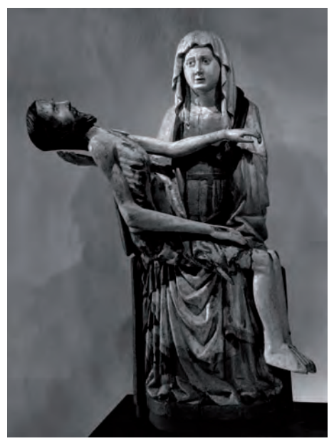
Illustration 8. The Pietà with the Removed Figure of Christ Placed in the Easter Sepulchre, Lásenice near Jindřichův Hradec, before the mid-fifteenth century. The National Gallery in Prague.

picture of any original prevalence of such statues, because none of their places of origin or details of use is certain.