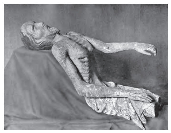
Illustration 9. The Pietà of Lásenice near Jindřichův Hradec. The Removed Figure of Christ. The National Gallery in Prague. Reproduction: Zdeněk Wirth (ed.). Umělecké poklady Čech I . Praha, 1913.

to a cross with bow-shaped arms, was also found in the small village of Boletice near Český Krumlov (Ill. 6-7). Here, the local, originally Romanesque, Church of St Nicholas was modified at the end of the fifteenth century, at which time the presbytery and sacristy were rebuilt (POCHE 1977: 98-99). If the sculpture was made for this church and not for some other church in nearby Český Krumlov, then it could have been sculpted for the purpose of rebuilding. Even so, the existence of the Boletice crucifix could be a reflection of a similar practices performed in one of the other Český Krumlov churches.