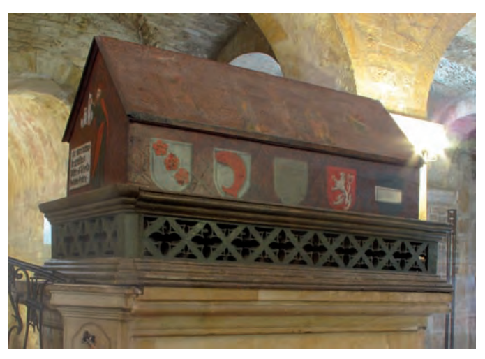
Illustration 11. The Tomb of Duke Vratislav in the Former Benedictine Church of St George at Prague Castle.

used on its own: laid in the Sepulchre or stood upright on the altar (BARTLOVÁ 2007).<sup>58</sup> The figure of Christ in a Pietá that originated in Cheb in West Bohemia also presents the Saviour as a separate figure; however its present condition does not make it possible to judge whether there was any intention here to use Christ's body in isolation, or whether the separation of the two elements of the sculpted ensemble was merely a result of construction procedures (ŠEVČÍKOVÁ 1974: 43, Tab. 1-2).