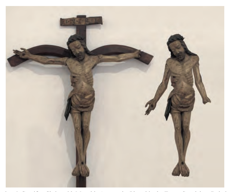
Illustration 6. Crucifix. Christ with Movable Arms to be Placed in the Easter Sepulchre, Boletice near Český Krumlov; around 1450, and as Fixed on the Cross with Outstretched Arms.

that above it, placed in the wall, was the skull of Bishop Andrew (EMLER 1884: 401). <sup>26</sup>