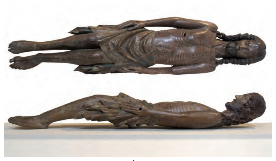
Illustration 3. Christ from the Holy Sepulchre in České Budějovice, around 1360. Front and Side View. Alšova jihočeská galerie , Hluboká nad Vltavou.

takes longer than expected and, on reaching the church door, the participants find it closed. A manuscript dating back to 1400-1409 is also part of a group of liturgical handbooks with this different agenda, having also the rubric concerning the top of the mount, but failing to mention the use of an ass (RATAJ 1999: 24-25, note 2; Národní knihovna , VI Fc 35).