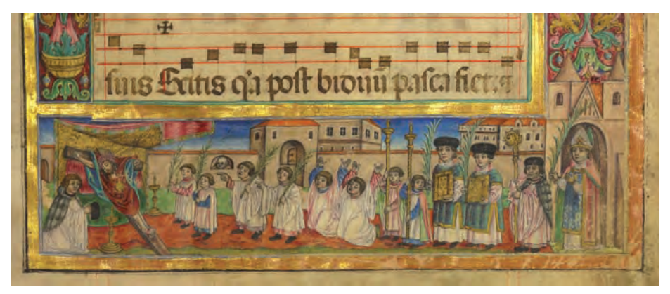
Illustration 2. The Procession on Palm Sunday, Setting Out from St Wenceslas Cathedral in Olomouc. Zemský archiv v Opavě – department Olomouc, collection Metropolitní kapitula Olomouc, CO 89 (Passional of Jan Kalivoda), 1525, fol. 1a.

that the procession came in through the gate of the town or the castle whilst, as it entered, the cantor chanted the response Ingrediende Domino . The term ' intraverint portas civitatis vel castri ' may accordingly indicate a single location for both events (if Prague Castle is to be understood in the older terminology to be civitas ). Otherwise, the procession would have had to enter the city first (in this case through Malá Strana) and from there progress through the south gate to the Castle grounds. Given that this gate was already walled up in the fourteenth century, this seems unlikely; so the procession had probably to gather somewhere near Strahov (an interpretation of the term 'on top of the mount'), or on the north forefield of the Castle (at this moment symbolising the Mount of Olives, whence Christ descended into Jerusalem) to set out from there to the west gate of the Castle.