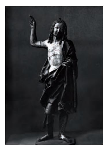
Illustration 13. Master of the Doksany Altar, The Resurrected Christ Intended to be Pulled on the Ascension Day Celebration, around 1521.

an idea of the intimate nature of performances of this religious celebration. As in the case with many 'portable' statues of Christ, the most important fact is missing for this statue: its provenance. A similar difficult case is that presented by the statue of a Resurrected Christ from the Cistercian Monastery in Lusatian Ostritz. This is the earliest extant example with a characteristic iron ring still present in the top of the head, dating back as early as to around the mid-fourteenth century, and so the possibility of it originating in Bohemia is noteworthy. It might originally have come from the Cistercian Monastery in Tišnov (near Brno), which in the nineteenth century already belonged to this Lusatian monastery as a secularised complex. This may be attested to by its formal outlines, ascribing the statue to the work of the Master of the Madonna of Michle, or his workshop. Uniquely then, it could be possible to associate this statue with a still-existing performance location, because