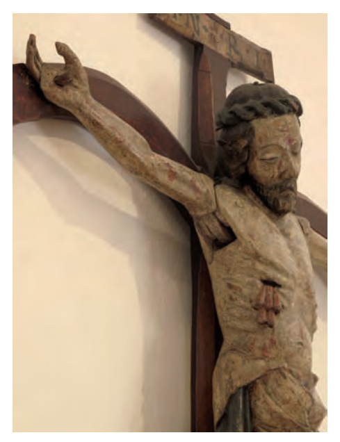
Illustration 7. Crucifix. Christ with Movable Arms to be Placed in the Easter Sepulchre, Boletice near Český Krumlov; around 1450. A Detail of the Joint Mechanics. Alšova jihočeská galerie , Hluboká nad Vltavou.

as it logically corresponds to the time at which the construction of St Wenceslas Chapel was completed (i.e. 1367). The chapel itself can thus be identified in the Romanesque basilica by the narrow space between St Wenceslas Chapel and the lobby behind the main entrance, where the altar that concerns us probably also stood. It also seems that the Sepulchre of St Gaudentius was also removed from the demolished eastern crypt and placed here in the chapel. This was evidently only a temporary measure, because the altar and this Sepulchre were then moved to the western part of the basilica due to the construction of the new St Wenceslas Chapel. An inventory of 1415 also lists the altars of St Bernard and Our Lady of the Snows (TOMEK 1872: 246), while the St Gaudentius Sepulchre probably found its place in the western part of the basilica.