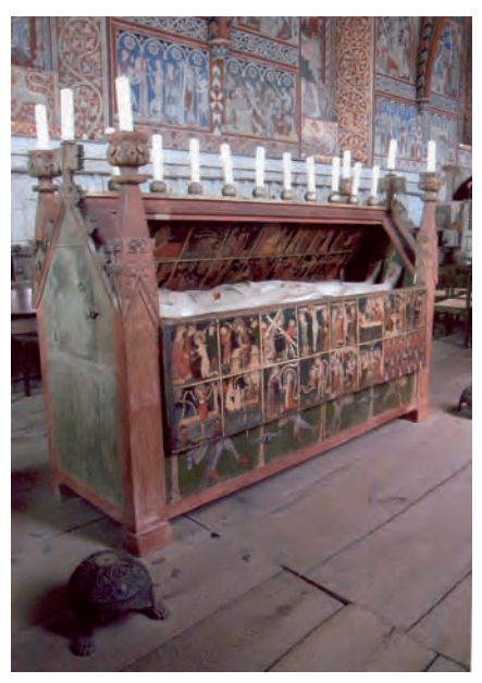
Illustration 10. A Portable Wooden Holy Sepulchre with the Figure of Christ. The Cistercian Monastery in Wienhausen, around 1290, repaired in 1448.

same can be assumed of Olomouc Cathedral). It is also likely that two statues were used this way in St Thomas Monastery in Prague. Following the already-mentioned entry regarding Christ's sculpture, destined for the Sepulchre, the 1409 inventory mentions two statues of the Resurrected Christ placed on the altar, a small one and a big one. <sup>54</sup> One interesting testimony about the arrangement of these kinds of statues is provided by a 1407 inventory of the Church of the Holy Spirit in Hradec Králové, which gives an entry 'with tunic' for the statue of the Resurrected Christ. <sup>55</sup> The statue itself is not mentioned here, so one can only imagine how this robe was intended to augment its realistic appearance.