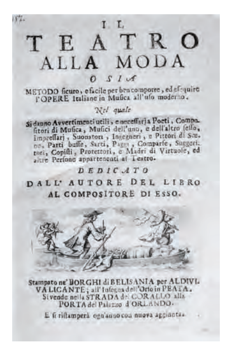
The Title Page of Benedetto Marcello's Treatise Il Teatro alla Moda (Venice, c.1720). Wienbibliothek im Rathaus, Vienna. Sign. A 44971.

and they have no need for light either, because they know their parts by heart. The ideological justification for the practices here described is to be found in the high measure of stylisation in Baroque acting, in which characters' emotions and even individual words were visualised by a set system of postures and gestures. For such an acting style, based predominantly on the declamation of lines, scenography represented a certain desirable decorative framework; in essence, however, it was not indispensable. Due to the perspective painting of the decorations, it was possible to act only in the front of the podium, and the more distant parts of the stage could not be used for acting, but simply as a background for tableaux vivants . With a view to this practice it becomes more acceptable that a collection of about ten archetypal decorative sets was perceived as fully sufficient for any production requirements of the operatic repertoire.