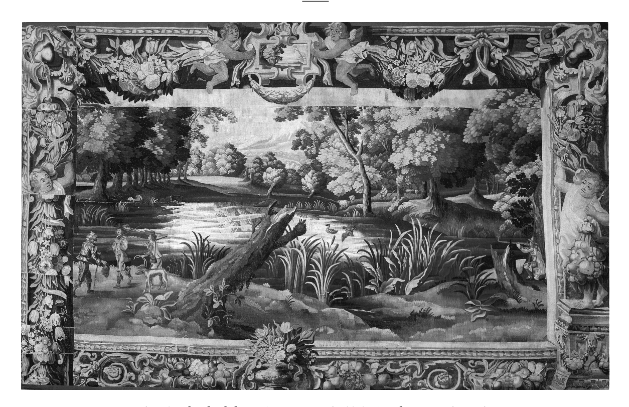
Fig. 6: The duck hunt (Inv. Nr. UO 486 T).

werp, who realized a lot of Piccolomini's commissions, among them also the commission for verdures in 1649. The correspondence between Luigi Malo and Piccolomini is preserved, so we know exactly how the commission was realized. The tapestries were woven in wool and silk in the workshop of Jean Raes in 1649/50 and were based on the drawings of Lucas van Uden (1595–1671),<sup>38</sup> the Flemish painter, who is well known for his landscapes and gentle depictions of nature inhabited by small groups of people. The four verdures in Náchod show idyllic landscapes with tiny figures, totally subordinated to the vegetation. The figures are couples from Antique myths, dressed in Antique costumes but there are also peasants in contemporary clothing who accompany them. The architecture in the background is contemporary, too, while the foreground consists of large leaves and grass, very similar to the ones in