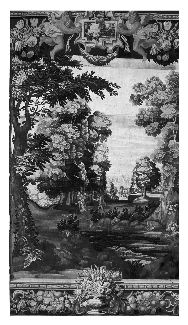
Fig. 7: Landscape with two hunters (Inv. Nr. UO 482 T).

wide borders, is not preserved (or more accurately, until now it has not been possible to identify it with any of the preserved series), but it is described in the correspondence between the art dealer Luigi Malo and Piccolomini, who wanted to buy a set of verdures for a gift. The description corresponds exactly to the appearance of the Ptuj verdures. Erik Duverger even thinks it would be possible that the mentioned series was the one described in the inventory from 1695 for Český Krumlov.<sup>41</sup>