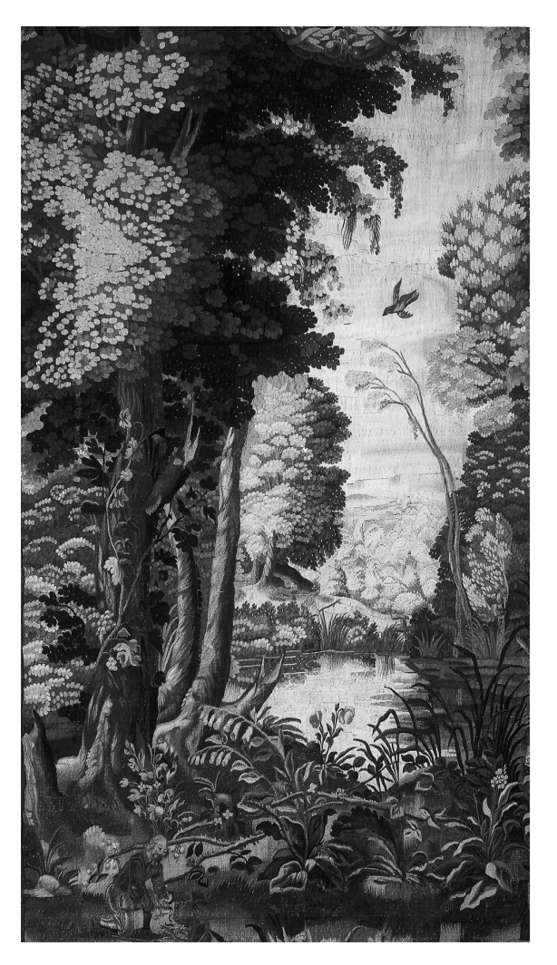
Fig. 8: The hunter with the dead duck (Inv. Nr. UO 487 T).

wide borders, is not preserved (or more accurately, until now it has not been possible to identify it with any of the preserved series), but it is described in the correspondence between the art dealer Luigi Malo and Piccolomini, who wanted to buy a set of verdures for a gift. The description corresponds exactly to the appearance of the Ptuj verdures. Erik Duverger even thinks it would be possible that the mentioned series was the one described in the inventory from 1695 for Český Krumlov.<sup>41</sup>