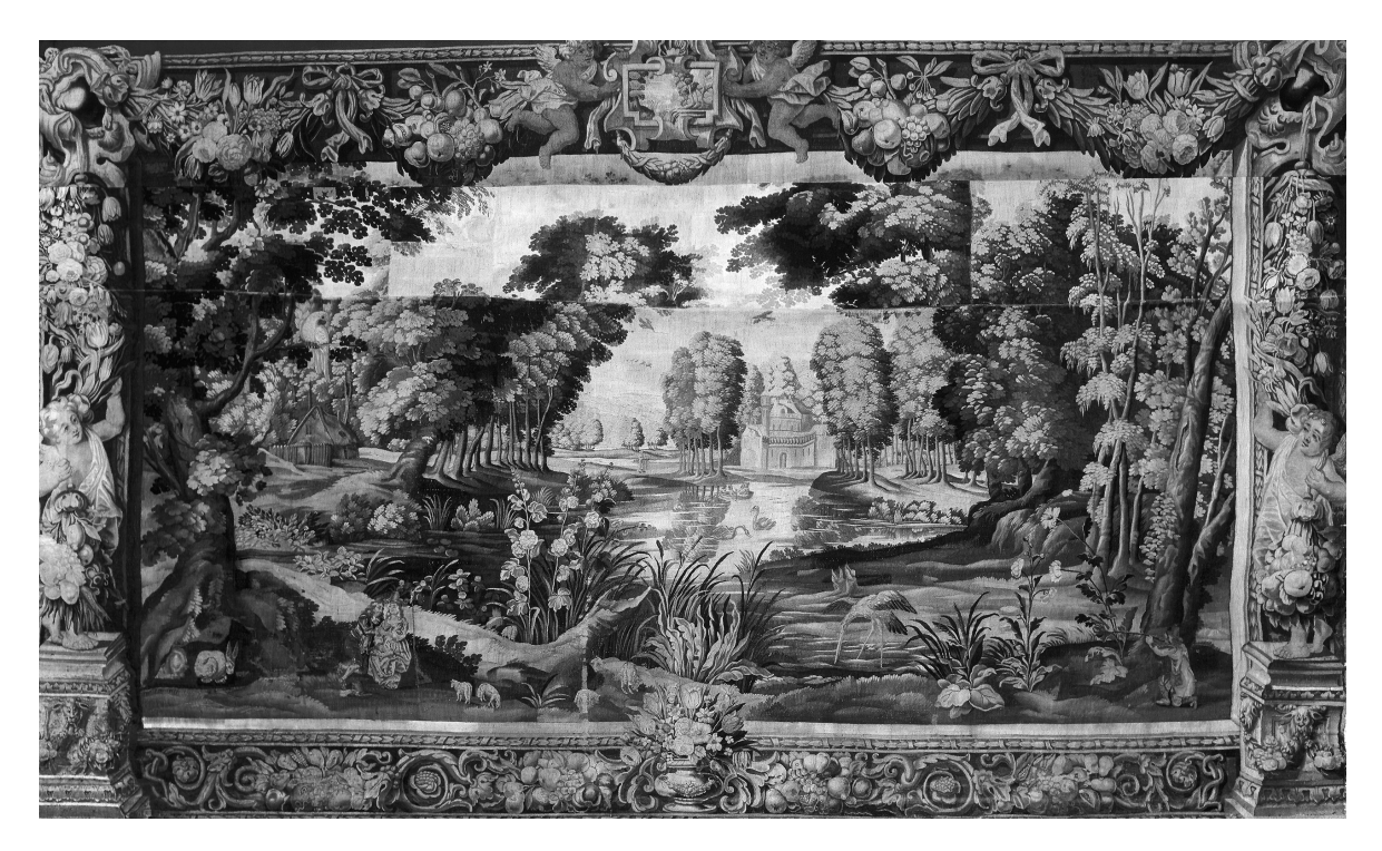
Fig. 3: The heron hunt (Inv. Nr. UO 483 T).

The six tapestries in the Regional Museum of Ptuj show landscapes with a girl by a pond,<sup>21</sup>with two hunters,<sup>22</sup> with the heron hunt,<sup>23</sup> with lovers, a bird and a horse,<sup>24</sup> with the duck hunt<sup>25</sup> and with the hunter with a dead duck.26 The landscapes are densely wooded; however they open in the centre of the composition where ponds with a glittering surface are visible. In the distance there are houses, a castle, a church with a tall bell-tower and even a whole village. In the foreground the colours are green (as daylight has faded the colours through the centuries, the green has lost a lot of yellow and is now closer to blue) and brown, in the distance they are bright and shiny. In the near foreground there are bunches of grass and leaves of disproportionate size. The perspective is stressed with tree trunks tilted towards the interior of the composition. The landscapes are inhabited with animals and people. Ducks and swans are swimming in the