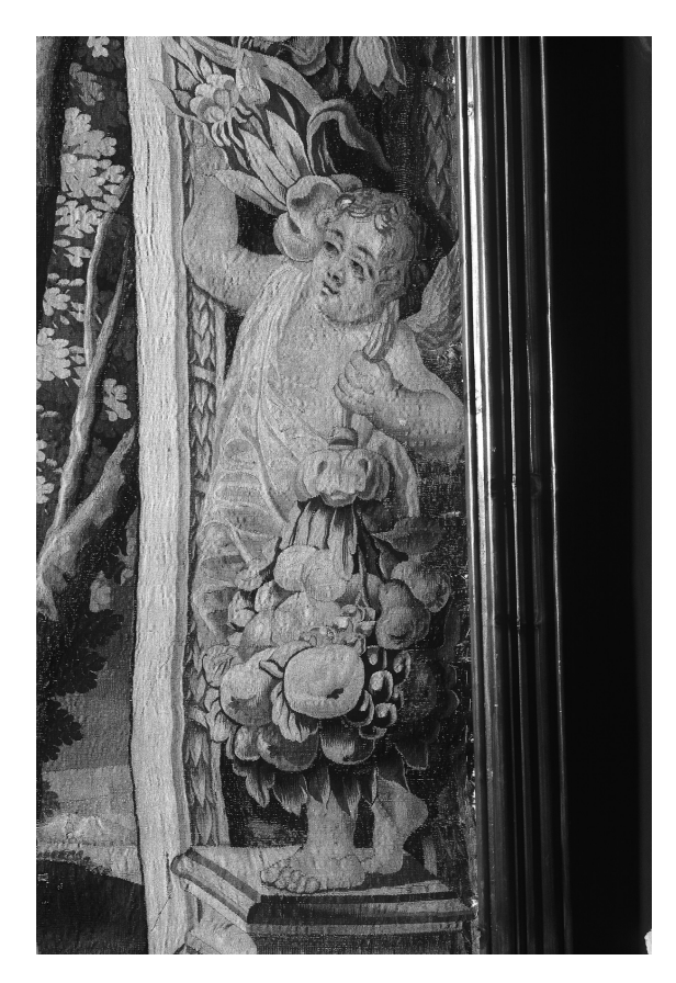
Fig. 2: The heron hunt, detail of the border (Inv. Nr. UO 483 T).

In 1997, the Regional Museum Ptuj ( Pokrajinski muzej Ptuj ) bought two tapestries on the art market, both dating from the end of the 17<sup>th</sup> century. One is narrow, high and with a preserved border; it depicts a group of men and it was most probably woven in Aubusson. The other one presents a young