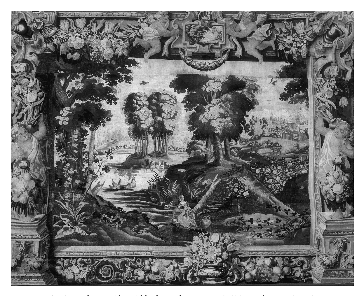
Fig. 4: Landscape with a girl by the pond (Inv. Nr. UO 481 T).

tract our attention. Both are seated in the foreground, one couple is absorbed in caressing, the other one is enjoying drinking wine while a horseman, taking care of a horse, is looking at them. All the figures are very small in comparison with the landscape and the tall grass and various flowers in the foreground.