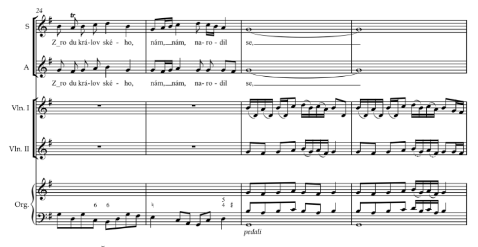
6. Šimon Brixi, Offertorium pro sacre nocte, 'item pro graduale'

The original title-page mentions the inclusion of a 'lyra pastoritia' almost certainly a hurdy-gurdy but no part survives. It may be that there never was a part and perhaps the layout and the wording of the title page provides a clue: 'basso continuo / cum lyra Pastoritia' – in other words, the hurdy gurdy player played with the organist. There is an indication in the organ part for 'sop. rip' when the