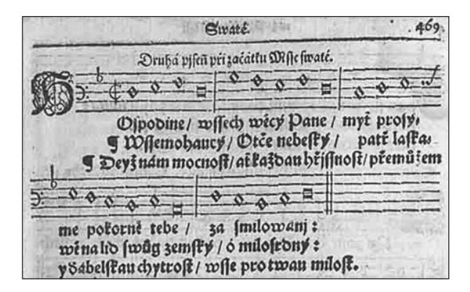
Šteyer, Kancionál Český (Prague, 1683), 'Druhá píseň při začátku Mše svaté.' [Another song for the beginning of Holy Mass]<sup>11</sup>

started along with the figural music that accompanied it. Few composers at the start of the 18<sup>th</sup> century succeeded in bridging the gap between vernacular and high-art traditions better than Šimon Brixi (1693–1735).