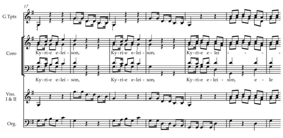
2. Šimon Brixi, Kyrie et Gloria<sup>12</sup>

Šimon Brixi's Kyrie et Gloria in G major begins with the same strident figure that begins so many Kyrie paraphrases found in kancionály from the 16<sup>th</sup> century, right up into Brixi's own lifetime (Example 1). As with so many melodies found in kancionály it served many texts, but in this case it nearly always serves some type of Kyrie paraphrase, making it ideal for Brixi's brilliant adaptation (Example