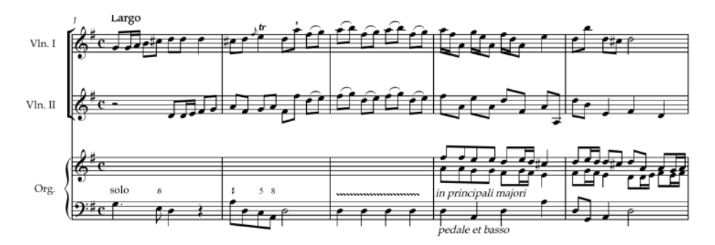
5. Šimon Brixi, Offertorium pro sacre nocte, 'item pro graduale'

sacre nocte (which contains an offertory and gradual) Šimon Brixi mixes Czech and Latin; the Gradual begins with the Latin offertory text 'laetentur caeli' but following the indication in the manuscript 'item pro gradual' it then proceeds into the popular Christmas song Narodil se Kristus Pán [Christ the Lord was born] (Examples 5 and 6). Again, there is a stylistic shift as the composer moves from Latin to Czech and this shift is also accompanied by more unison textures. This contrast was not a matter of course, in many cases vernacular elements are give a musical treatment more appropriate for court or cathedral, such a fugue.