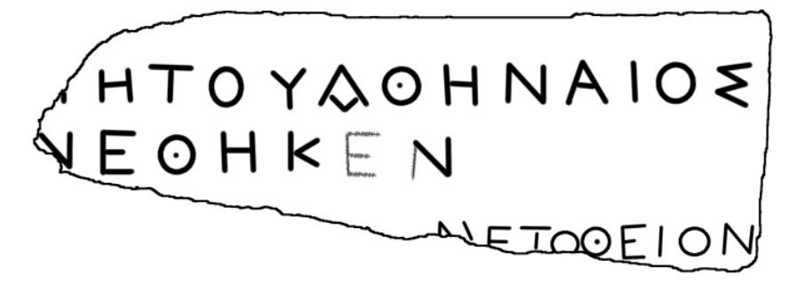
Fig. 4: Digital drawing of IG IV<sup>2</sup> 1 255 based on Fig. 3.

In my opinion, the surviving fragment of the first letter in line 1 is too small to determine what letter it belonged to. Based on its shape and phonological position, it could be A, M, N, or T. The plausibility of delta ( \Delta ) is rather low, since in this case we should have a little remnant of the horizontal baseline as well. Pi ( \Pi ) can almost certainly ruled out, because in our period its right vertical stroke is shorter than the left stroke and does not reach the base line level. Unfortunately, the surviving fragment is too short to allow us to determine if the stroke was exactly vertical or not. It is common (though not universal) that none of the stems of M is vertical: M. The right stem of N, as can be observed in our fragment, was inscribed either vertically or slightly leaning to the right: N. The right stem of \Lambda always leans to the left. The constituents of T are a vertical stem with a horizontal stroke on top, and the angle of the break in the fragment allows us to assume that what we see is the bottom remnant of the stem: the horizontal stroke has vanished in the broken lacuna. Furthermore, reading a T does not require us to presume that the remaining stroke was askew in any direction. The distance between the letter particle and the left stem of H is exactly the same as that between the H and the following T.