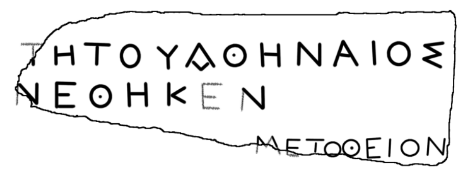
Fig. 6: Suggested supplementation

the V-shaped middle stroke of the first alpha in line 1 might hint at a later (hellenistic?) date.<sup>25</sup>