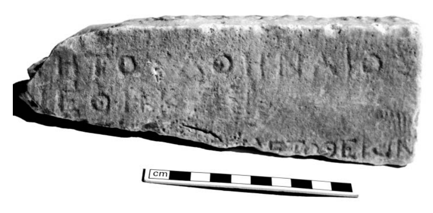
Fig. 3: Photograph of IG IV<sup>2</sup> 1 255

Aeschines' epigram. After prolonged correspondence,<sup>23</sup> efforts to acquire a photograph proved successful: the responsible ephorate (Δ' Εφορεία Προϊστορικών και Κλασικών Αρχαιοτήτων) kindly produced and sent me a digital image of the fragment held in the Archaeological Museum of Epidaurus. The photograph allows us to decide whether Herzog's assumptions can be verified or not.