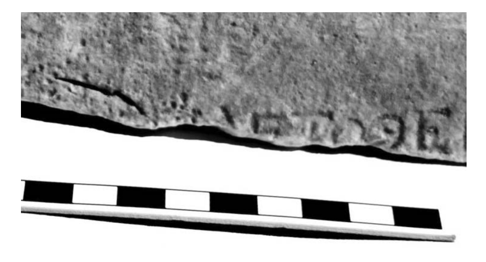
Fig. 5: Remnants of line 3.

tos, Euphiletos, Kletos, Meletos, Theaitetos, and Theognetos. If the correct reading of the letter particle is T, as has been tentatively suggested, then Euktetos and Theaitetos are the attested examples. Nevertheless, no certainty can be obtained by investigating the initial letter fragment in the first line.