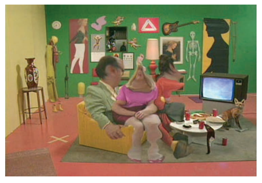
Figure 7. Still image from *Corpus Callosum (2002), 92 minutes, digital video