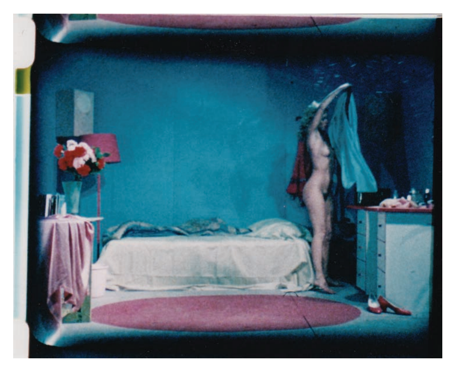
Figure 6. Still image from Presents (1980-81), 90 minutes, 16 mm