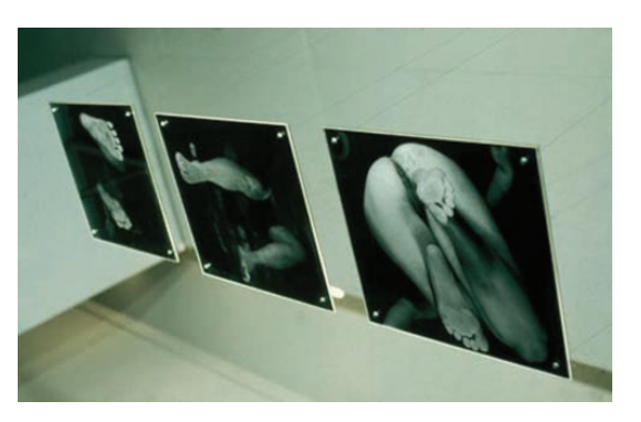
Figure 2. Crouch, Leap, Land (1970), 3 black and white photographs, perspex, metal, suspended, 140 × 36 cm each, total dimensions 161 × 36 cm. Collection: Art Gallery of Toronto