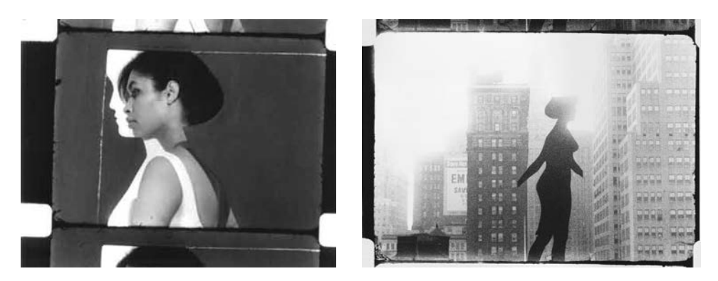
Figure 5. Still images from New York Eye and Ear Control (1964), 34 minutes, 16 mm