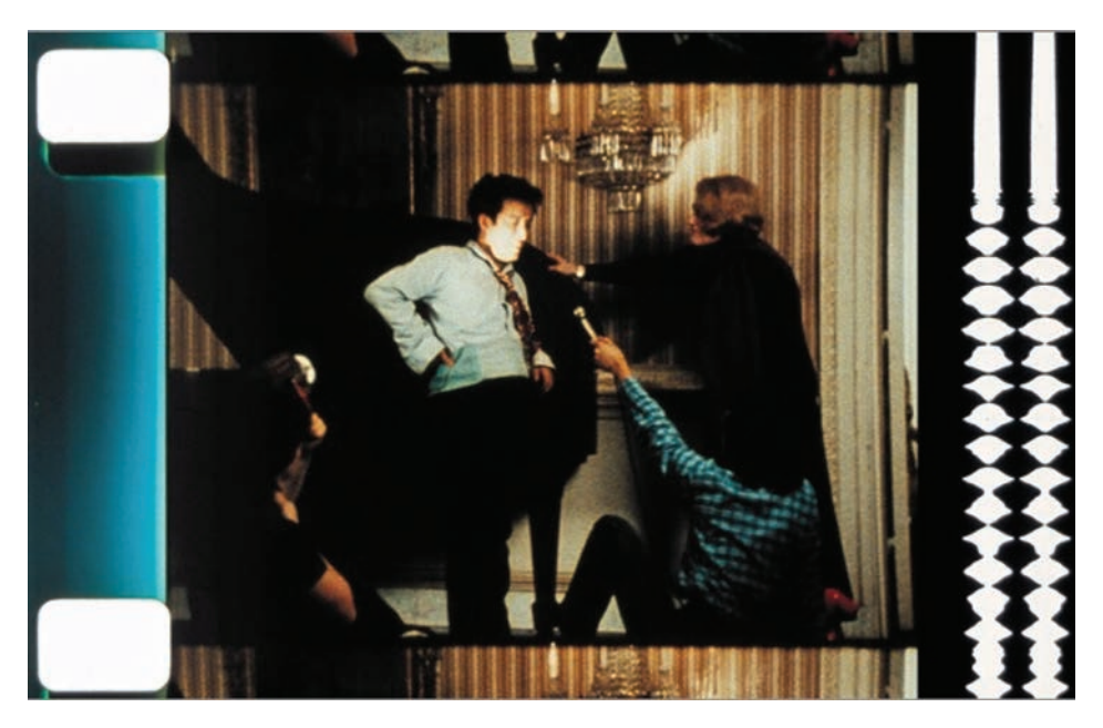
Figure 4. Still image from Rameau's Nephew by Diderot (Thanx to Dennis Young) by Wilma Schoen (1974), 4.5 hours, 16 mm

perception.<sup>6</sup> In moments where the images and sounds align in synchronistic fashion in these works, the effect produced is one of heightened interest, rather than the dismissal of one form as merely supporting the mimetic nature of the other, as is too often the case with sound and music in cinema. Snow's use of sound in his films is deeply related to his conception of how cinema interprets and represents embodied experience – in the description for *Corpus Callosum (2002), he describes the low-pitched electronic drones which fill the bulk of the soundtrack as representing "the nervous system" of the work.