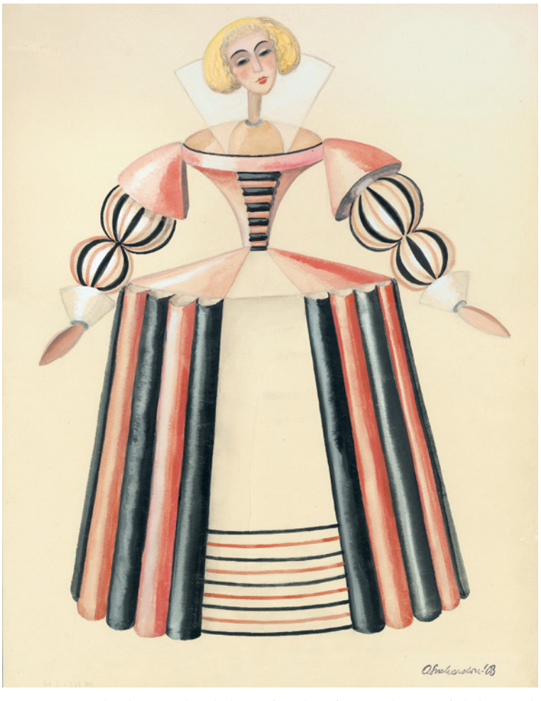
Fig. 3: Anna Suchardová-Brichová's design for Olivia for a production of Shakespeare's Twelfth Night (Večer tříkrálový). The Říše loutek Theatre, Prague 1925.

tone of the previous repertoire and, of course, on the popularity of the figures of Spejbl and Hurvínek), whereas the Central Puppet Theatre was seen to be the bearer of 'progressive' techniques. The fight of these two Prague theatres, both struggling for spectators' favour and popularity (the Skupa Theatre was able to preserve audience loyalty without abandoning its own style), mirrored many cultural-political fights of the period, and would deserve an independent study.