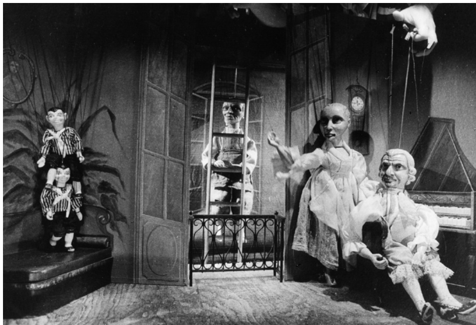
Fig. 7a+b: A scene from Petr Forman's production of Baroque Opera (Barokní opera) , based on Karel Loos's The Czech Opera of the Chimney , ca.1770 ( Opera bohemica de camino ). Scenography by Jan Marek. Divadlo bratří Formanů, Prague 1992.