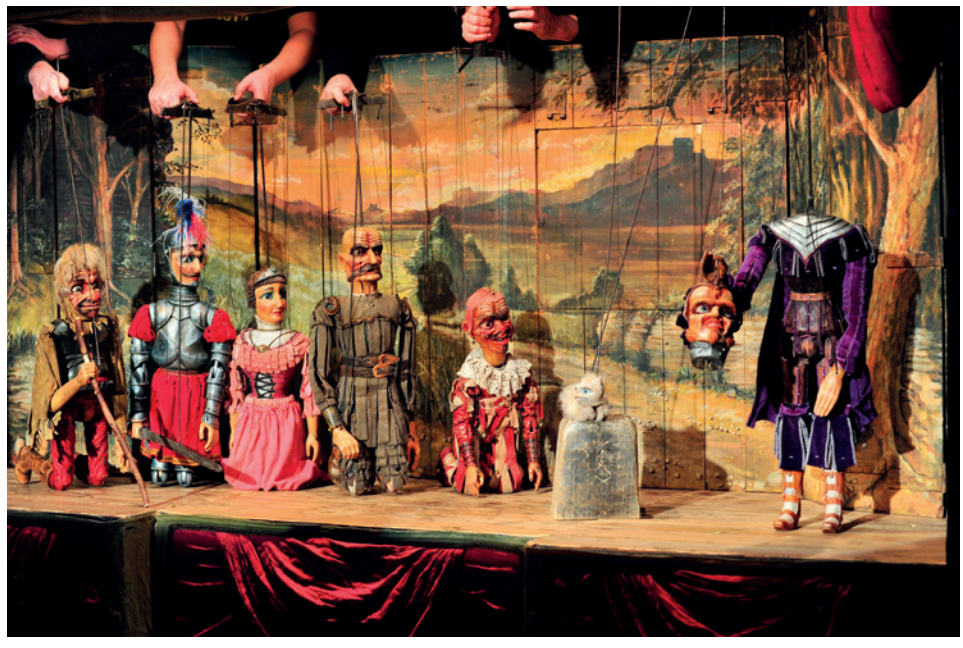
Fig. 8: Tomáš Dvořák's production of Iva Peřinová's The Headless Knight (Bezhlavý rytíř) . Scenography by Ivan Nesveda. The Naïve Theatre Liberec, 1993.