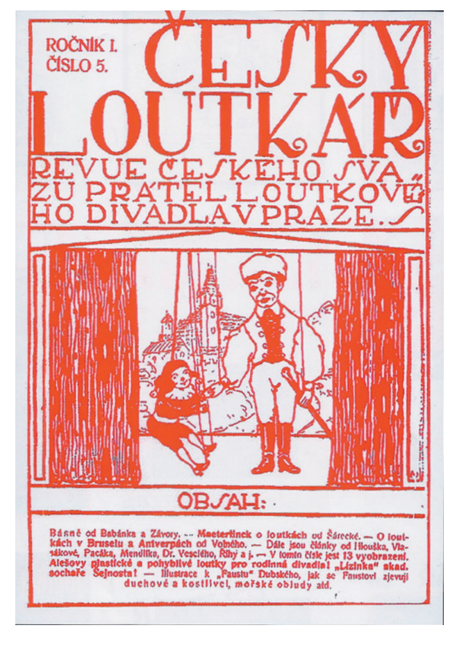
Fig. 1: Josef Váchal's title page of the revue Loutkář (1912).

together.<sup>2</sup> Skupa's artistic emancipation culminated in the foundation of Professor Skupa's Pilsen Puppet Theatre, which could, in its time, not only compete with modern European puppet scenes (particularly the German one), but ultimately gained a privileged position among them. Just like everywhere else in Europe (not only in Germany, but also in Switzerland, France and England), the fight for the modern form of puppet theatre contained a searching for new, modern design that would include not only the visual stylisation of puppets, but also the solution of the acting space and puppet design and construction (in the context of the visual art of the period, for example first abstract puppets appeared). Hand in hand with these refinements, came changes of dramaturgy: besides spectacular semi-variety shows, original modern plays appeared, such as Václav