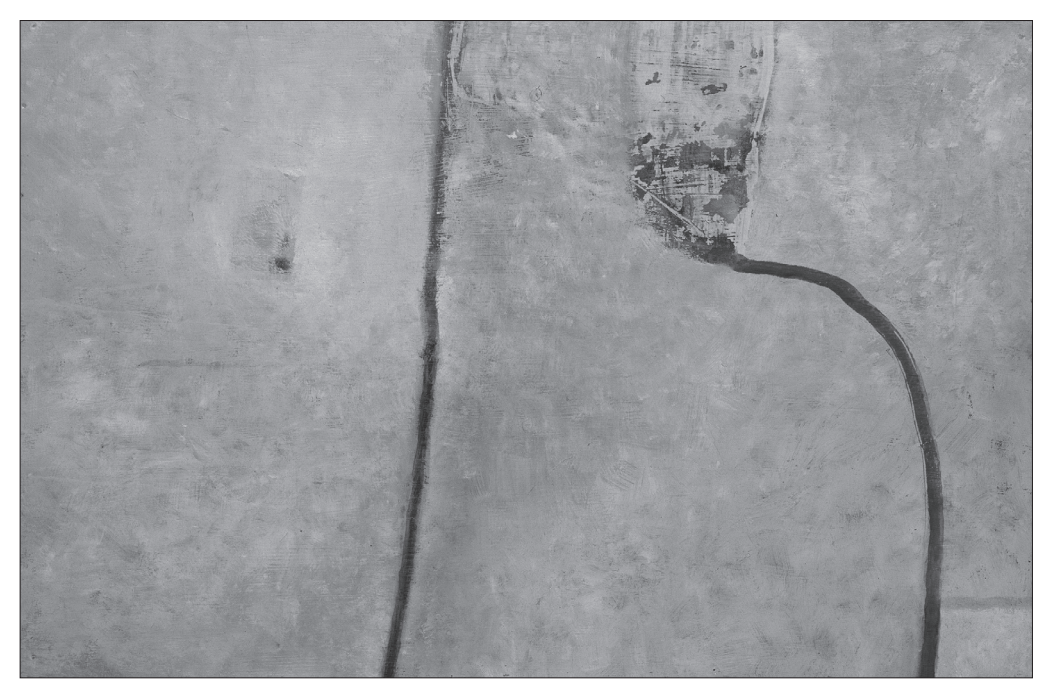
Fig. 1: Baroque Landscape (1997). © Jaroslav Malina.