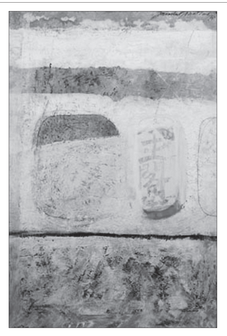
Fig. 3: Not Too Much of Anything (1997). Reprodukce poskytl Joe Brandesky. © Jaroslav Malina.