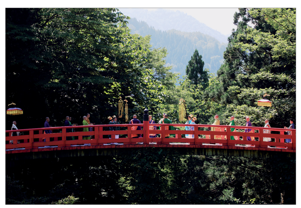
Fig. 41: Encounter of the indō group with the raigō group.