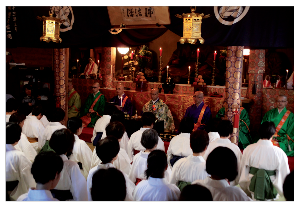
Fig. 39: Ritual in the Enma Hall.