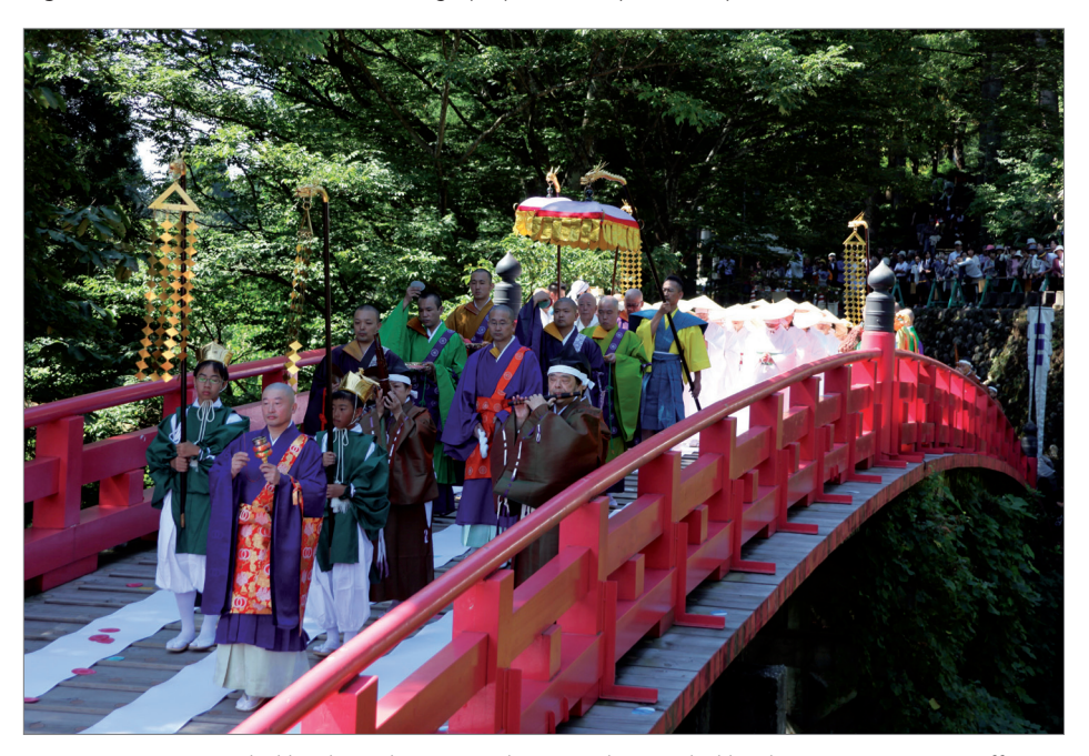
Fig. 40: Participants led by the indō group.