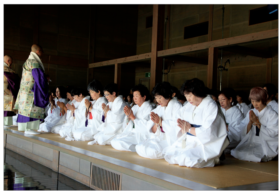
Fig. 42: Ritual in the Yōbōkan.