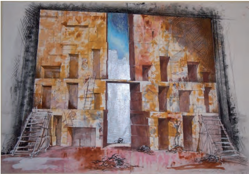
Jaroslav Malina. Scene Design for Oidipús vladař (Oedipus the King). Temple. National Theatre, Prague, 1996. From the Collections of the Theatre Research Institute at OSU. No. SPEC.CZ.DES.36.