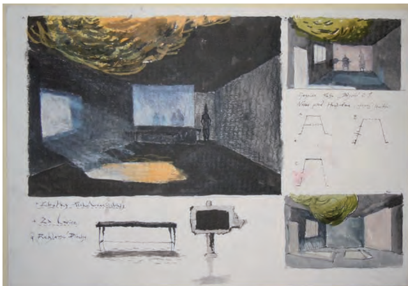
Jan Štěpánek. Scene Designs for Gazdina roba (The Farmer's Woman). Uherské Hradiště Theatre, 2000.

No. SPEC.CZ.DES.155.