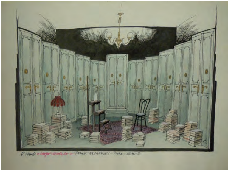
Ivo Židek. Scene Design for Largo Desolato . Theatre on the Balustrade, Prague, 1990. From the Collections of the Theatre Research Institute at OSU. No. SPEC.CZ.DES.115.