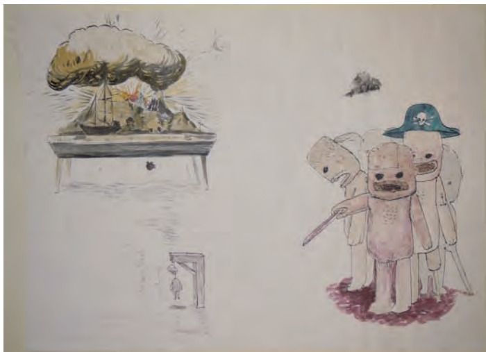
Jan Štěpánek. Sketches for Ostrov pokladů (Treasure Island). Jihočeské divadlo – Loutkohra (also called Malé divadlo ), České Budějovice, 2006.

From the Collections of the Theatre Research Institute at OSU. No. SPEC.CZ.DES.155.