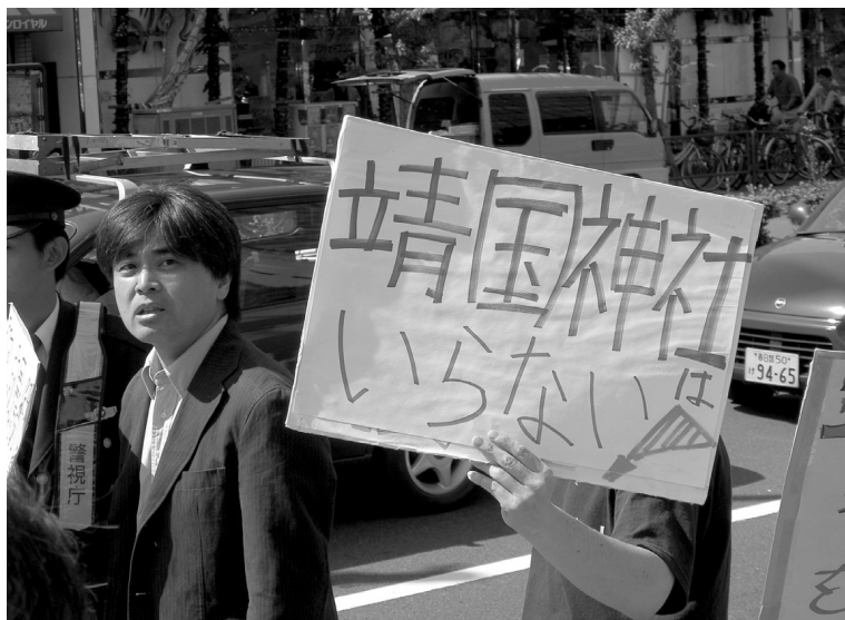
Fig. 7 Anti-Yasukuni protests in central Tokyo.