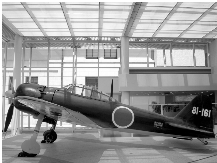
Fig. 6 Displays at Yushukan – infamous Japanese “Zero” fighter.