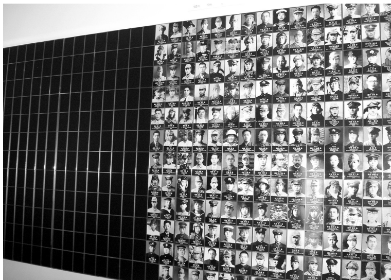
Fig. 3 Displays at Yushukan – photos of the kami enshrined in Yasukuni. Photo: author, April 2004.

Shinto as a “non-religious” ideology and used it to consolidate the power of the newly conceived Japanese Empire. State Shinto emphasized the old myths by speaking about the divine origin of Japan, Japanese imperial family and of all the Japanese people and incorporated some Confucian elements, such as the ideas of self-cultivation and loyalty towards the family and the state. 7 It formed a new nation-building ideological system strongly influenced by the thoughts of kokugaku (“National Learning”) scholars and by other intellectual movements of the Edo Period. During the World War II the Yasukuni Shrine was already a very powerful symbol for those who served the country and the Emperor, especially for the staff of the Japanese Army. Before embarking on a suicide mission, soldiers supposedly used to tell their comrades they will meet again at the Yasukuni. 8