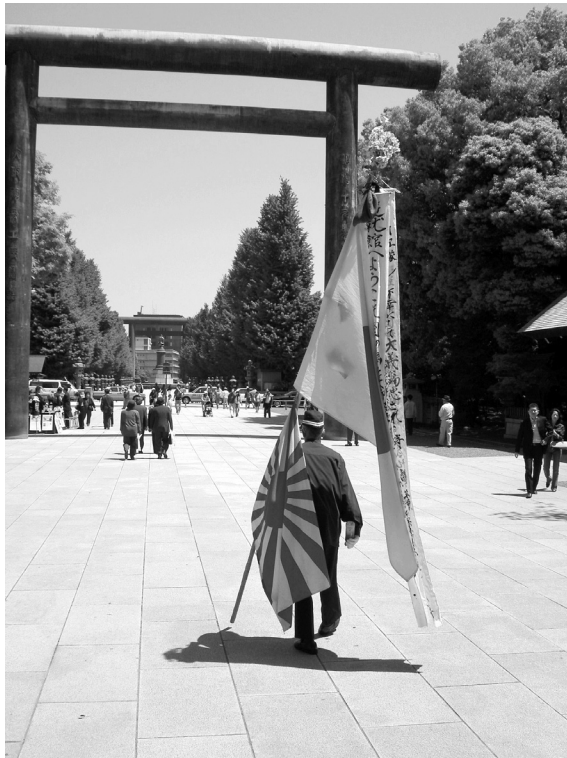
Fig. 2 Yasukuni Shrine's precinct. Photo: author, April 2004.

This short paper cannot – and does not intend to – analyze all questions posed by the Yasukuni issue to the science of religions. It treats mainly the topic of ancestor worship as it is officially presented to be the undercurrent of the faith of the Yasukuni Shrine. Even though the worship of dead as “deities” ( kami ) has a long tradition in Japan, the worship of dead in the Yasukuni Shrine seems to be a typical case of “invented tradition”, 5 bearing some new distinctive features if compared to the previous practices.