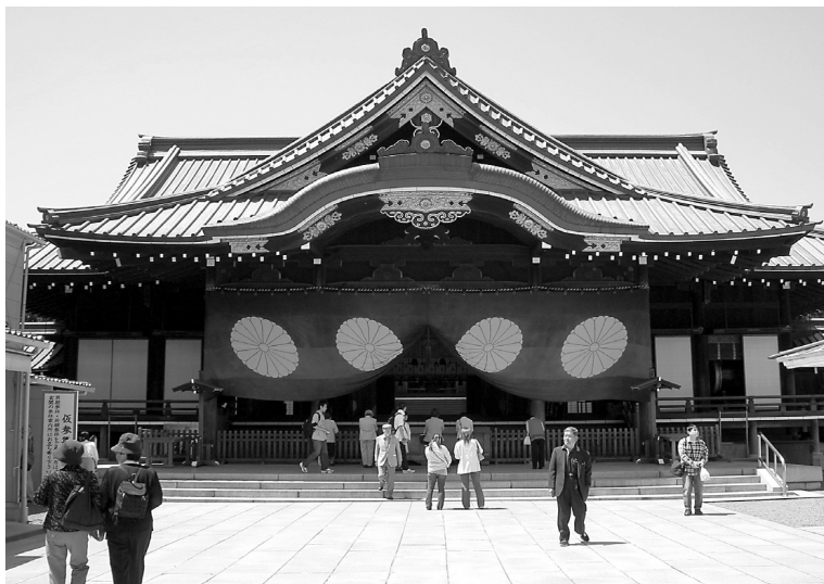
Fig. 1 Yasukuni Shrine, Tokyo.

There seems to be a simple explanation why the neighbours of Japan firmly denounced the Prime Minister's visit to the Shrine. China and Korea had suffered under Japanese occupation during the World War II. Moreover, the Yasukuni Shrine enshrines not only the "souls" or "spirits" of innocent victims of war. The Book of Souls kept in the Shrine contains also the names of Japanese war criminals, including 14 wartime leaders convicted of crimes against peace or against humanity at the International Military Tribunal for the Far East. Not only the representatives of foreign countries but also some Japanese politicians and activists consider the Shrine to be a living symbol of Japanese militarism, ultra-nationalism and war aggression rather than a sacred memorial dedicated to the victims of war (cf. fig. 7).