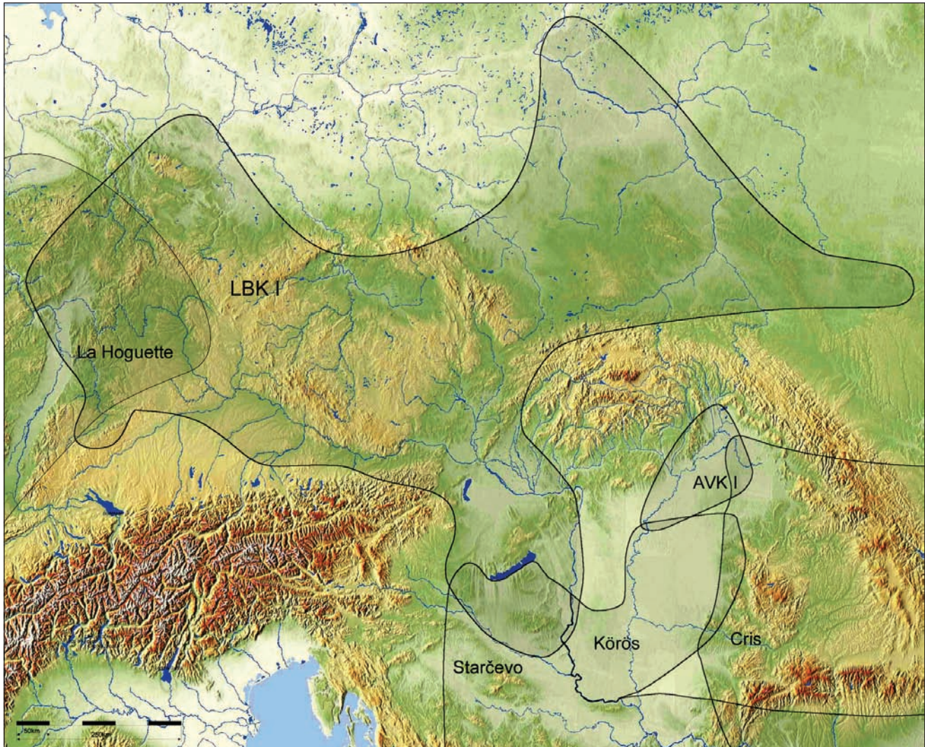
Map 2. The Early Neolithic in central Europe.

present state of research allows no firm conclusions to be drawn.