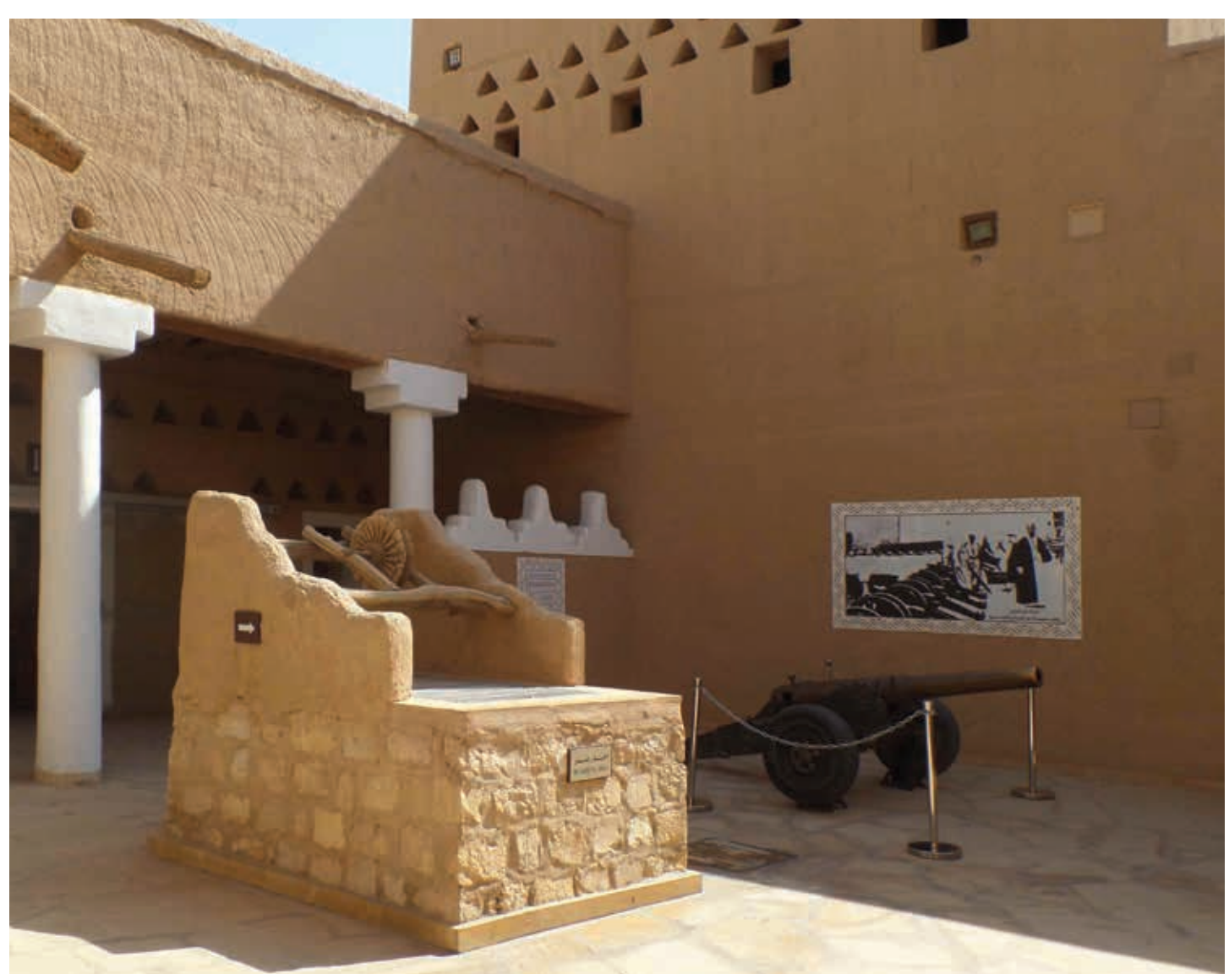
Fort Masmak Museum – Yard

National museum narratives are way subtler as they focus on one key component of Saudi national identity: Islam and the role of Allah in the existence of the Kingdom of Saudi Arabia. Riyadh National Museum aims thus to present the story of Islam "as understood by Muslims" as part of the history of Saudi Arabia. In fact, the nearly 30 000 m² are divided into two wings: one telling the story of Arabia before the advent of Islam in the seventh century AD, and the other telling the story of Islamic Arabia until the death of King 'Abd al-'Aziz in 1953. The two wings are linked by a corridor shaped with a colourful frieze