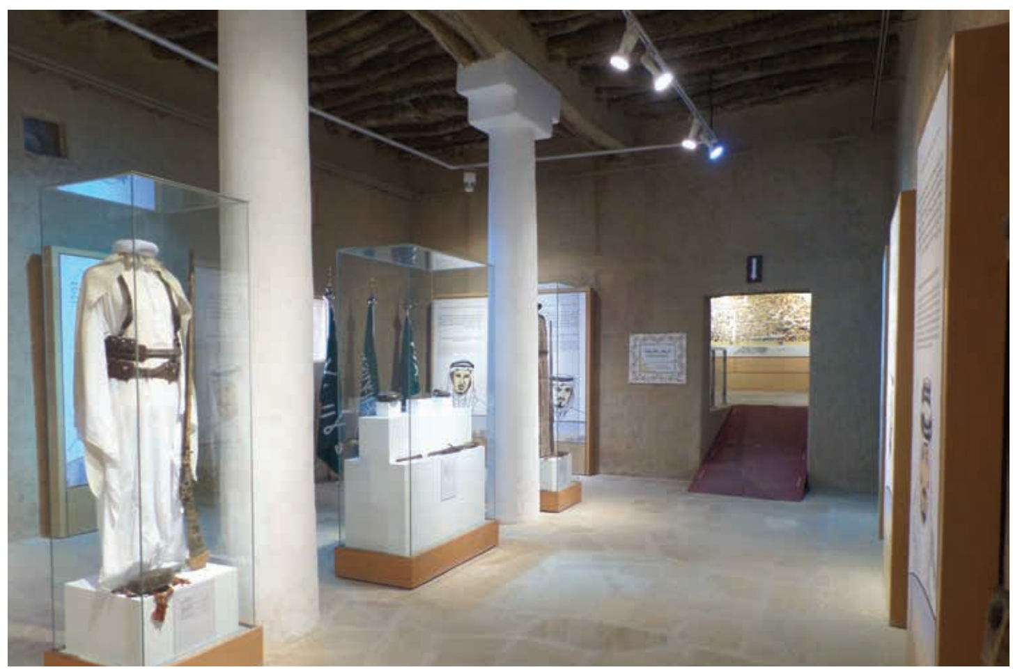
Fort Masmak Museum - The Pioneers

to work hard to regain both its regional position and its legitimacy among Saudi citizens.