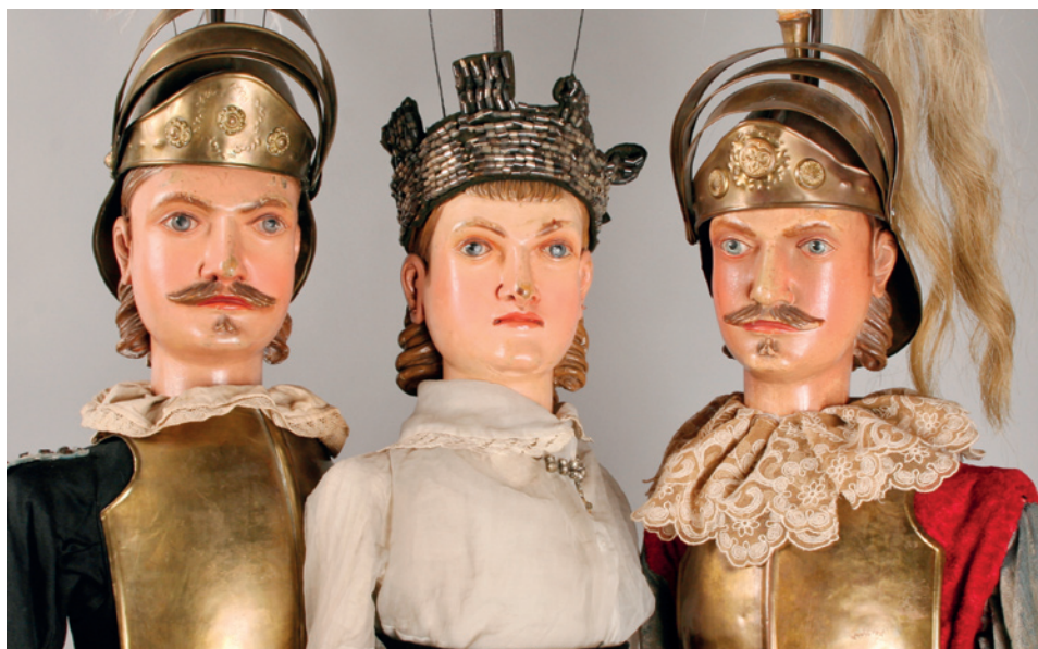
Fig. 13: The largest marionettes of the Flachs family from the exclusive set of the so-called 'Berouseks'. (Note the reiterating type of the young aristocrat.)