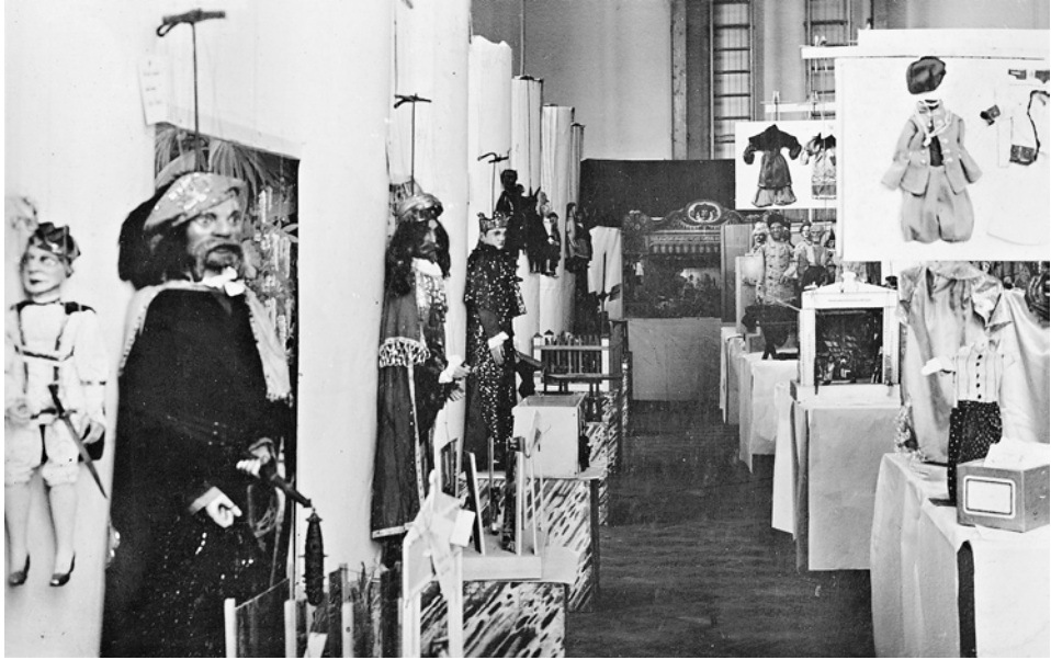
Fig. 17: Marionettes belonging to Josef Flachs at a puppetry exhibition in Uherský Brod, 1936.

the 'Puppet Museum' in Štramberk. In both cases, the marionettes' origin is unconfirmed. According to the information available, they were acquired gradually, namely from the descendants of the Flachs family relatives, from antique shops and from art dealers.