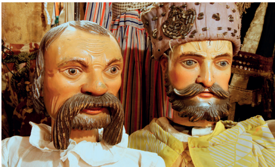
Fig. 16: Marionettes of the Peasant and the Count from the Flachs family exclusive set of the 'Berouseks'.