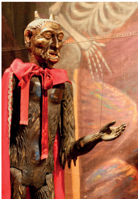
Fig. 14: Marionette of the Devil from the Flachs family exclusive set of the 'Berouseks'.