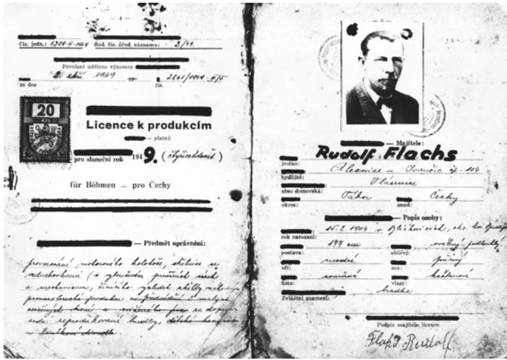
Fig. 4: Production licence of Rudolf Flachs, 2 September 1949.