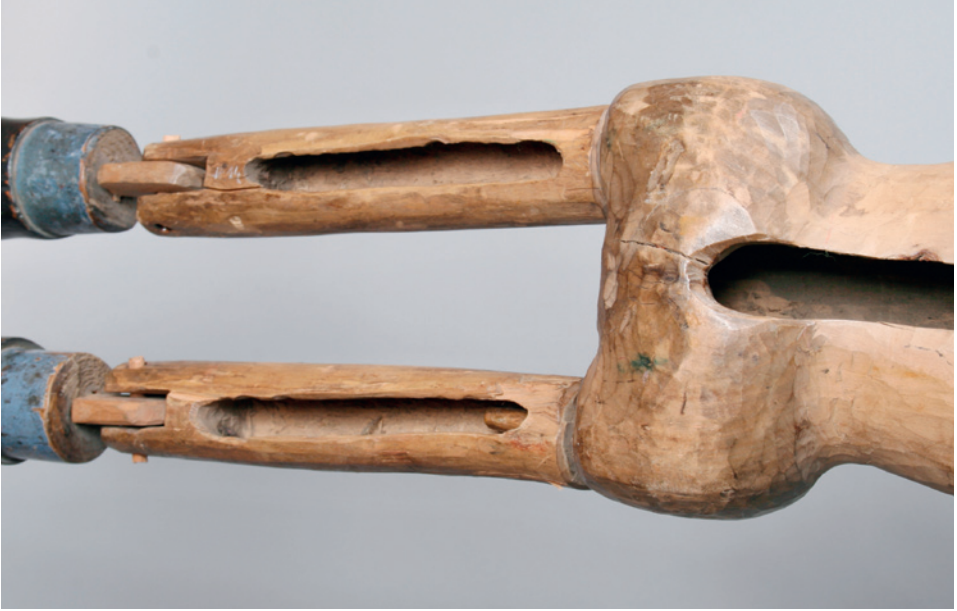
Fig. 22: The largest marionette from the Flachs family exclusive set of the 'Berouseks'; note the typical 'hollowing' of the trunk and the legs of the Flachs puppets. © Collections of MZM. Photo © Jaroslav Blecha.