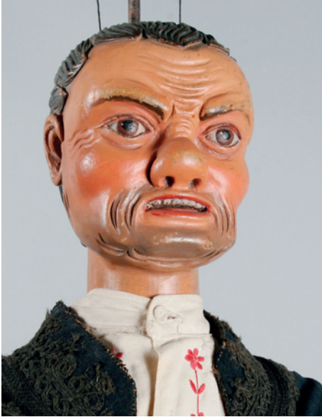
Fig. 18: The Peasant, a reiterating folk type. The largest marionette from the Flachs family exclusive set of the 'Berouseks'.