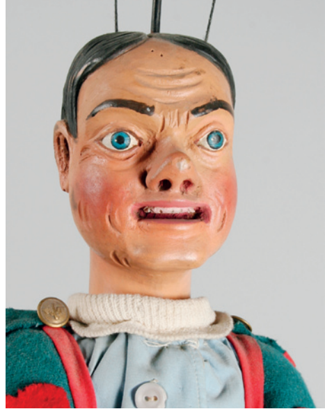
Fig. 19: The Peasant, a reiterating folk type. A smaller marionette of the Flachs; the Rudolf Flachs set.