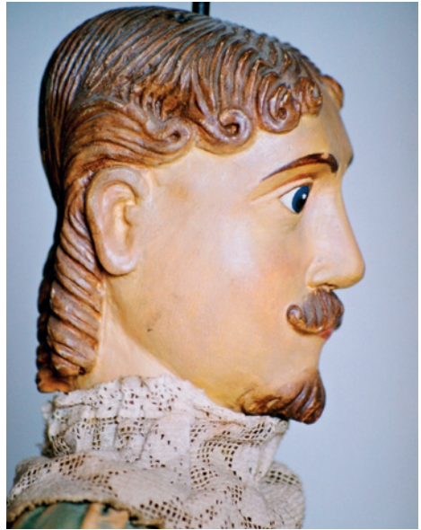
Fig. 21a–d: An Aristocrat with a beard, a reiterating folk type. A smaller marionette of the Flachs of unknown provenance. © Collections of MK. Photo © M. Brhel.