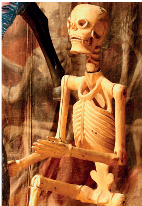
Fig. 15: Marionette of Death from the Flachs family exclusive set of the 'Berouseks'.

© Collections of MZM. Photo © Jaroslav Blecha.