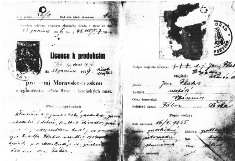
Fig. 3: Production licence of Jan Flachs Jr., 23 December 1936.