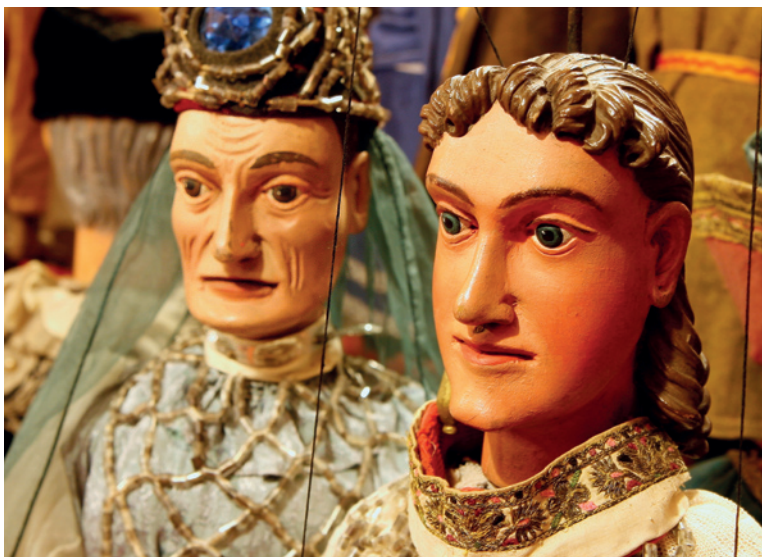
Fig. 24: Marionettes of the Queen and the Countess from the Rudolf Flachs set. © Collections of MZM. Photo © Jaroslav Blecha.