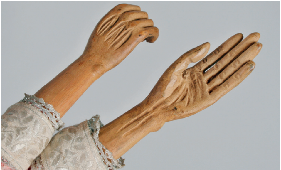
Fig. 23: A smaller marionette of the Flachs; the Rudolf Flachs set; note the typical execution of the carving of hands of the Flachs puppets. © Collections of MZM. Photo © Jaroslav Blecha.