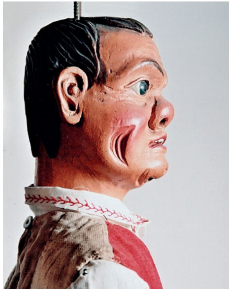
Fig. 20a+b: The Peasant, a reiterating folk type. A smaller marionette of the Flachs of unknown provenance.