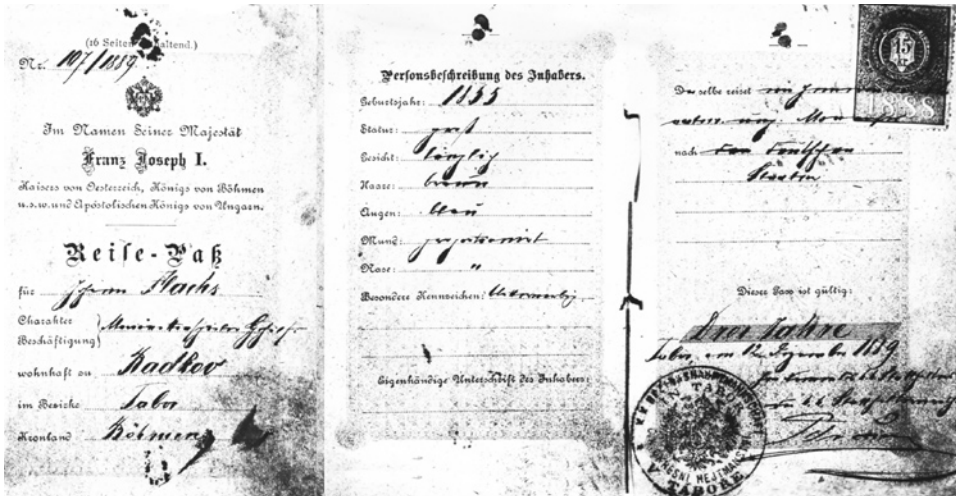
Fig. 1: Passport of Jan Flachs Jr., 1889.

which dictates its close dependence on conventions. The expressive means of puppet performance co-create the style. In such a case, confirmation of the tradition of which it is an on-going part and the development of this sense of continuity may even become a progressive feature.