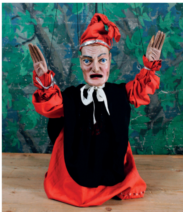
Fig. 25: Puppet of the Dupák (the stamping man) from the Rudolf Flachs set. © Collections of MZM. Photo © Jaroslav Blecha.