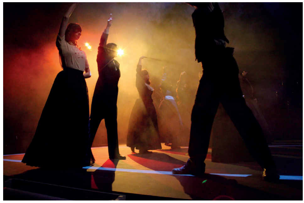
Fig. 9: Photograph from the Ohio State University production of aPOEtheosis showing Poe with and actors dancing during the Masque of the Red Death sequence.