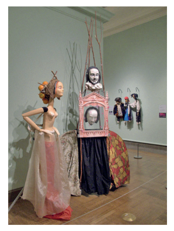
Fig. 1: Installation of figures from Petr Matásek's designs for Miranda and Prospero from The Tempest (2002), collections of the Naïve Theatre, Liberec.

and Irony 2: František Tröster and Contemporary Czech Theatre Design (2004), and Jaroslav Malina: Paintings and Designs (2009). The three previous exhibits were well received by local audiences in general and by critics specifically. This led to a partnership among the Columbus Museum of Art, the Ohio State University, and the Arts and Theatre Institute in the development of a potentially popular Czech puppet exhibit and an accompanying theatre production. The first two words of the title for the exhibition, Strings Attached, was not a simple reference to the marionettes to be shown, but was rather a play on words that referred to the lingering influences – threads of techniques – that can be linked from the past down to the present. Through the exhibition, American audiences were able to connect the lines of puppet development in the Czech lands from nineteenth-century family companies travelling from village to village all the way to twentieth- and twenty-first-century stop action and digital films.