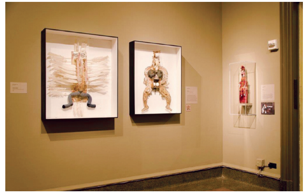
Fig. 5: Androgyn (1990), Icarus' Bride (1990), and Punch (1964) by Jan Švankmajer, collections of Athanor Ltd., film production company.

The 'string' that appeared to interest many younger exhibition patrons was the connection between puppets, and animated and digital films. American filmmakers such as Tim Burton and the Brothers Quay have previously asserted the influence on their work of Czech artists such as Jiří Trnka, Jiří Bárta and Jan Švankmajer (all of the latter had items in the exhibit), and many of the films by these three Czech artists have direct relationships to puppetry. After viewing the historical panorama of Czech puppetry, American audiences were given the chance to compare what they had seen in the galleries to scenes from recent live action and digital animation films. Many voiced surprise at the number of connections they could see between the artefacts and the films. All three of Jan Švankmajer's items in the exhibit stretched viewer's notions away from traditional puppet usage, but one forged a link with the past. His stringless Punch, from the stopaction film Punch and Judy (1964), bore an unmistakable relationship to the historical representations of Kašpárek marionettes seen in another room of the exhibit.