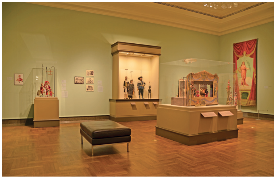
Fig. 4: Ales's Puppet Theatre, 1913, by František Kysela, collections of Marie and Pavel Jirásek.

Bar and Blackamoors emphasised a fascination with the exotic that is to be understood in a time when foreign travel was infrequent.