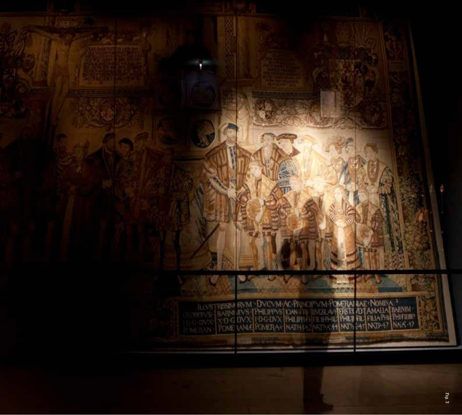
Fig. 1 – Skull of a soldier , Pomeranian Museum Greifswald 2

The skull does not tell the story “smoking is dangerous; it can kill you,” but instead stands for the growing tobacco industry in 18th-century Pomerania. It says smoking became popular. And there is a little sub-story: they smoked tobacco with white clay pipes, and you can see where the pipe stuck in his face.