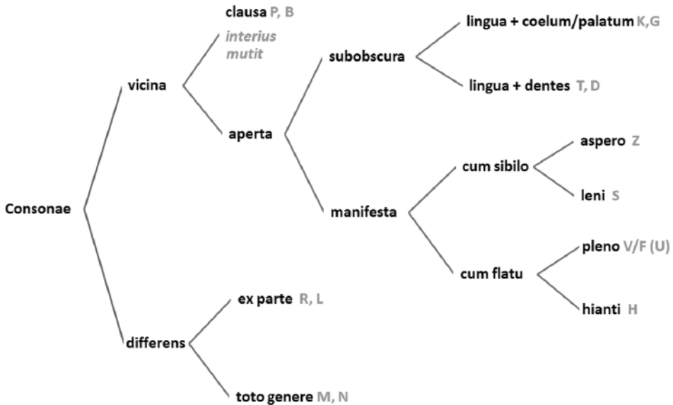
Figure 3: Anonymous's De litteratura Slavorum germanissima , 1598–1606. Division of consonants

Anonymous changed Ramus's classes and defined the basic elements of the sound inventory differently. It is an open question whether Anonymous changed Ramus's system with the specific intention of doing so or whether he was merely inspired by Ramus's