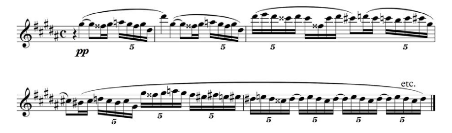
Ex. 4 Piccolo passaggi in seventh statement.

tremolo a perfect fourth doubled in three octaves and chromatically descending over the span of the whole bass statement; a "thick" passus duriusculus leading directly to the following statement of the bass theme.