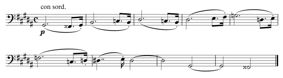
Ex. 2 Passacaglia bass theme.

From this note starts the slow unfolding of the Passacaglia's bass theme with its gradually fading retentions and fulfilled or unfulfilled protentions . The theme builds up steadily rising within the ambit of a diminished octave, which is clearly perceived as we reach the higher G natural (which is in itself an unfulfilled protention in relation to the expected G sharp!), and then descending through a sequence towards the dominant of G sharp, leaping down a perfect fifth to the tonic followed by the leading-note F double sharp. The overall clarity of the theme's structure makes it easily perceptible as a unity. There are, however, three aspects of it that need to be carefully examined: that of tonality, of rhythm, and of orchestration. As the following description will show, there is a dialectical play with regard to expectations, i.e. protentions, that make it rather unusual and, one may say, akoumenologically interesting.