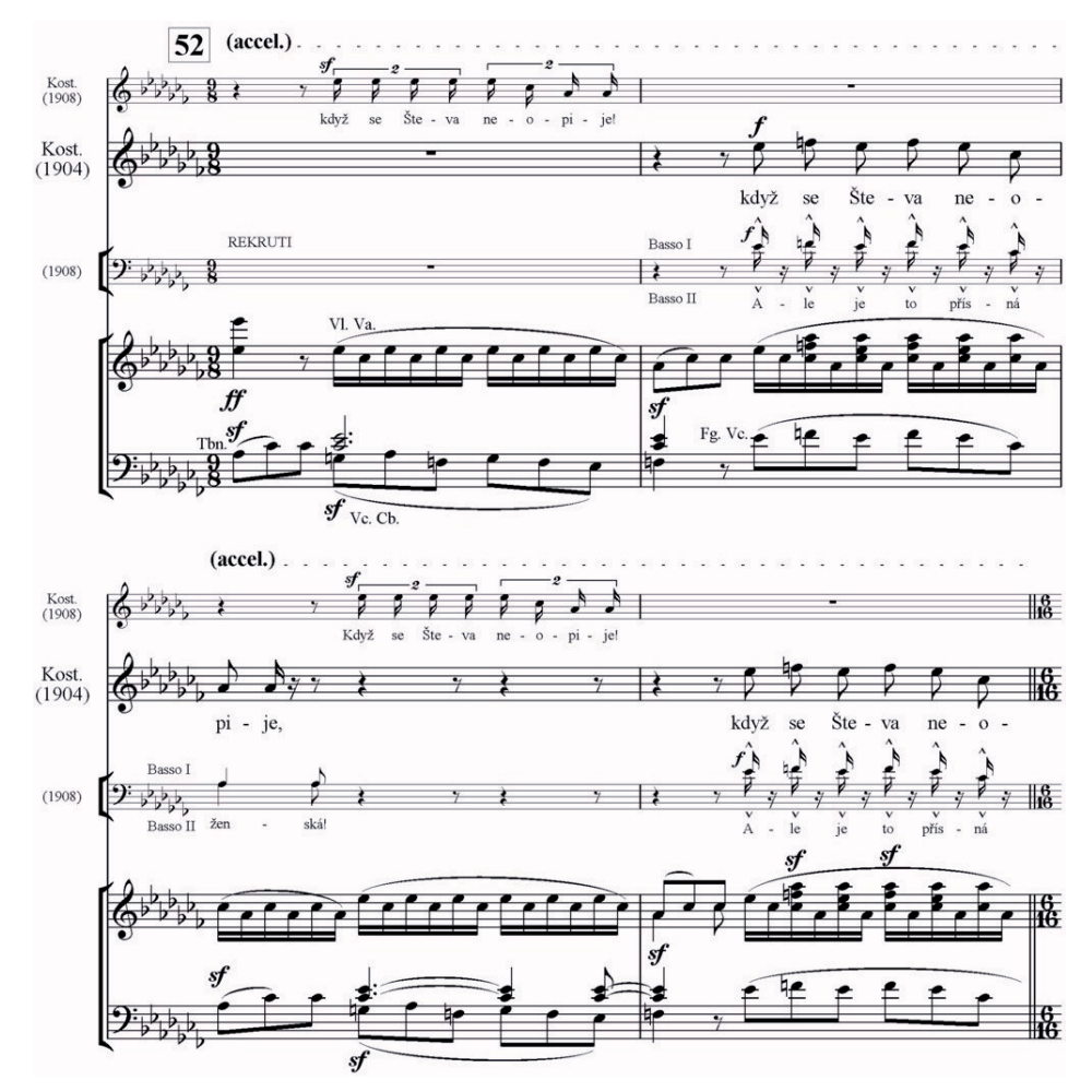
Ex. 2: End of Kostelnička's intervention in Act 1 (1904 and 1908 versions)

The fifth bar of Ex. 2 had originally been in 6/8. The "Più mosso" indication and change to 6/16 were added before the premiere: this much is confirmed by the orchestral parts. However, the libretto's very precise indication that the recruits' phrase is sung seven times makes clear that the vocal revisions in the first four bars of the example (shown in small notes in Ex. 2) came only later, probably in 1907/8.