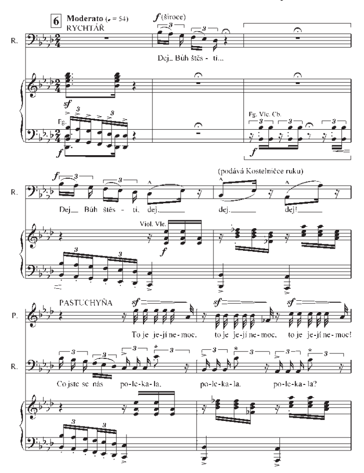
Ex. 1a: Reconstructed 1904 vocal line, entrance of Mayor in Act 3, scene 2

The corresponding vocal line, partly obscured in both ŠVS and ŠFS by pasteovers, is easily legible with a fibre-optic light, and the reconstructed passage is shown in Ex. 1a.