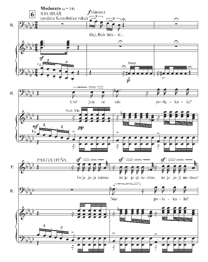
Ex. 1b: 1908 vocal line, entrance of Mayor in Act 3, scene 2

Two early revisions are evident: Janáček added the third bar (bracketed here) before the orchestral parts were copied; and the Mayor's asterisked notes in the last two bars 6 and 7 were originally an octave lower. Compared with the later 1908 revision (Ex. 1b below), with its different pattern of word repetition, the 1904 vocal line imparts to the whole passage a much greater feeling of regularity and symmetry, a characteristic of the premiere version in general and the voice parts in particular.