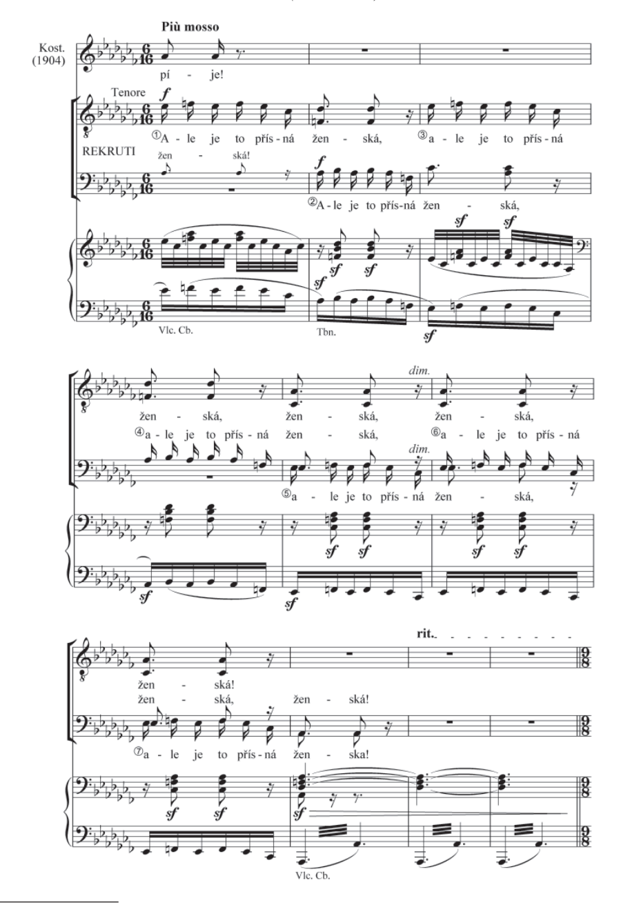
Ex. 2 (continued)

pects of the opera's overall shape at the time of the premiere. This is particularly the case in Act 1, where the inclusion of the Kostelnička's intervention "aria", "Aji on byl zlatohřivy", has long been the subject of debate. 13 Not only is this