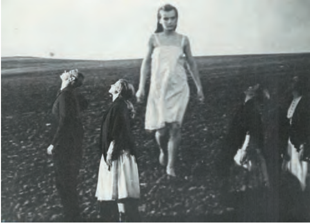
Otvírání studánek (The Opening of the Wells). The mysterious figure of a young woman.

of the Wells subsequently became part of the Variace 66 program (which the Laterna Magika sometimes performed on its trips abroad). Only a few written reactions to this performance have been preserved, and the reports of this staging also include expressions of doubt, or even rejection: