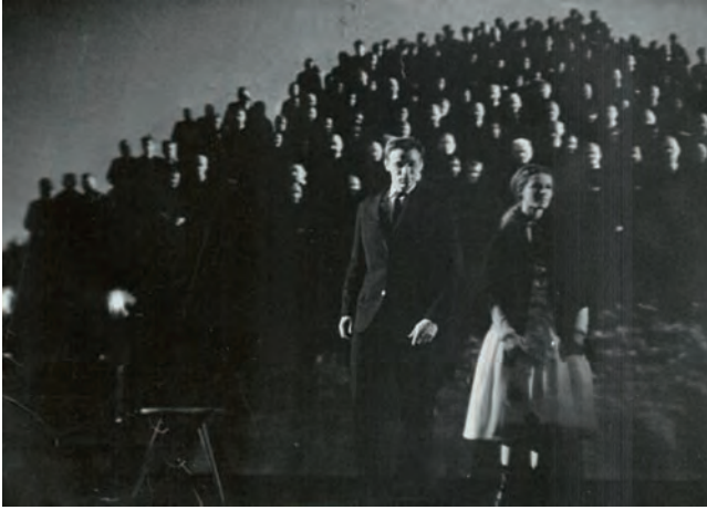
Otvírání studánek (The Opening of the Wells). The Groom with his Bride, and a throng of old men and women symbolising past generations.

that generate diverse relationships and a new organic whole. (GROSSMAN 1968: 74; English translation HAVRÁNEK 2002: 129).