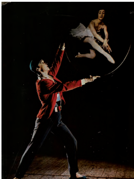
Laterna Magika at Expo 58. A popular gag: a live dancer dancing with the filmed image of his partner.