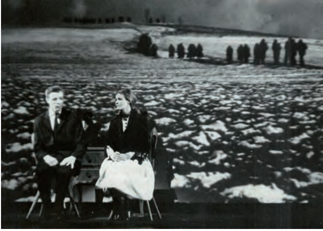
Otvírání studánek (The Opening of the Wells). The Groom and the Bride.