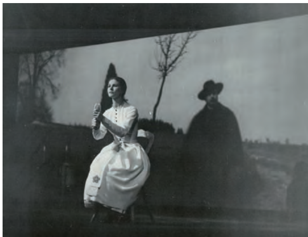
Otvírání studánek (The Opening of the Wells). The figure of the Wanderer in the background.