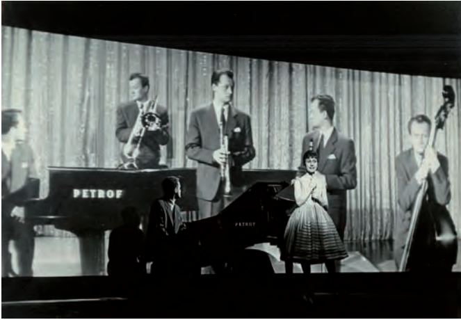
Laterna Magika at Expo 58. The live pianist is multiplied in the projection.