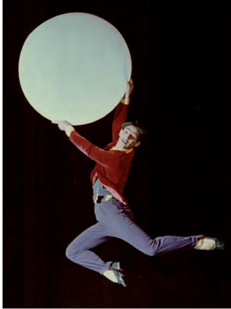
Laterna Magika at Expo 58. A popular gag: a live dancer dancing with the filmed image of his partner.