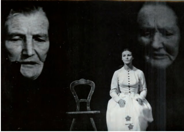
Otvírání studánek (The Opening of the Wells). A contrast of youth and old age.

the Groom at the threshold of their house, lies down and a child is born, the heart-broken Groom looks down somewhere, as if into a grave, and the former happy expression of the Bride is replaced by the tragic visage of a woman with tears in her eyes. This ‘story’ seems to unfold linearly, but ends with repetition of the picture of the pair at the wedding table. Similarly, several ‘portraits’ of women pass through the film, beginning with the happy face of a whirling little girl, followed by a treble picture of an adolescent girl (passing through a ploughed field in a white chemise, standing in a pink dress amongst green and then ripe grain) and complemented by the faces of old village women. However, at the end, we enigmatically return to the picture of the girl in the ploughed field. Thus, linear time passes unobtrusively into cyclical time, supported by the absolute parting of the time of the film and the time of the text – the procession of villagers passes through the landscape from spring to winter, the seasons of the year change without any logical connection. ‘The sky’s ablaze with the flames of rowanberries, / And you can smell the perfume of the last hay’, sings the Pilgrim, as the procession passes through a snowy landscape.