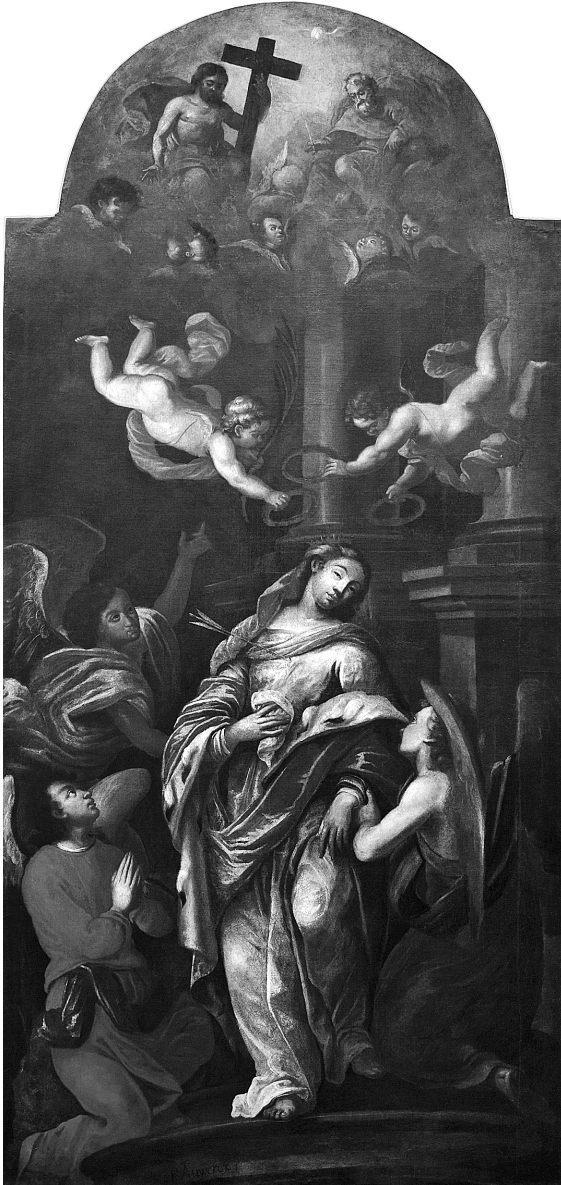
Fig. 4: Peter Auwercx, The Death of St. Ursula , 1711, Ursuline convent, Ljubljana.

ventory of the paintings in the churches of Baroque Ljubljana, Künstliche Mallerrey, welche in Laybach zu sehen . 17 Until recently, all these paintings were believed to have been lost, but during the study of the painting collection in the Ursuline convent in Ljubljana, a former