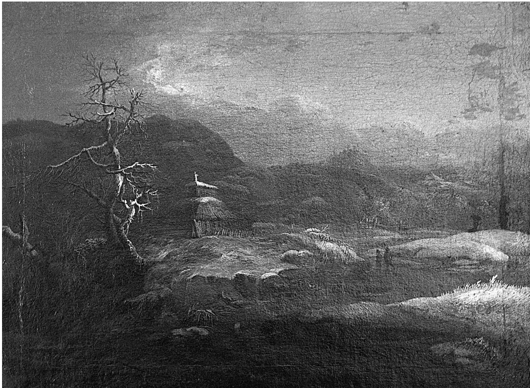
Fig. 7: Christian Johann Bendeler, A Winterlandscape Lighten up by the Moonshine, 1718, oil, canvas, Städtische Museen Quedlinburg / Schlossmuseum.