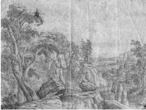
Fig. 5: Christian Johann Bendeler, Wood Landscape, chalk drawing, Staatliches Museum Schwerin, Kupferstichkabinett.