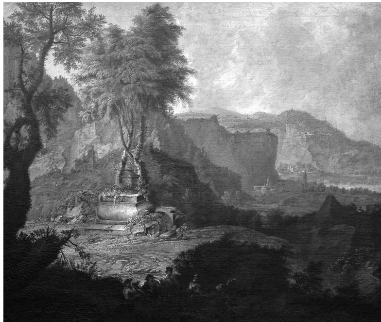
Fig. 4: Christian Johann Bendeler, Landscape with a Sarcophagus, 1720, oil, canvas, Muzeum w Gliwicach.