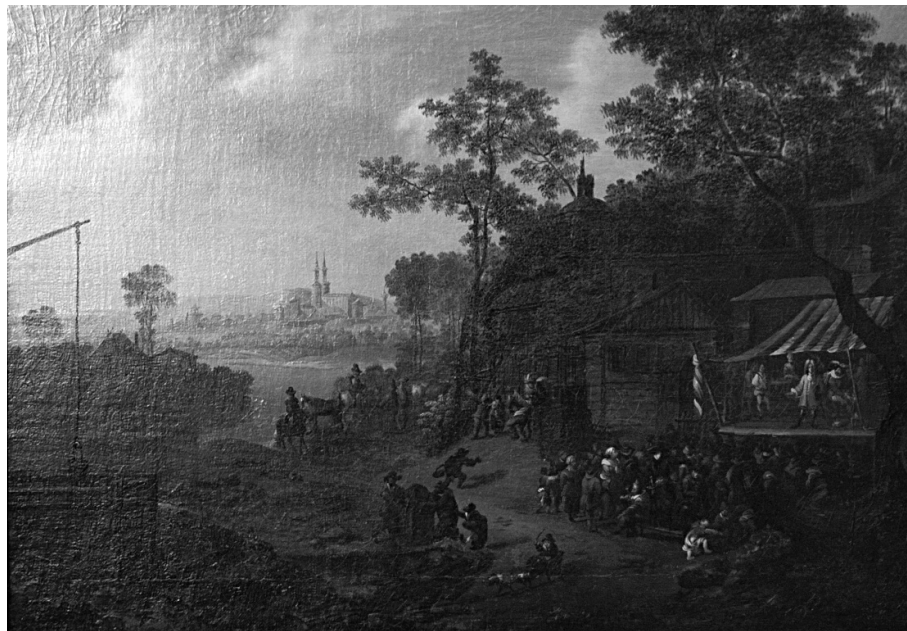
Fig. 1: Christian Johann Bendeler, Landscape with an Open-Air Theatre, 1720, oil, canvas, Städtische Museen Quedlinburg / Schlossmuseum.