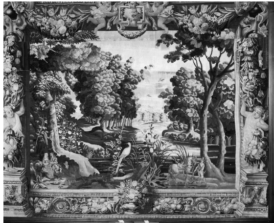
Fig. 5: Landscape with lovers, a bird and a horse (Inv. Nr. UO 484 T).

Jan Adolf, Prince of Schwarzenberg (1615–1683), who was the highest Lord Steward of Archduke Leopold Wilhelm, Governor of the Spanish Netherlands from 1647 to 1656, used to buy tapestries while he was living in Brussels. In this way he enlarged the family collection which had been established by his father, Count Adam. Archduke Leopold Wil-