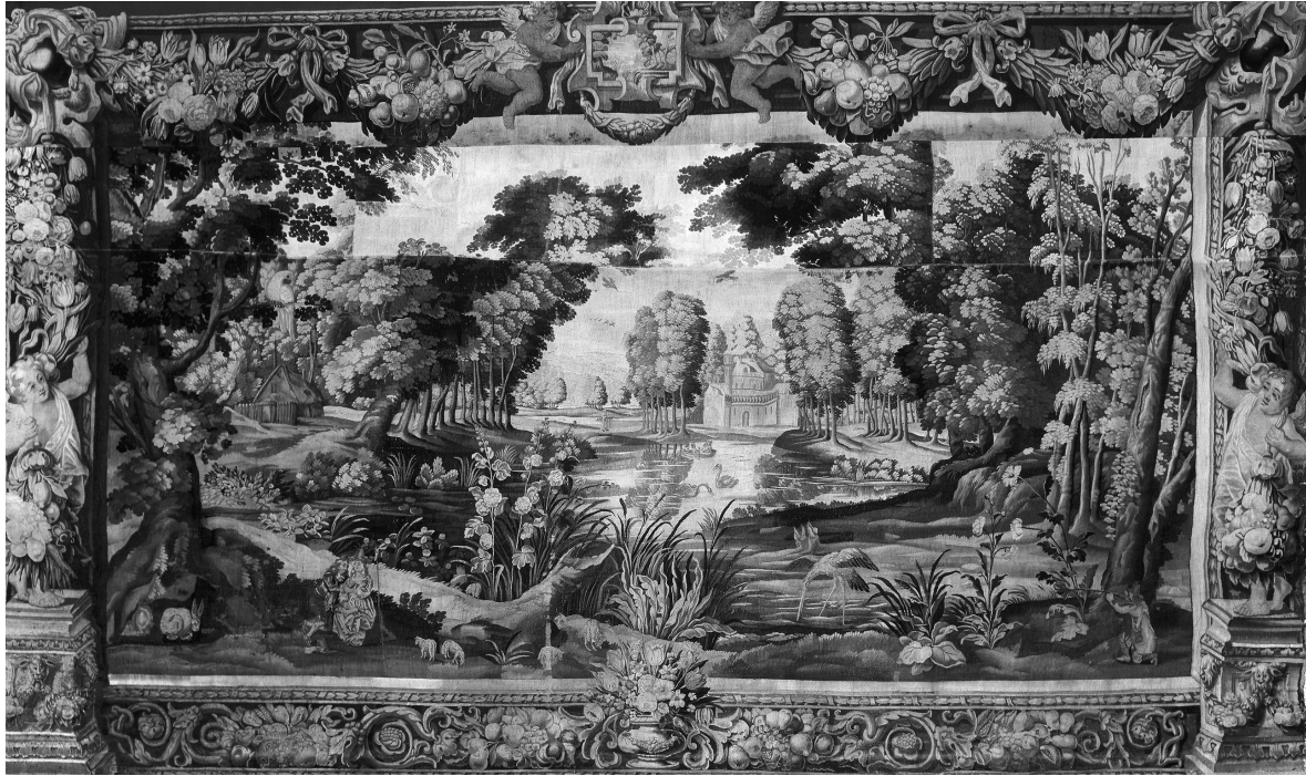
Fig. 3: The heron hunt (Inv. Nr. UO 483 T).

The six tapestries in the Regional Museum of Ptuj show landscapes with a girl by a pond, 21 with two hunters, 22 with the heron hunt, 23 with lovers, a bird and a horse, 24 with the duck hunt 25 and with the hunter with a dead duck. 26 The landscapes are densely wooded; however they open in the centre of the composition where ponds with a glittering surface are visible. In the distance there are houses, a castle, a church with a tall bell-tower and even a whole village. In the foreground the colours are green (as daylight has faded the colours through the centuries, the green has lost a lot of yellow and is now closer to blue) and brown, in the distance they are bright and shiny. In the near foreground there are bunches of grass and leaves of disproportionate size. The perspective is stressed with tree trunks tilted towards the interior of the composition. The landscapes are inhabited with animals and people. Ducks and swans are swimming in the