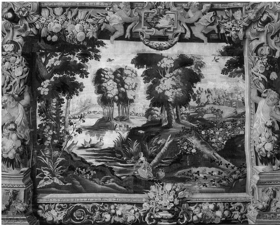
Fig. 4: Landscape with a girl by the pond (Inv. Nr. UO 481 T).

tract our attention. Both are seated in the foreground, one couple is absorbed in caressing, the other one is enjoying drinking wine while a horseman, taking care of a horse, is looking at them. All the figures are very small in comparison with the landscape and the tall grass and various flowers in the foreground.