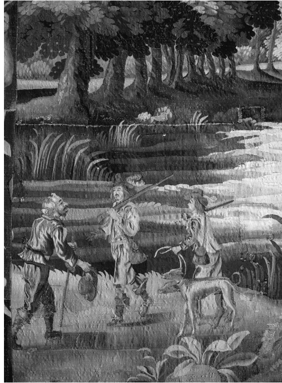
Fig. 1: The duck hunt, detail (Inv. Nr. UO 486 T).

At the beginning of World War II, there were ten pieces of tapestry in the castle. During the war all precious movables, among them the tapestries, were stored in the cellar under the main castle building; however, in 1946 the tapestries were returned for display. Ptuj Castle is the only public museum in Slovenia where old tapestries are on display to visitors, although there is quite a lot of evidence that castles and palaces in today's Slovenia were furnished with tapestries in previous centuries. Tapestries are quite often listed in old castle inventories. As the entries are