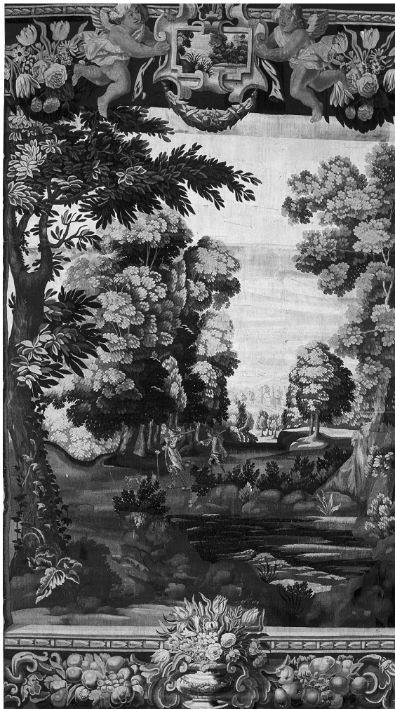
Fig. 7: Landscape with two hunters (Inv. Nr. UO 482 T).

wide borders, is not preserved (or more accurately, until now it has not been possible to identify it with any of the preserved series), but it is described in the correspondence between the art dealer Luigi Malo and Piccolomini, who wanted to buy a set of verdures for a gift. The description corresponds exactly to the appearance of the Ptuj verdures. Erik Duverger even thinks it would be possible that the mentioned series was the one described in the inventory from 1695 for Český Krumlov. 41