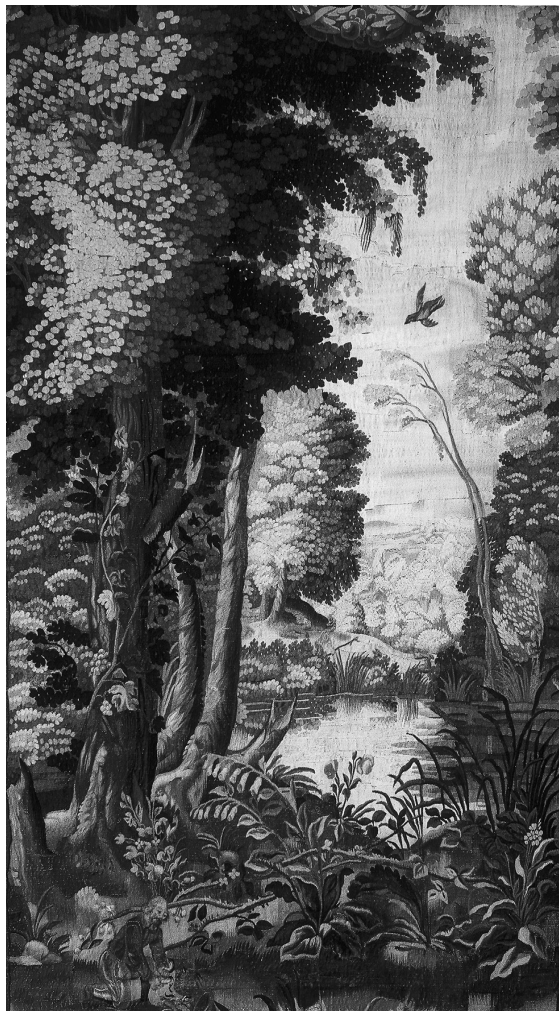
Fig. 8: The hunter with the dead duck (Inv. Nr. UO 487 T).

wide borders, is not preserved (or more accurately, until now it has not been possible to identify it with any of the preserved series), but it is described in the correspondence between the art dealer Luigi Malo and Piccolomini, who wanted to buy a set of verdures for a gift. The description corresponds exactly to the appearance of the Ptuj verdures. Erik Duverger even thinks it would be possible that the mentioned series was the one described in the inventory from 1695 for Český Krumlov. 41