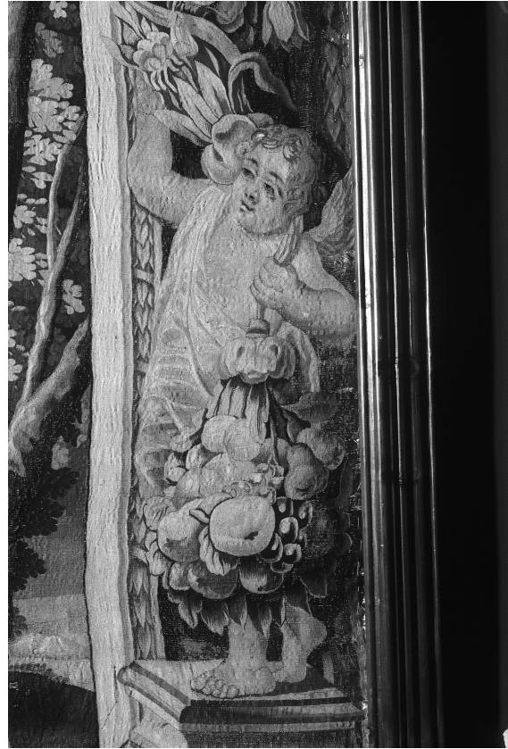
Fig. 2: The heron hunt, detail of the border (Inv. Nr. UO 483 T).

In 1997, the Regional Museum Ptuj ( Pokrajinski muzej Ptuj ) bought two tapestries on the art market, both dating from the end of the 17 th century. One is narrow, high and with a preserved border; it depicts a group of men and it was most probably woven in Aubusson. The other one presents a young