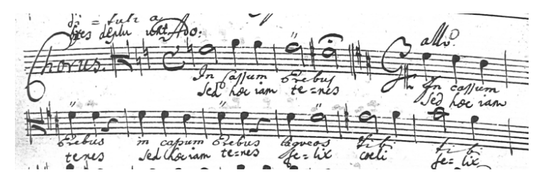
b) Oratorium 4, fragment of alto part