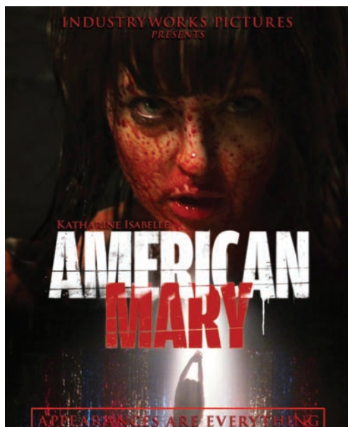
Figure 2. American Mary Poster

As Anthony Wilden argued in his 1980 book, The Imaginary Canadian , people living in Canada are forever trapped in a binary imaginary relationship with America. Sensing their own lack of identity, they feel compelled to construct an image of themselves in relation to the overwhelmingly powerful neighbor to the South. Either whole-heartedly embracing or utterly rejecting the signs of American imperialism, Canadians remain unavoidably entangled in US culture. While Harron's obvious satire of American materialism is representative of the latter attitude, projecting upon the States all that is negative about late capitalistic societies – including our own – our admiration for Patrick's body, his fancy clothes and his jet-setting lifestyle, represents the former where, as Canadians, we cannot help but yearn for the glittering splendor of the American Dream. But ultimately, horror for the Canadian emerges from the deep knowledge that, like Patrick Bateman, “we are simply not there.”