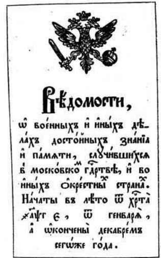
Example of Vedomosti front page from 1704. NB – the paper was written in Church Cyrillic 4

As can be seen from the example above, the Church Cyrillic script is rather difficult to read, and thus only a few people were able to access education and information. Therefore, the first and most significant reform of the Russian writing system was carried out in 1708. Peter the Great was the first ruler who, more than 800 years after the implementation of the Cyrillic alphabet, dared to point out some of its shortcomings and sought to remedy them. The Reforming Tsar, as