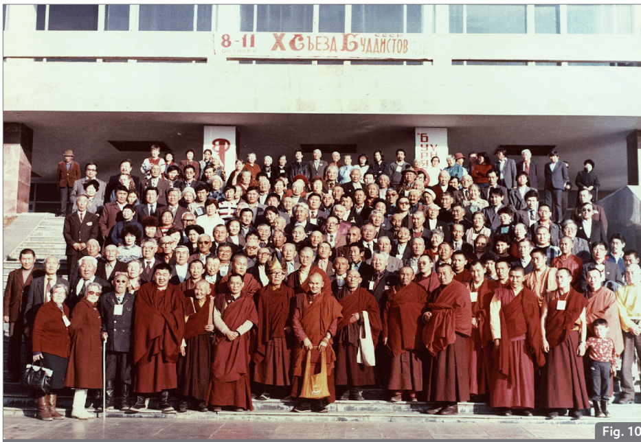
Common photograph of delegates, guests and visitors to the Tenth Congress of Soviet Buddhists; 8-11 October 1990.

exhaustion amongst the people. Moreover, it must be recognized that the Buddhist “boom”, typical of the turn of the 1980s and 1990s is past its prime. Nevertheless, the Buddhist way of life again permeates all levels of Buryat society and life. The attempts to return to a tradition which was violently interrupted in the 1920s and 1930s have been incredibly successful.