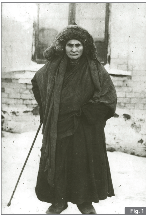
Agvan Dorzhiev, not dated.

The reformers represented about a fifth of the Buddhist clergy and were led by the well-known Buryat Lama Agvan Dorzhiev, 7 personal teacher and advisor to the 13 th Tibetan Dalai Lama Thubten Gyatso. A. Dorzhiev (see Fig. 1 and 2) held the prestigious title tsanid khambo ; “Master of Buddhist Philosophy” and was an official representative of Tibet at the Tsar’s court in Saint Petersburg (then Petrograd). Later, he became the Tibetan ambassador to the Soviet government in Moscow. The reformers wanted to restore Buddhism to its original state by effecting radical changes to the ecclesiastical structure, which would remove the past imperfections and would simultaneously bring the teaching and practice of Buryat Buddhism, and thus Buryat learning, closer to the modern context. Lamas, scholars, writers, politicians and philosophers who participated in the movement understood these planned reforms in a broader sense rather than purely religious. The reform itself consisted of the following points: