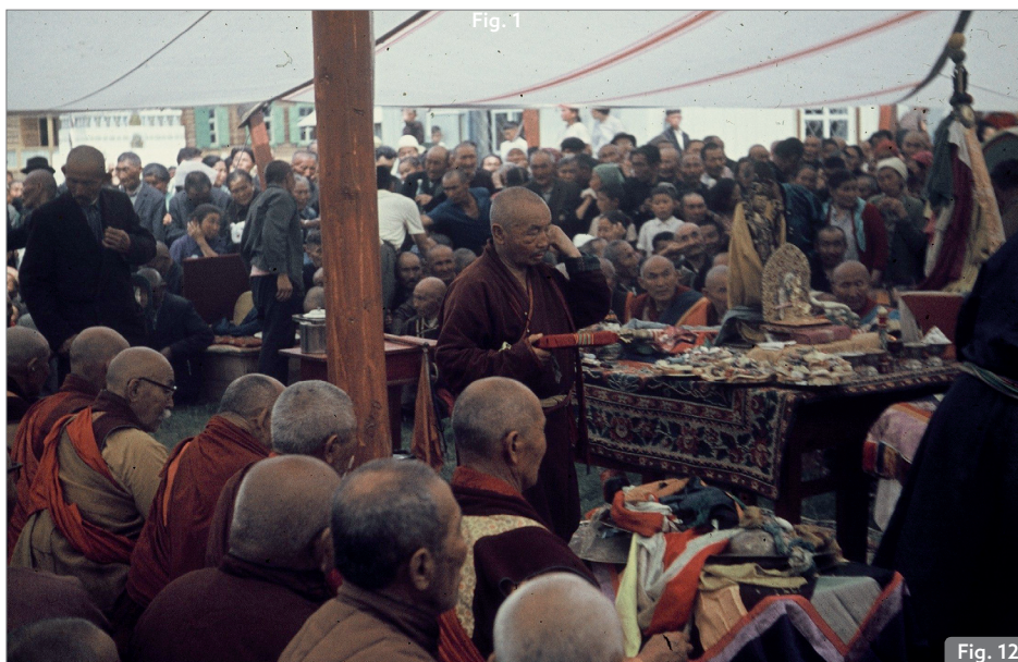
Buryat monks during the summer festival of the future Buddha Maitreya (Bur., Maidar khural ), Ivolginskiy Monastery, Buryatiapicture taken on 11 July 1967.