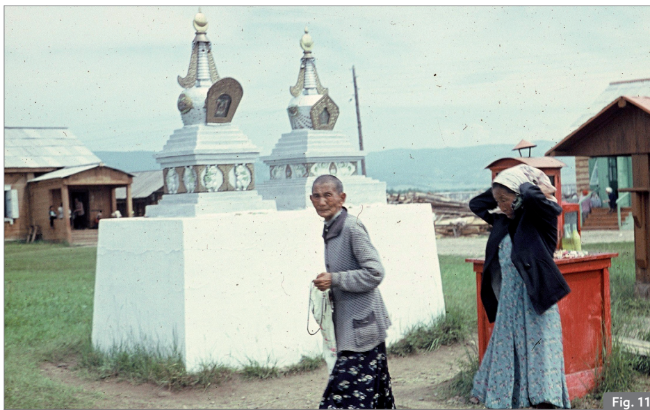
Buryat Buddhist lay women in front of a double stupa in Ivolginskiy Monastery, picture taken on 11 July 1967.