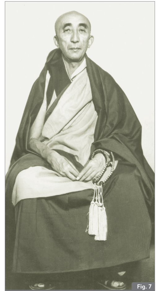
Kushok Bakula Rinpoche, an official photograph.