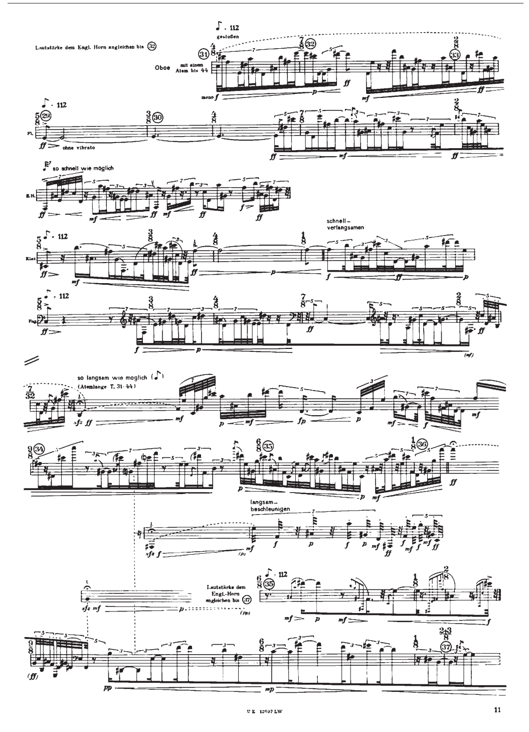
Ex. 4 Karlheinz Stockhausen, Zeitmaß e, mm. 29–37 © Copyright 1957 by Universal Edition (London) Ltd., London/UE 16297