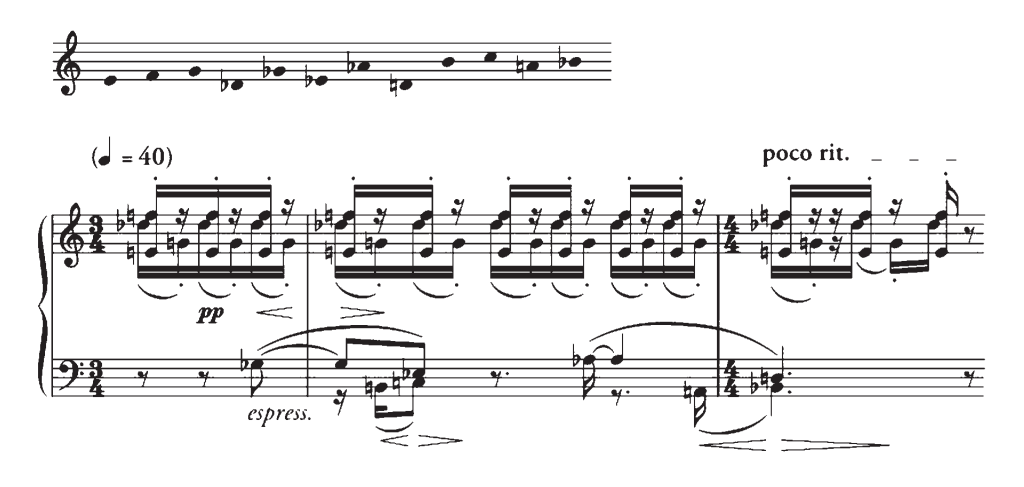
Ex. 1 Arnold Schoenberg, Suite, opus 25, prime form (P-0); mm. 1-3 of the Intermezzo

The changes Ligeti outlined in prose are better appreciated in conjunction with musical examples that represent the stages in his idea of historical progress. Ex. 1 gives the prime form of Schoenberg's first completely twelve-tone composition, the Suite for piano, opus 25, along with the opening bars of its fourth movement, the Intermezzo.