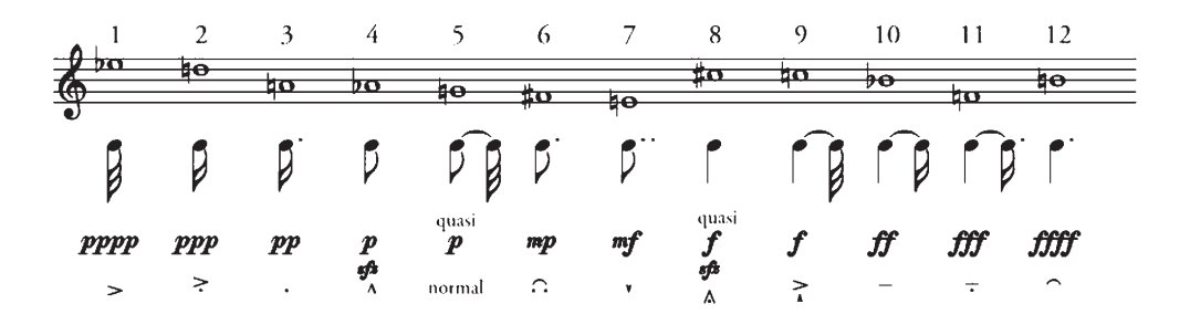
Ex. 2 Pierre Boulez, Structure la, series in prime form

Schoenberg wrote that he developed his new technique as a rule-based method for ordering free atonality (Ligeti referred to it the same way), and in the essay "Composition with Twelve Tones" Schoenberg described the new method as a necessary historical development dictated by the laws of nature. He therefore made an appeal to an objective truth beyond his own subjective compositional decisions. Ligeti made the same claim, stating that the serial principle "strove for expansion to the totality of form," which led to the "discrete quantification of all parameters" which I have given as Ex. 2.