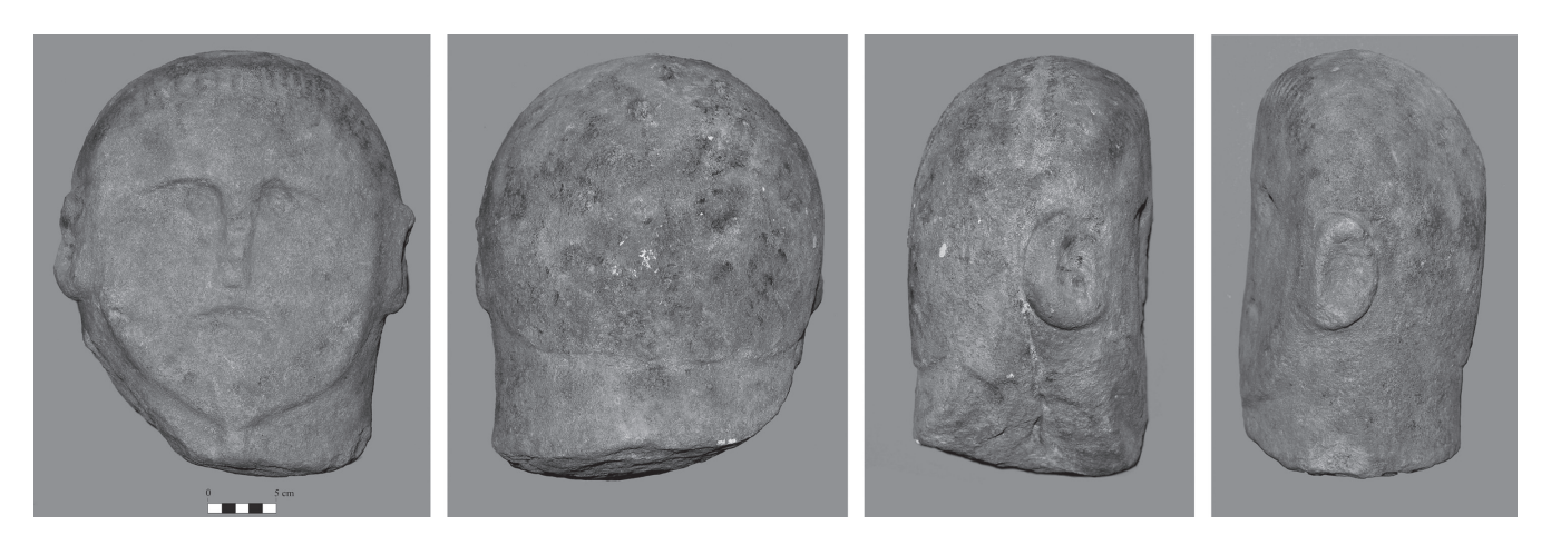
Figure 1: The stone head from Arzheim.