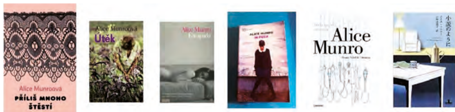
Figure 2: Overseas book cover designs for Alice Munro's collections of short prose: Czech, Spanish, Italian and Japanese.