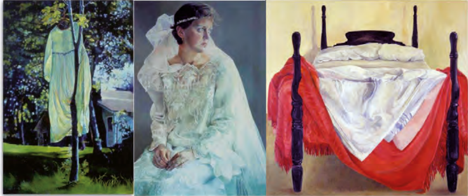
Figure 3: Mary Pratt's paintings used as elements of design for book covers of Alice Munro's collections of short prose.

Wedding Dress and Barby in the dress she made herself , both created in 1986, and The Bed , one of her first renowned paintings, all feature some of Pratt's central themes: dresses, gowns, bedclothes, and clothes in general (all of which coincide with Munro's themes of female lives). Reproductions of Pratt's paintings are the most salient visual elements in all three of Munro's book cover designs (due to the shortness of this article, I will not go into details of multimodal analysis of each book cover design). All three book cover designs communicate the following: this is an intrinsically Canadian text, a typical Munrovia text, a text emblematic of Canada.