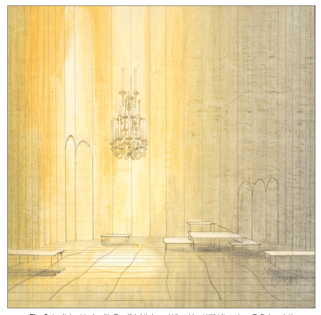
Fig. 2: Ladislav Vychodil: Twelfth Night or What You Will (direction: T. Rakovský) Slovak National Theatre, 1962.

limitations of such an approach very soon. His productions were becoming more functional and minimalist again. He also returned to his previous experiments with light and focused on shaping the space with light as one of the essential elements.