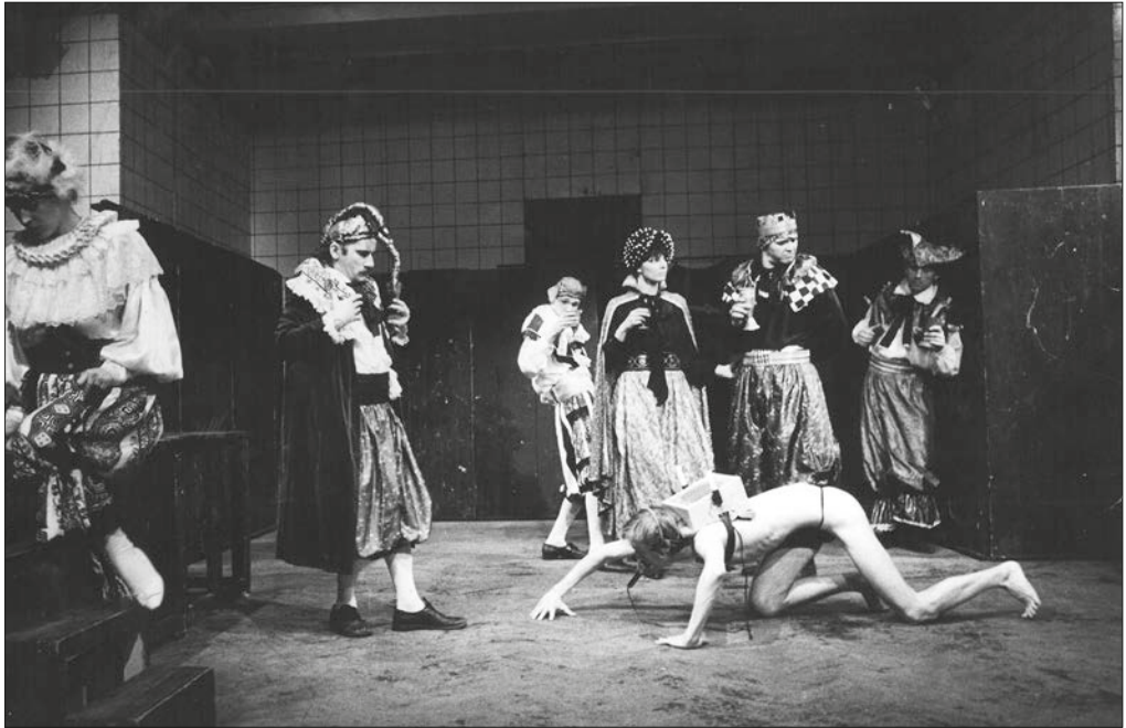
Fig. 2: The Hamlet Humans.