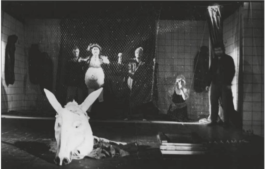
Fig. 3: Their Majesties Fools .

Again, according to Scherhauser, the staging intention was to perform the play as if in the period when ... the theatre 'went haywire' 13 . There are Hamlets everywhere, and everyone keeps asking Hamlet questions: Does it make sense to live? How should we exist in times when having means more than being? Should we rather sleep and cease to exist? (SCHERHAUSER 1996: 177).