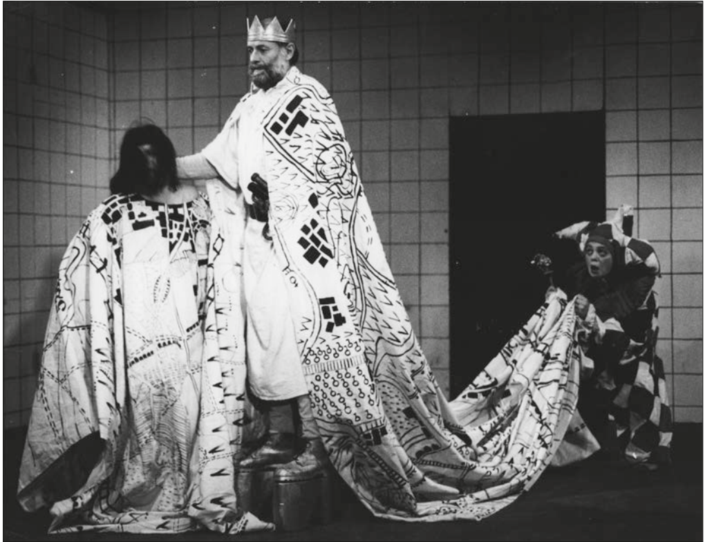
Fig. 4: A Man Tempest .