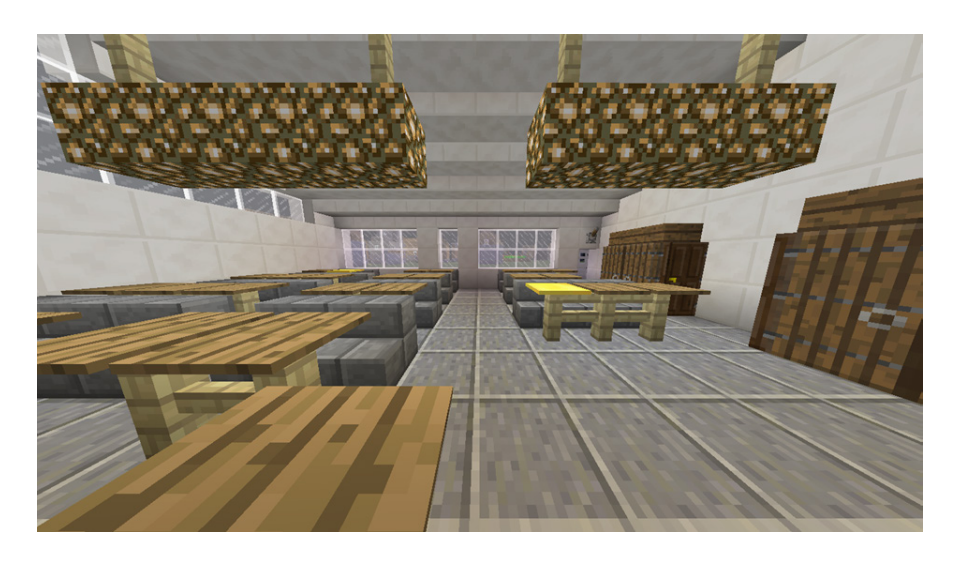
Figure 4. Screenshot from two students in Group B (week 45)

These two students from Group A built their classroom with TNT blocks and blew it up after they took their screenshot. The two students from Group B were busy ensuring all the details were right. They proudly showed the teacher and me their classroom construction, and one asked if they could show their classroom to the rest of the group. This question surprised the teacher because he thought of this boy as a highly modest student. Later, the teacher expressed more about his reflections connected to our observations of this group: