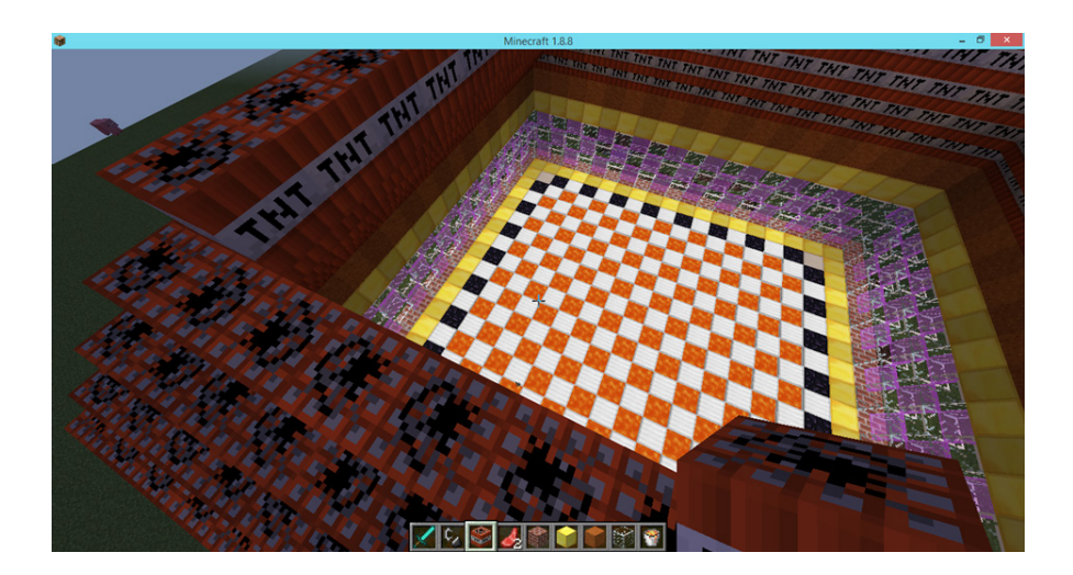
Figure 3. Screenshot from two students in Group A (week 45)

The teacher and I observed that the working process was different in Group B. Students worked in a more dedicated manner, showing how they managed to solve the tasks using Minecraft. The teacher was surprised that this group was more interested in working with the tasks. The main argument for splitting this class into groups was that Group B needed more support, but according to the teacher they managed well on their own during these lessons. A screenshot from two students in Group A (Figure 3) and one from two students in Group B (Figure 4) exemplify the differences in their efforts on the tasks.