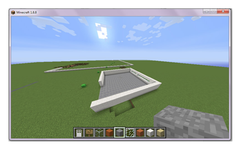
Figure 1. Build your classroom task (screenshot from week 45, Group A)

The teacher wanted to work with the mathematics tasks according to ideas about deeper complex learning using digital tools. Such a focus included reflections on such matters as the choice of block size mentioned in the task presented above and an evaluation of this choice in collaboration. We were inspired by a study by Jahnke, Nordqvist, and Olsson (2014), the findings of which show different components of deeper learning when it comes to group learning.