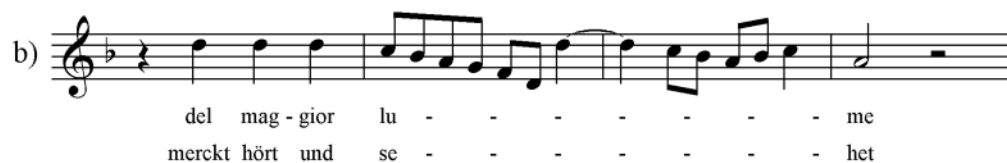
Ex. 4b Costanzo Porta, Da lo spuntar de matutini albori , b. 13-16, cantus , text by Pietro Cresci (first line) and by Martin Rinckart (second line).