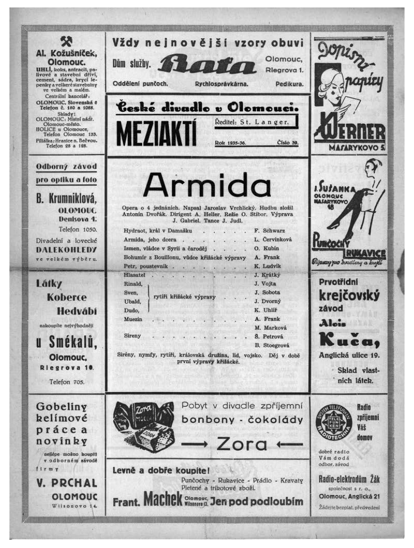
Fig. 2 The cast of Armida at the Czech Theatre in Olomouc for the 1935–6 season. National Museum – Theatre Department (hereafter NM-DO), call No. H6C-12350.

effects; at times we cannot but note the ludicrousness of the design. We did not think that a work by Dvořák would be staged so sloppily. <sup>26</sup> Critics berated the opera's style à la Richard Wagner and the low quality of the libretto. They agreed that the manner of the opera was new and unseen before in Dvořák's works – interwoven monologues and a more decisive tendency towards the music drama. With regard to dramatic effect – the narrative flow –