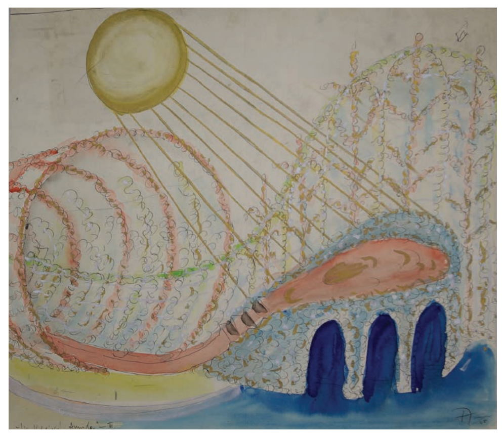
Fig. 3 Stage concept by František Zelenka for Act III of Armida at the National Theatre in Prague, 1928. NM-DO, inv. No. H6D/977-984.

National Theatre – and yet it only survived on the stage for eight years and was pulled from the repertoire in 1935.