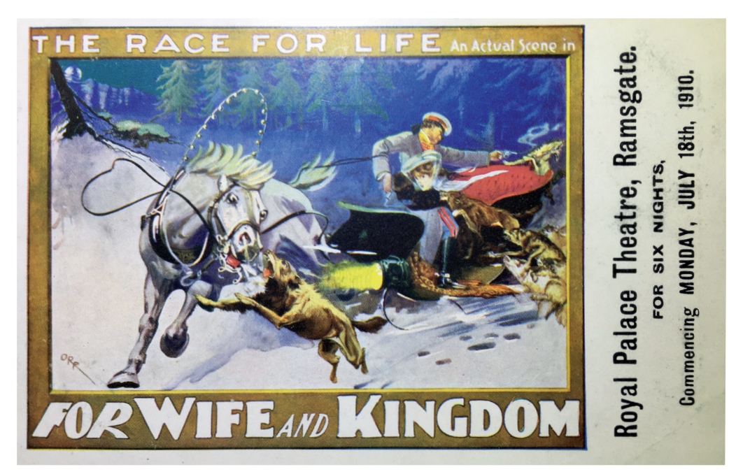
Fig. 4: Royal Palace Theatre (London), For Wife and Kingdom . Postcard, anonymous, 1910.

The poster by Ken Briggs for the 1973 The National Theatre production of the same play features a graphic of a horse by Gilbert Lesser (see Fig. 5). It is an image of a horse – schematic, geometric towards abstraction, reminding of a ceremonial mask, 'a mask of horsedom' (SHAFFER 1974: 10). The Artistic stylization renders meanings, for the poster conceivably reminds the viewer of primitive art, thus foregrounding an idea – a concept rather than an image of Equus the God. Hyperbolically expressed, deus ex machina, understood here as an effect such as a spectacle (or an element of storytelling), which corrupts dramatic effect, cannot function in an actual dramatic plot but could be placed off the stage as a 'God from the poster' or 'deus ex machina polygrafica'.