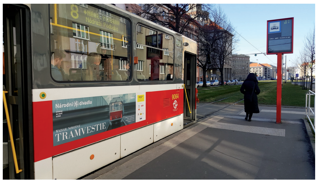
Fig. 2: National Theatre (Prague), Tramvestie . Featured publicity photography by Jakub Gulyás, graphic design by Petr Huml, 2019. National Theatre Archive.

KA 1994: 7).<sup>11</sup> In the stage production, only actors dressed in costumes, an extension of actors' corporeal self (ZICH 1986: 109), were on the stage. Any other props, seemingly less real, were set aside: even stage video projection to illustrate reality. On the contrary, a photographic image and graphic art mechanically or digitally reproduced the real world.