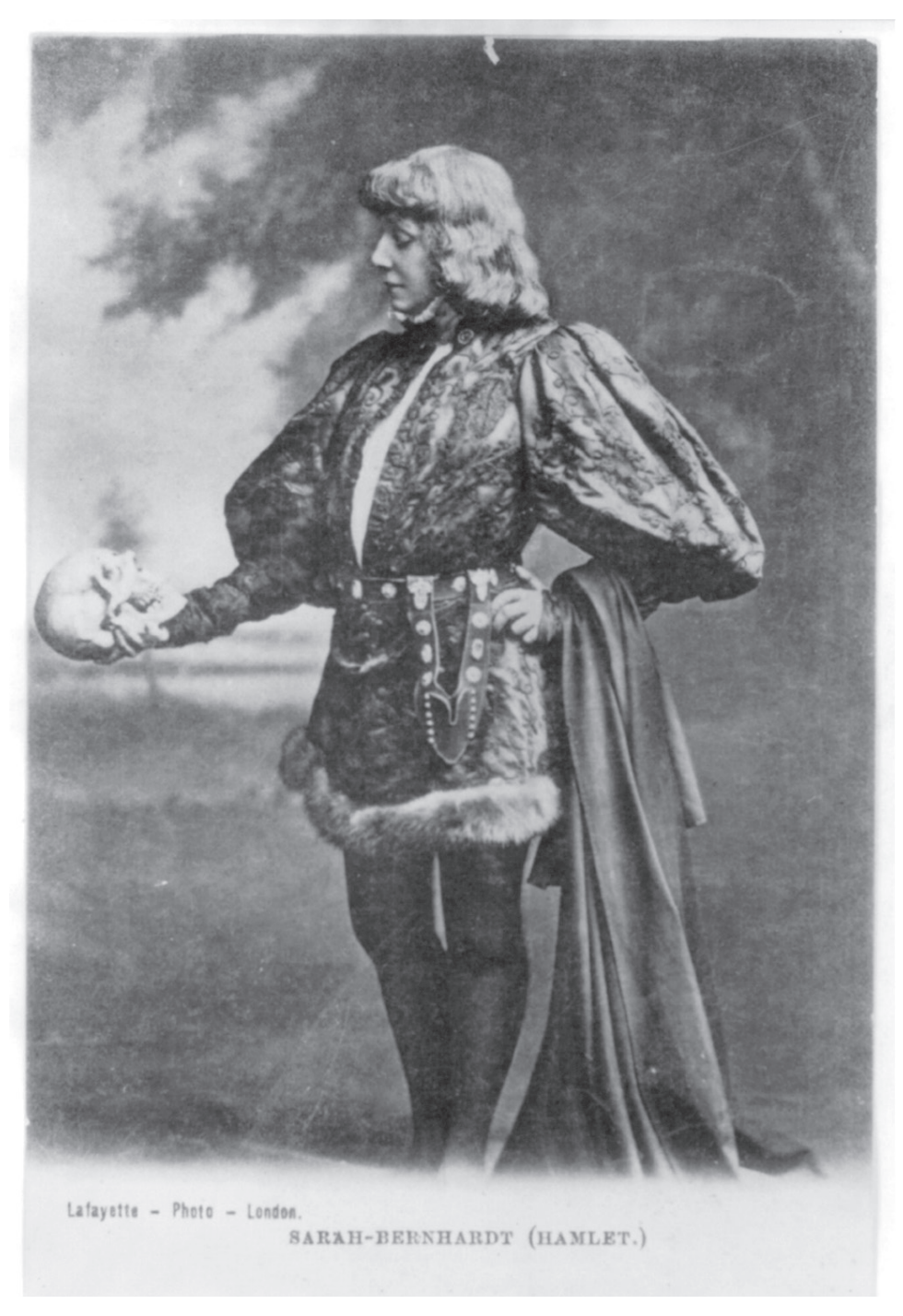
Fig. 8 : Sarah-Bernhardt ( Hamlet .) Between 1885 and 1900.