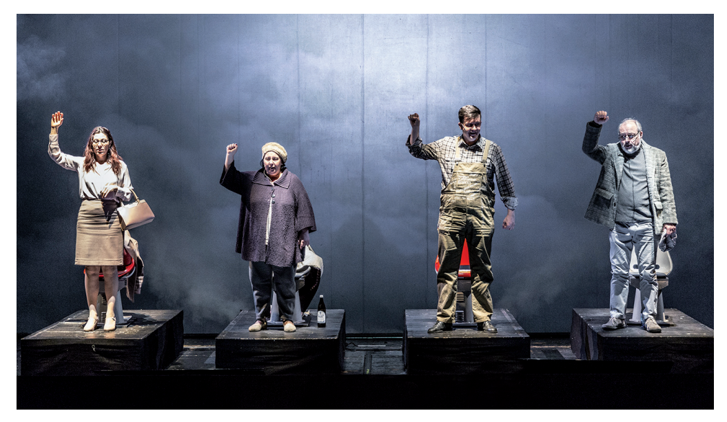
Fig. 1: National Theatre (Prague), Tramvestie. Photo by Patrik Borecký, 2019.

Even if a stage is empty of decoration and filled only with the presence of acting actors, it is always minimally graphic since the action must happen 'somewhere'. Zich comments on this representation: 'Usually, the place requires more determination' (ZICH 1986: 179). The poster image by Bratislava-based visual artist Jakub Gulyás features a realistic photographic image of an actual tram, an image which is also reproduced on the cover of the theatrical program (see Fig. 2, 3). Since within the scenography the place (the tram) is determined only metonymically with the tram seats, the poster and programme are used to graphically specify the setting.