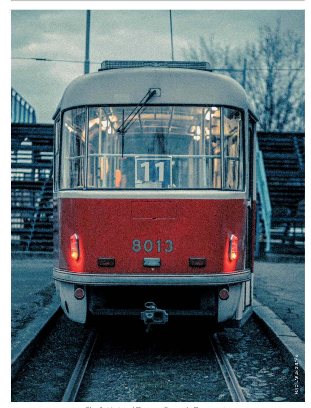
Fig. 3: National Theatre (Prague), Tramvestie . Publicity photography by Jakub Gulyás, 2019. National Theatre Archive.