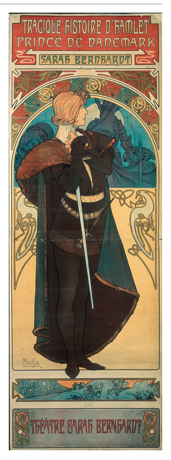
Fig. 7: Sarah Bernhardt, Tragique historie d'Hamlet, Prince de Danemark. Poster by Alphonse Mucha, 1899. Moravian Gallery (Brno).