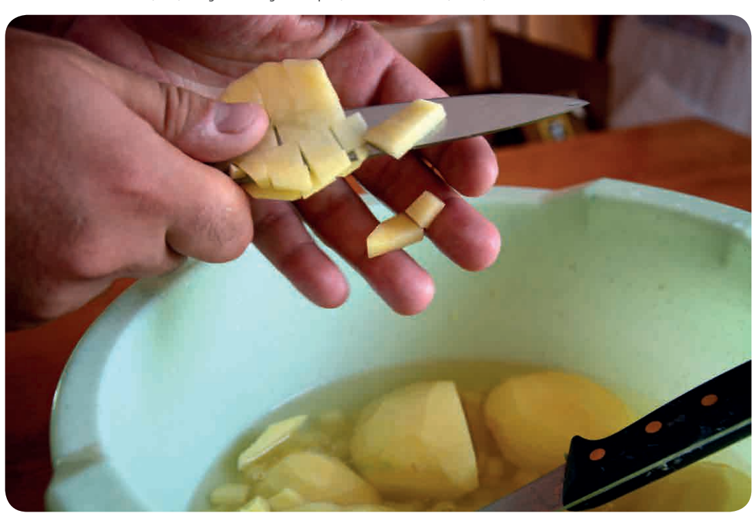
The preparation of potato pie ( krompiruša ), showing a specific technique of cutting potatoes with a knife.