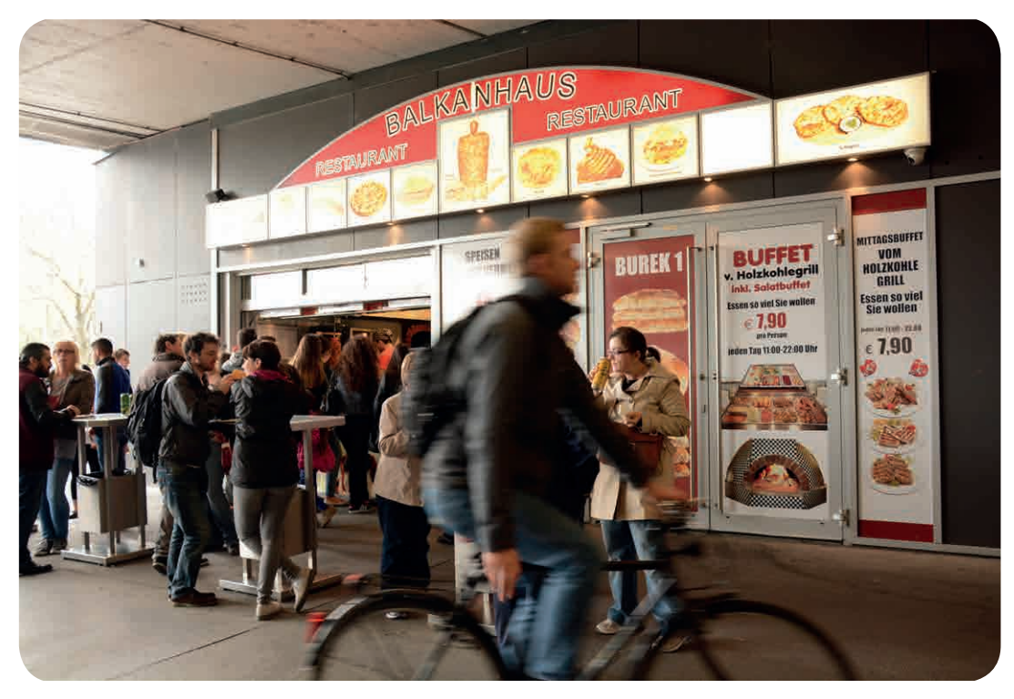
Balkanhouse is a busy fast-food restaurant in Prater, Vienna, that serves amongst other things, the burek.