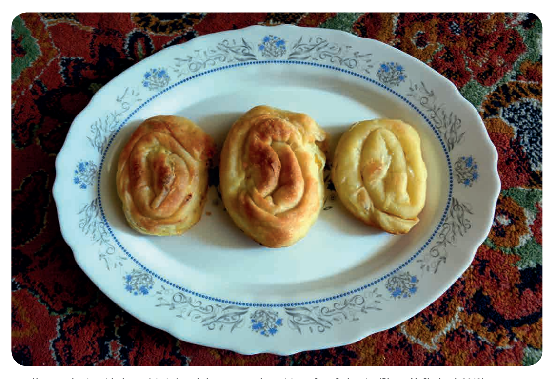
Homemade pita with cheese (sirnica) made by my research participant from Srebrenica