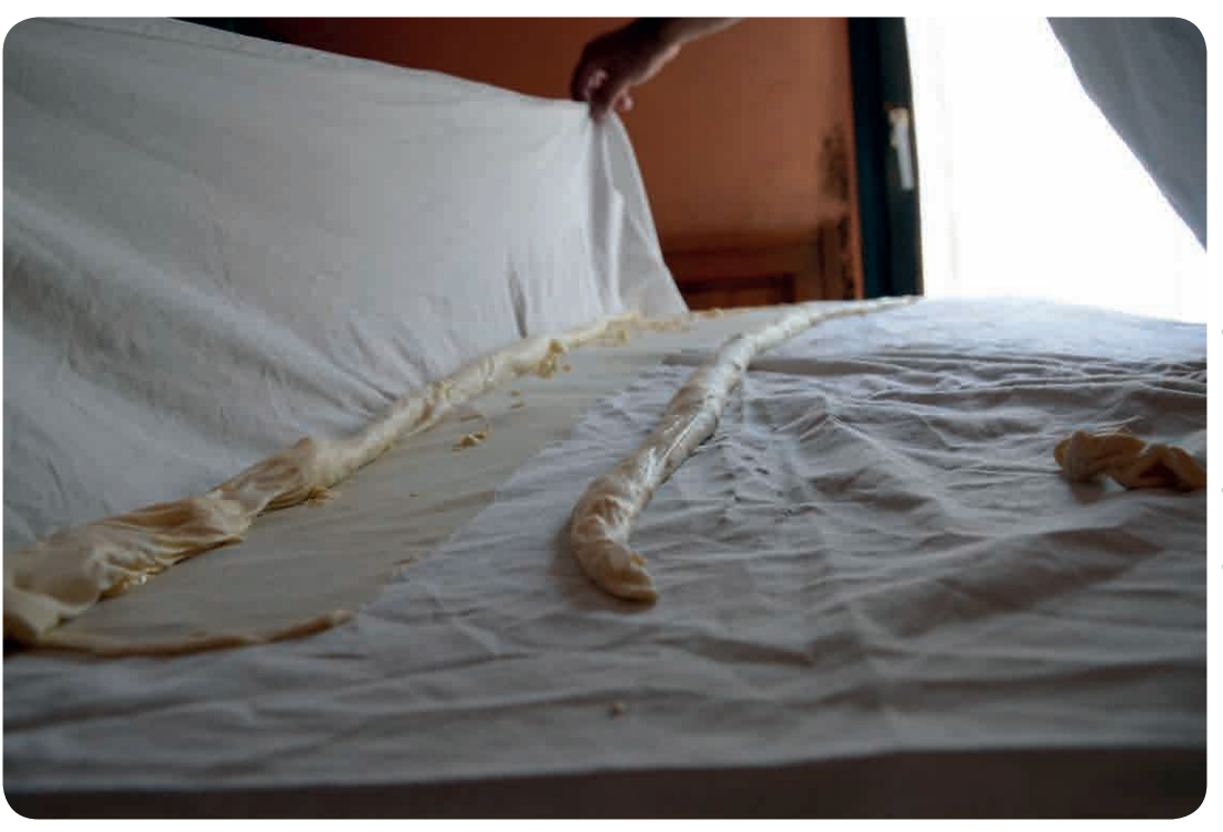
Pita made in Srebrenica, BiH, using the rolling technique.