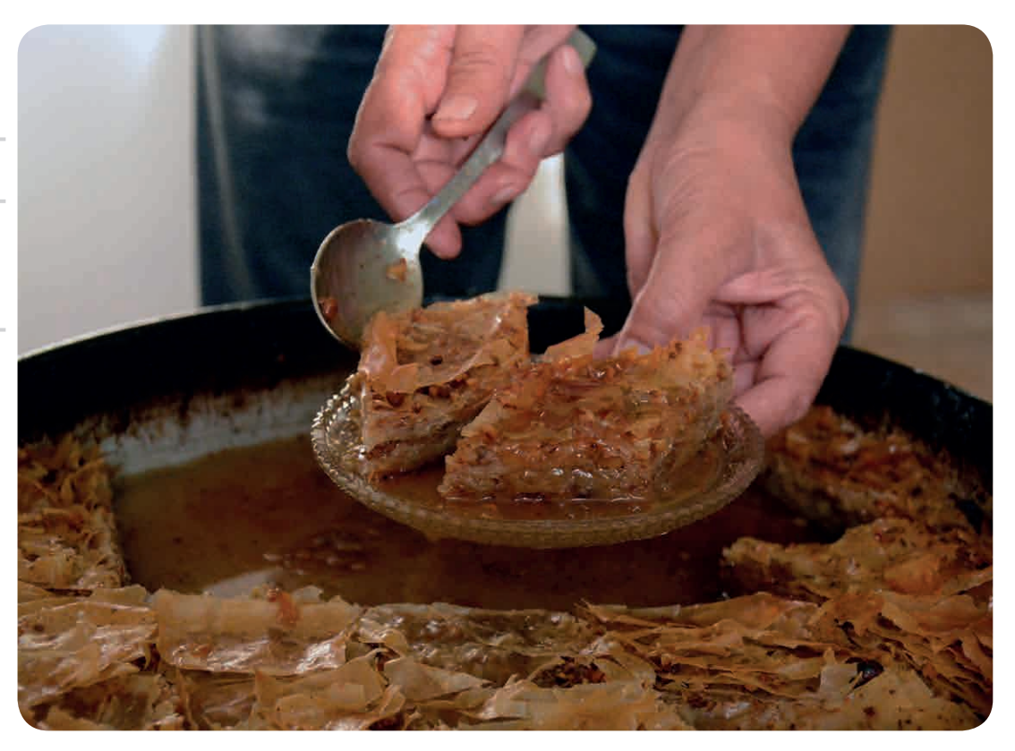
Baklava (an oriental sweet) made by a technique of layering. An almost identical technique is also used to make a savoury pita pie.