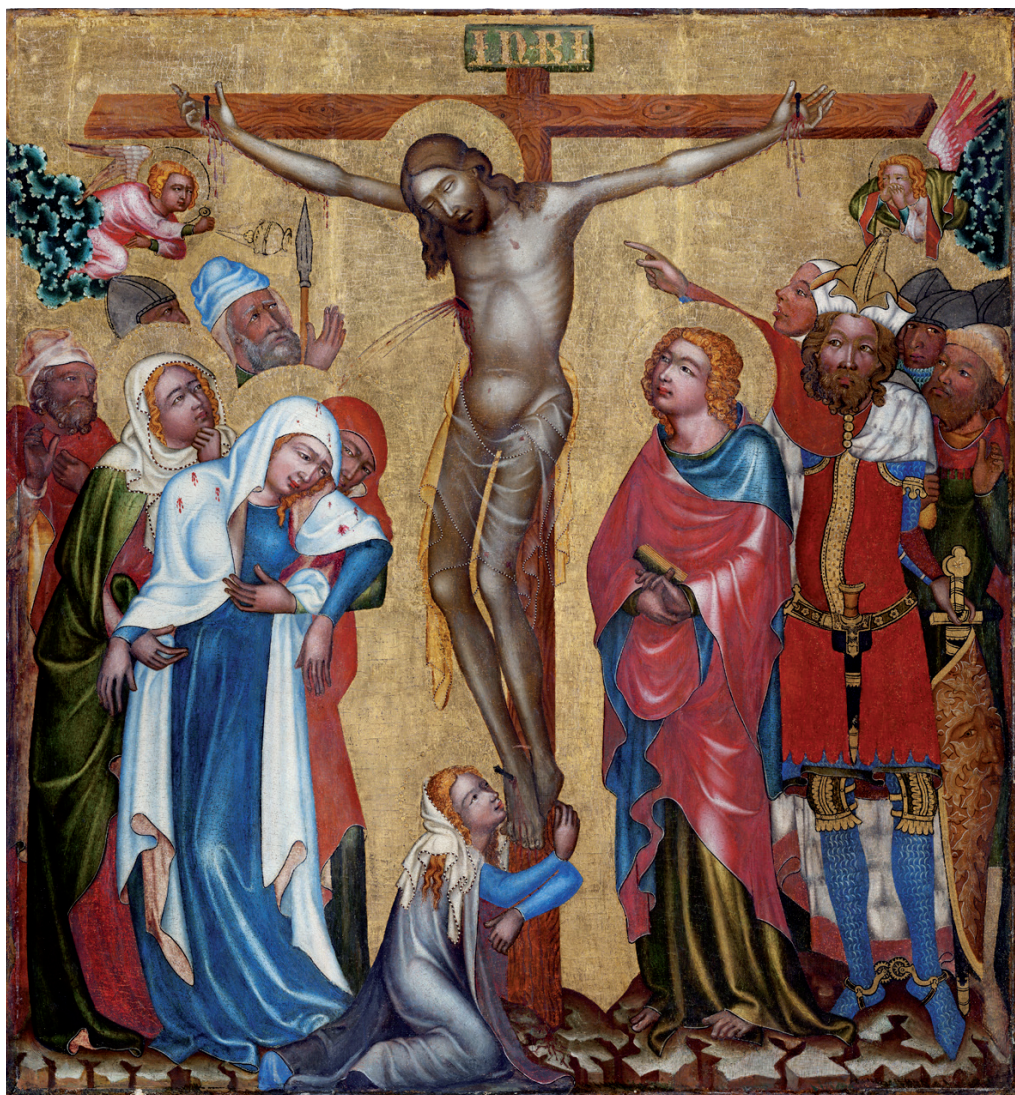
Fig. 1: Crucifixion, Vyšší Brod Cycle, Master of the Hohenfurth Altarpiece (1345–1350).

mode of the original reception of the Planct. As was already noted, the text survived as the manuscript codex called the Passional of Abbess Kunigunde ( Passionale abbatissae Cunegundis ). The daughter of Ottokar II of the royal Bohemian House of Přemyslid, Kunigunde had become an abbess of the Benedictine nunnery of St. George at the Prague Castle in 1302 and remained in the office for the next 20 years until her death. The manuscript was conceived for the personal use of the Abbess, and the texts in-