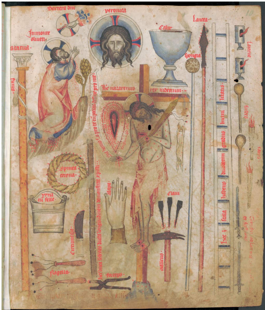
Fig. 3: Depiction of the arma Christi in the Passional of Abbesse Kunigunde, National Library of the Czech Republic, ms. XIV.A.17, fol. 10r.