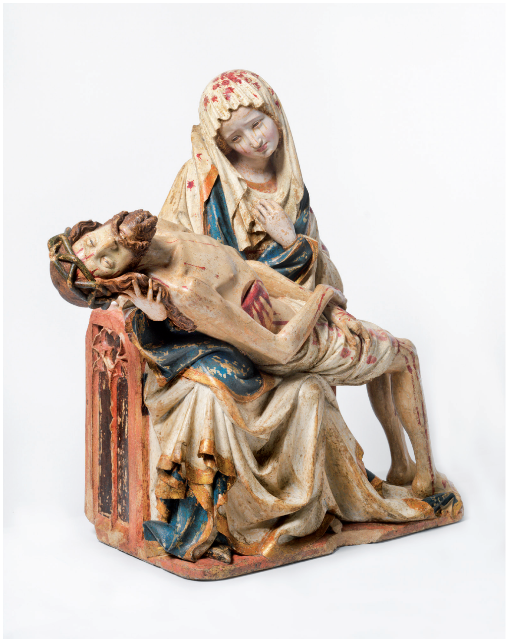
Fig. 2: Křivák's Pietà: anonymous; the Pietà from the collection of Canon Křivák, between 1390–1400; argillite, polychrome; height 74 cm. © Muzeum umění Olomouc; author: Markéta Lehečková.