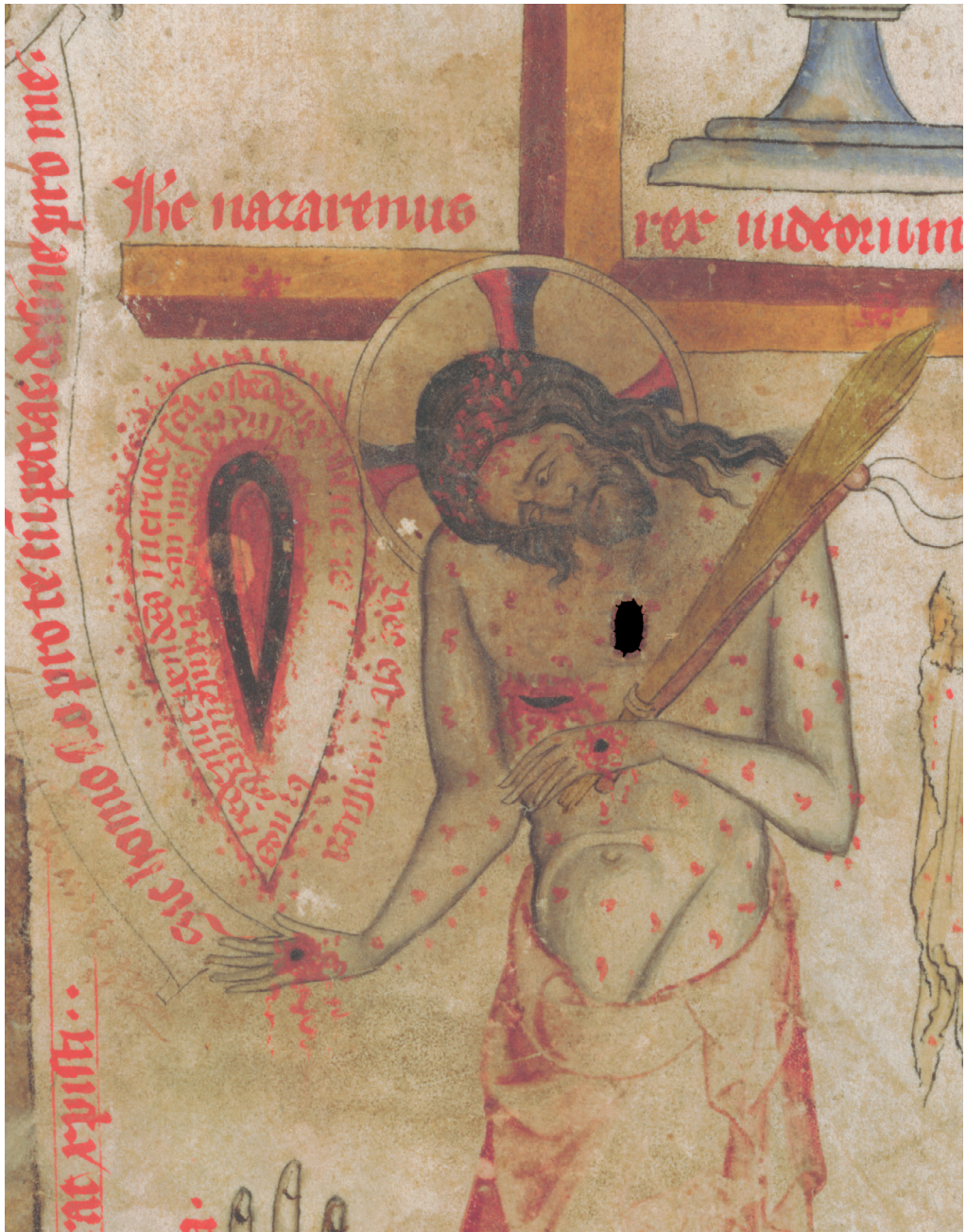
Fig. 4: Depiction of Christ's Side Wound in the Passional of Abbess Kunigunde, detail.