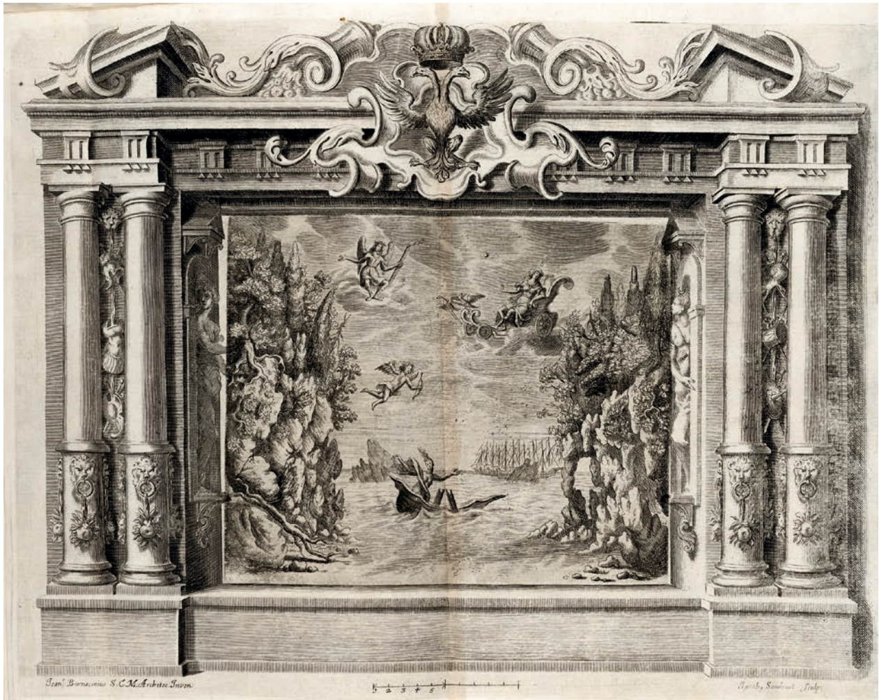
11 – Jacob Sandrart after Giovanni Burnacini, Sixth Scene , copper engraving. Benedetto Ferrari, Inganno d'Amore , Regensburg: Christophor Fischer, 1653