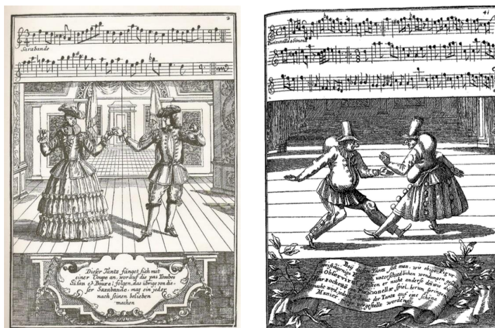
Figures 3 & 4: Prints from Gregorio Lambranzi's famous book of illustrations Nuova e curiosa scuola de' balli theatri ( New and Curious School of Theatre Dancing ) printed in 1716 in Nuremberg. Two dancers on the left dance a sarabande, on the right two dancers perform a grotesque dance.

In the early years of the eighteenth century, the Italian opera was frequently criticized in London because some critics saw it as a foreign import sung in effeminate language which corrupted the English taste, English music, and theatre tradition (a case in point is John Dennis's An Essay on the Opera's, After the Italian Manner, which are to be Established on the English Stage: with some Reflections on the Damage which they may bring to the Publick from 1706 ). 5 Were there instances of objections based on the artform's national origin in connection to the French dancing style or French dancers? Was French dancing ever viewed by the English as foreign in a negative way?