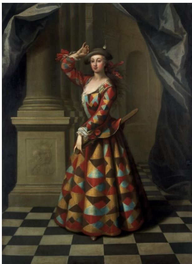
Figure 5: John Ellys’s painting of the actress-dancer Hester Booth (née Santlow) as a Harlequin Woman, c. 1722–1725.

Mrs Santlow was not unique in being both a dancer and an actress for she had several predecessors, going back to the 1660s, as well as a number of contemporaries. She was unusual, however, as both a leading actress and the company’s leading dancer with extensive repertoires in both genres which went far beyond those of other dancer-actresses. There were no true dancer-actors – although there were actors who regularly performed individual speciality dances, there were no actors who took both