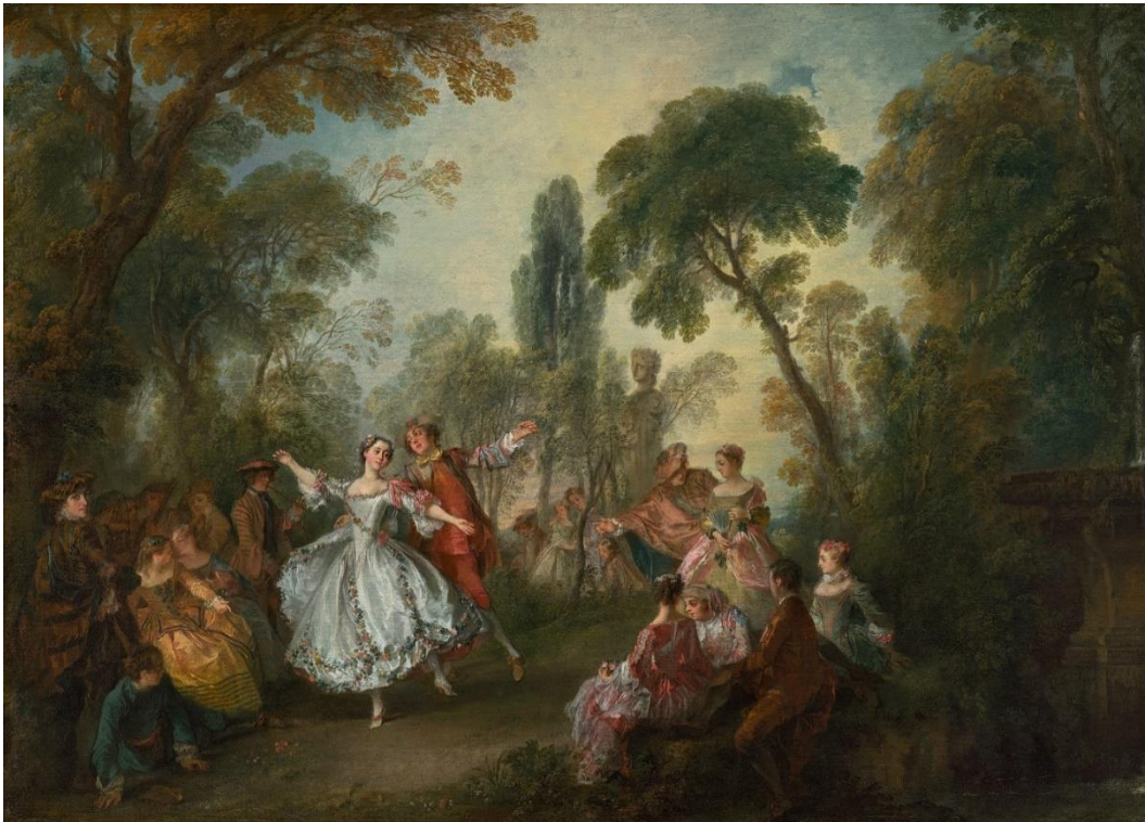
Figure 1: French dancer Marie-Anne de Cupis de Camargo, a ballet star of the Paris Opéra, painted by Nicolas Lancret in a stylized scene in a pastoral opera (c. 1730)

MG: In London’s theatres, relatively little time was given to dancing during each performance, but it often ran through the whole evening – notably in the entr’actes, but also within plays (tragedies as well as comedies). From the 1670s it was included in dramatic operas, a few of which survived in the repertoire well into the eighteenth century, and from the late 1710s dancing was an integral part of pantomime after-pieces. The lack of evidence about performances during the late seventeenth century makes it difficult to chart changes and developments before the early 1700s, but there was certainly more dancing in London’s theatres following the opening of the Lincoln’s Inn Fields Theatre in 1714. The surviving newspaper advertisements and playbills show that dancing remained an important feature of theatre performances into the nineteenth century.