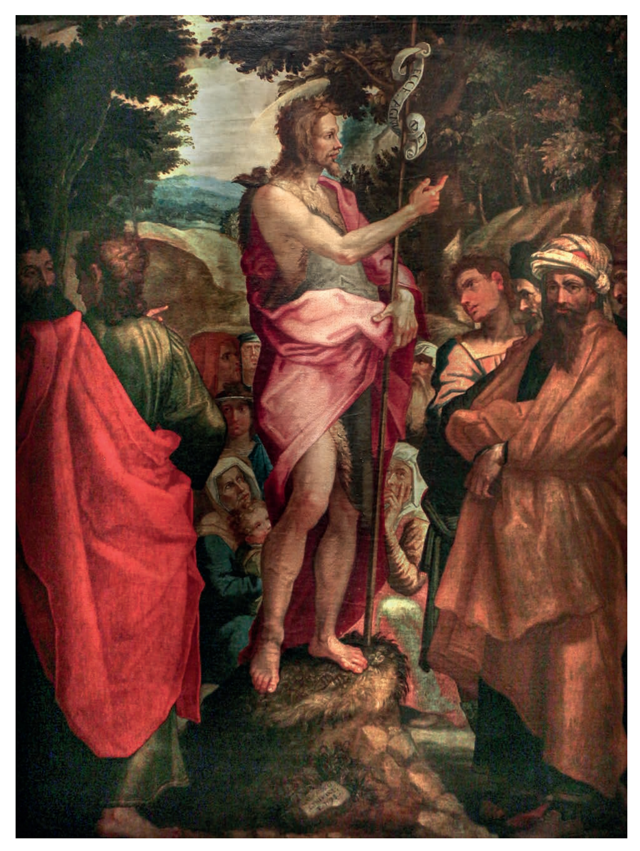
1 – Galeazzo Ghidoni, St John the Baptist Preaching , 1598. Cremona, Museo Civico