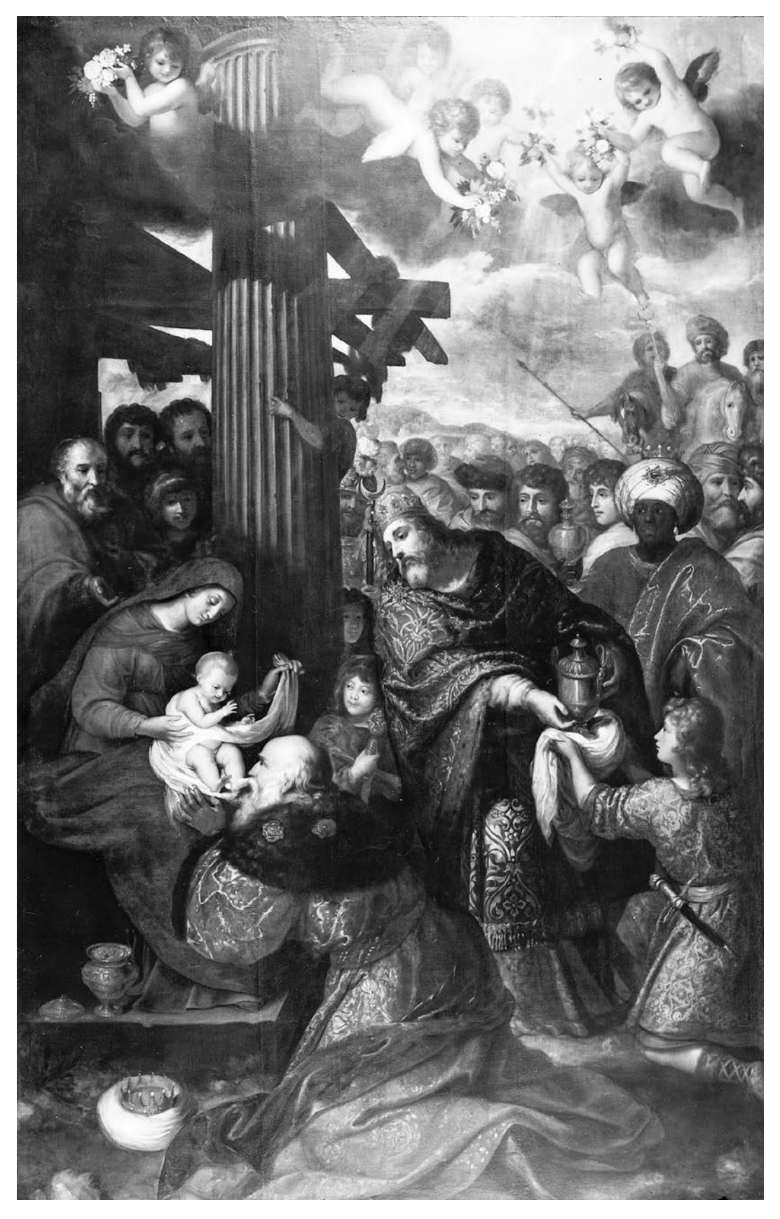
8 – Giovanni Battista Ghidoni, The Adoration of the Three Kings , 1640. Valtice, church of the Assumption of Our Lady