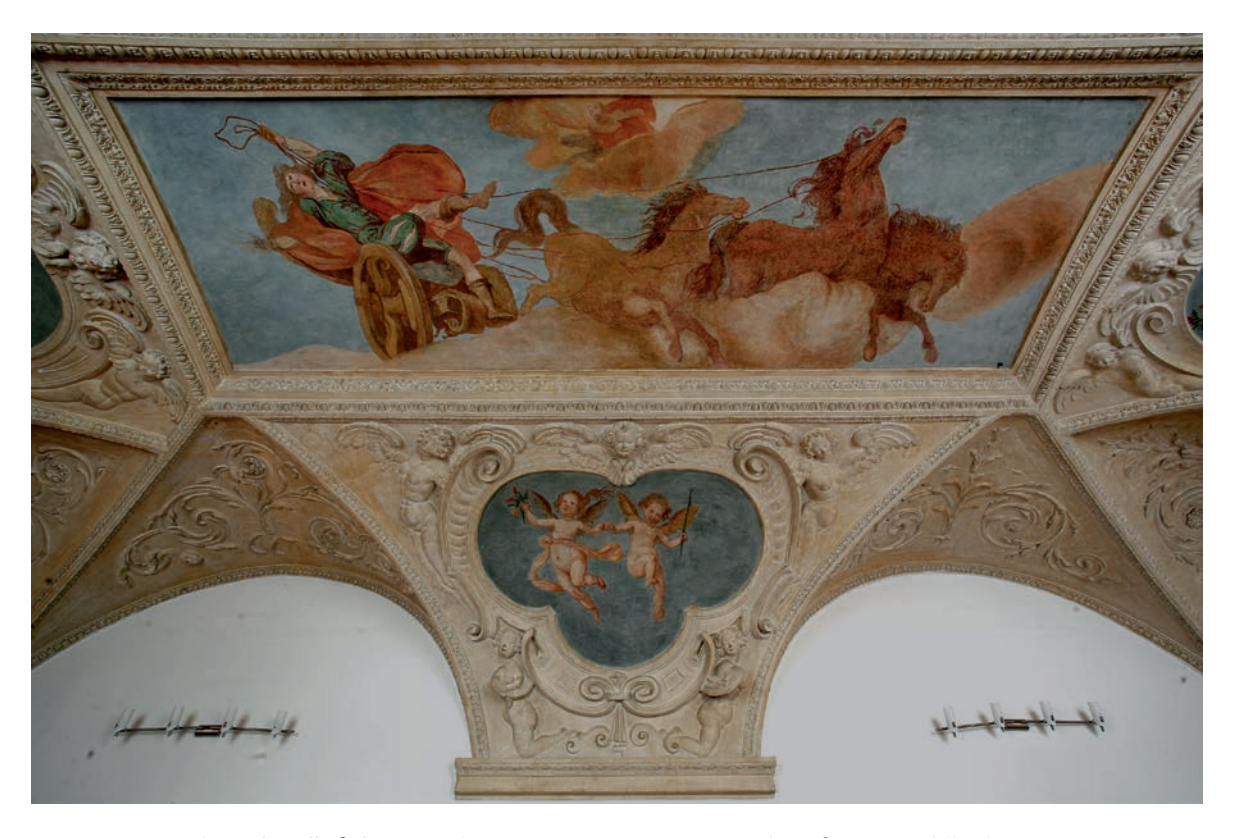
12 – Domenico Pugliani, The Fall of Phaeton , ceiling painting, 1628–1632. Prague, palace of Francesco della Chiesa in Prague New Town (also known as the Losy of Losinthal Palace or the Kinský Palace)