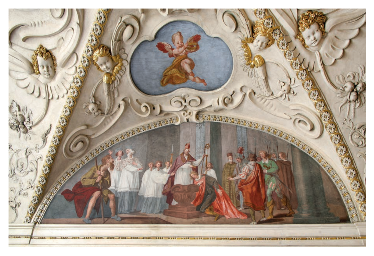
11 – Domenico Pugliani, The Baptism of St Wenceslaus , ceiling painting, 1628–1632. Prague, Wallenstein Palace