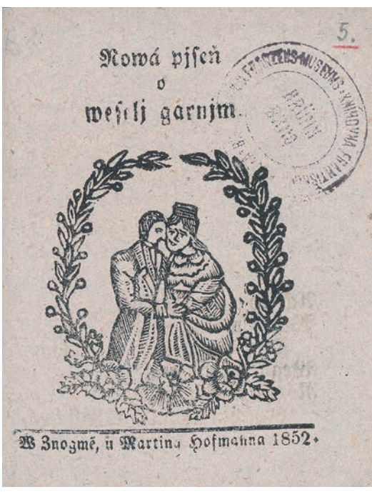
Figure 1. On the left, broadside ballad with false imprint from Znojmo. Píseň o myslivečku, 1846, MZK, sign. VK-0000.084, přív.15; below, a Znojmo print dated 1852. Nová píseň o veselí jarním, 1852, MZK, sign. VK-0000.555,5.

must always speak more in terms of probabilities, because, with only some exceptions, it is basically impossible to prove a false imprint in a chapbook on the basis of contemporary documentation.<sup>7</sup>