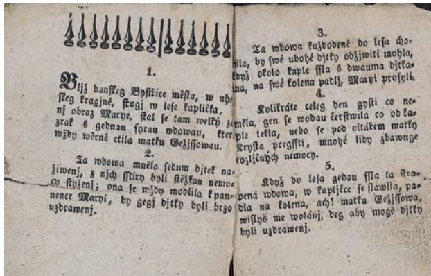
Figure 2. Píseň k Panně Marii, 1844, MZK, sign. VK-0000.722,přív.28.

primary distinguishing feature is the deformed face of the woman. This woodcut from the Znojmo printing house can be found in the Moravian Library collection in a total of six chapbooks, one of which bears the Znojmo imprint and dates to the beginning of the 19^{th} century, two bear the imprint "W Praze" ("In Prague"), with the remaining three coming from the Znojmo output of Martin Hoffmann and Martin Ferdinand Lenk in the 1850s.^{10} Znojmo prints from the beginning and then the middle of the 19^{th} century show that the block was used at the Znojmo printing house in the 19^{th} century. The discrepancy between two imprints in a series of prints with the same woodcut indicates that these are prints that were actually made in Znojmo, but with a false imprint.