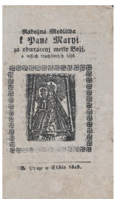
Figure 3. Two chapbooks with false imprint from the Znojmo printing house. Pravdivá píseň o jednom strašlivém příběhu, který se stat v sardinské zemi na den narození Krista Pána na příklad vydaná v roku 1849, 1849, MZK, sign. VK-0007.386; <i>Nábožná modlitba k Paně Marii za odvrácení metly boží, a všech truchlivých časů , 1849, MZK, sign. VK-0017.129.