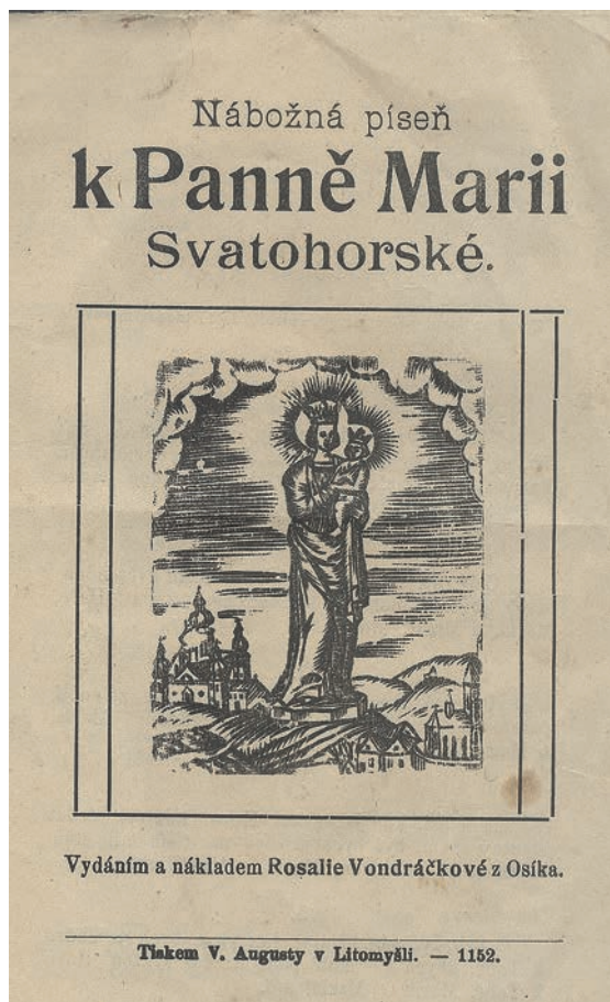
Figure 3. A woman as an author of a broadside ballads. Private collection.