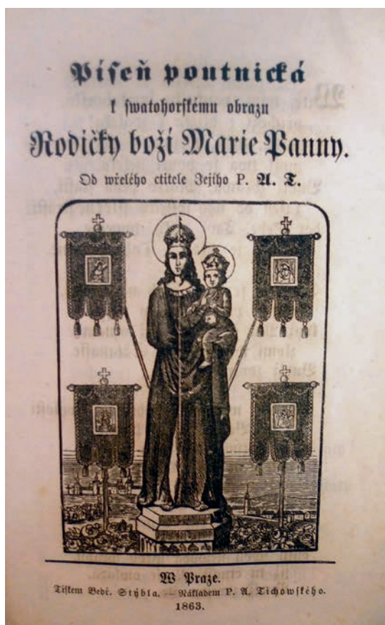
Figure 2. The method of stating the authorship in broadside ballads.

pieces of prose, religious literature, and theatrical translations from German. He was one of the first national revival novelists who enriched literary Czech with the phraseology of everyday speech. Perhaps this is why he is so highly rated among the authors of broadside ballads. His composition referencing Svatá Hora was a “Chvalozpěv k uctění [...] mariánského obrazu Panny Marie Svatohorské [...]” (“Hymn in Honour [...] to the Marian image of the Virgin Mary of Svatá Hora [...]”), which he published on the occasion of the proclamation of the Jubilee Summer (1825). In the hymn he describes a pilgrimage from Prague to Svatá Hora, emphasising a station on the pilgrimage route associated with a particular pilgrimage ritual – the so-called “bow”.