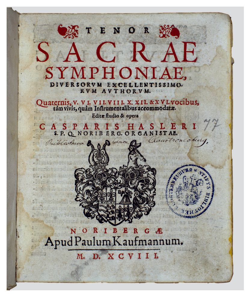
Figure 5 The title page of the Sacrae symphoniae collection of 1598 with provenance marks of the Klosterneuburg Abbey.

Some of the above-mentioned marks (provenance marks, dates, and catalogue numbers written in pencil) are also present on some other extant prints and manuscripts in the library of the Klosterneuburg Abbey. However, due to the absence of music inventories and catalogues of the library in the period between the sixteenth and the nineteenth centuries, it is almost impossible to trace back what happened to the musical sources, in which year they were deposited in the abbey library, where they had come from, and whether any of them were used for singing in Klosterneuburg. Nevertheless, it should be noted that the history of the abbey library and its musical collection has not been processed in depth yet and several documents are present in the abbey archive that might shed some light on them by time.