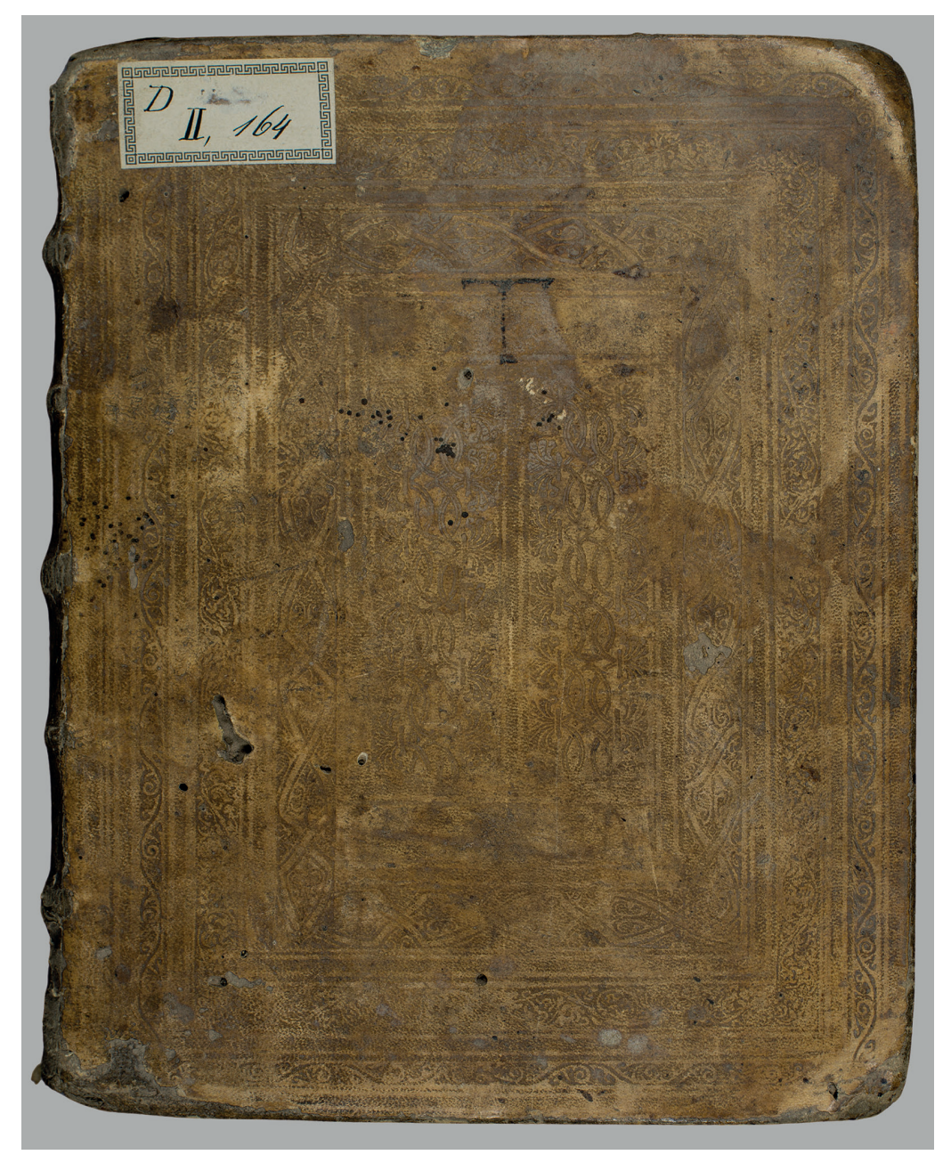
Figure 1 The front boards of the tenor book.