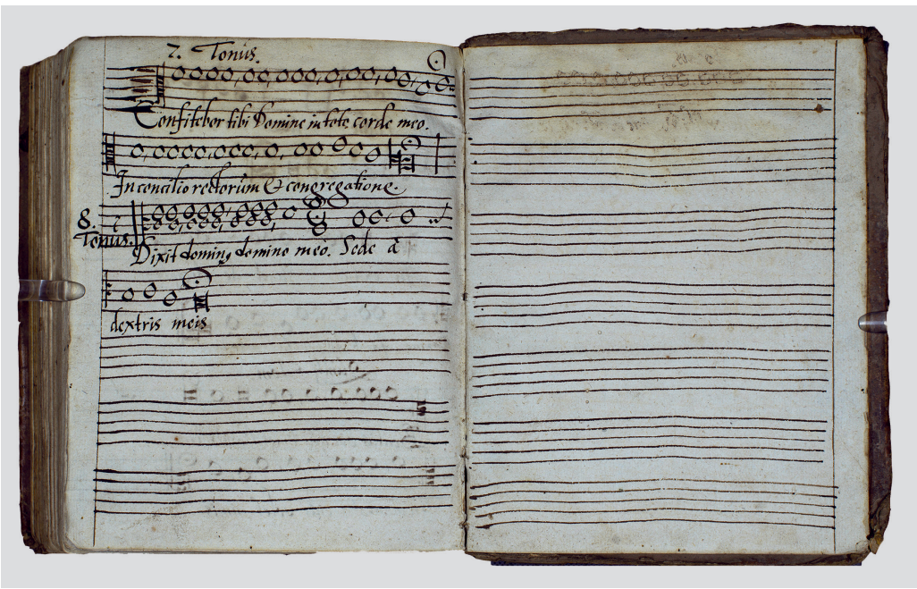
Figure 4 Handwritten additions to the end of the part book.