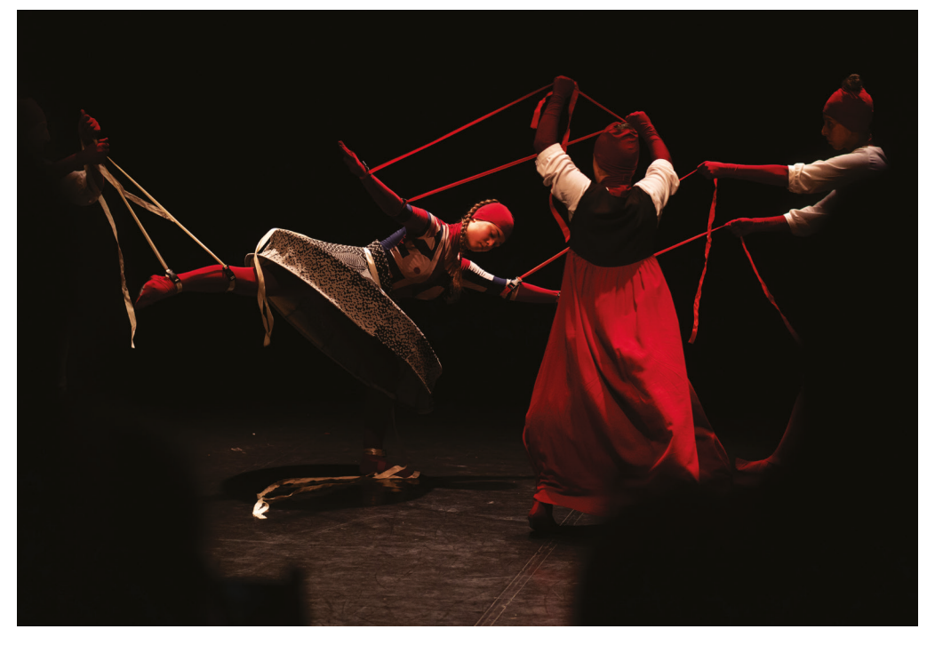
Fig. 5: 'Doll'.