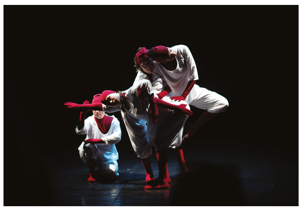
Fig. 6: 'Medtner', or 'The Mourning March'.

about some fictional, completely imaginary scenery, while all the others spontaneously illustrate this picture via their movements.