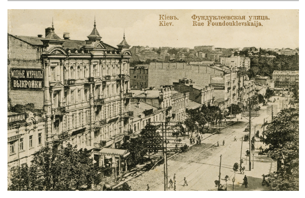
Fig. 1: Fundukleevska Street, Kyiv.