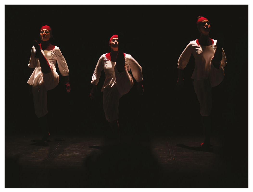
Fig. 4: 'Masks'.