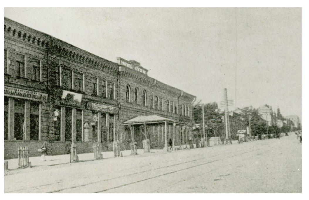
Fig. 2: Theatre maison du Bergonie, Kyiv.