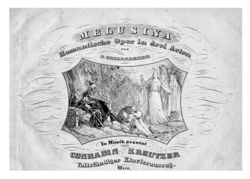
Fig. 1. Cover page of piano excerpt from Melusina by Conradin Kreutzer, Vienna 1833 (Notendrucke aus der Musikabteilung der Bayerischen Staatsbibliothek, München, Bayerische Staatsbibliothek, 2 Mus. pr. 4424).

Despite receiving a new libretto from Grillparzer, Beethoven subsequently did not realize his intention to set this new opera work to music. The reason being that he was not satisfied with less pronounced dramatic composition of the libretto, which was a half tragedy and half fairy tale. The libretto would probably have been completely forgotten had it not, in the 1830's, aroused the interest of a German composer and conductor, Conradin Kreutzer<sup>8</sup>, who in 1833 wrote the music for the libretto. His Melusina , with spoken dialogues more a singspiel than a grand romantic opera, finally saw its world premiere in the same year at the Königstheater in Berlin. Its resounding success was followed by numerous performances in Vienna and elsewhere, which, among others, also encouraged Felix Mendelssohn Bartholdy to write the music for the overture of Die schöne Melusine , premiered in London on 14<sup>th</sup> of November 1833 with great success.