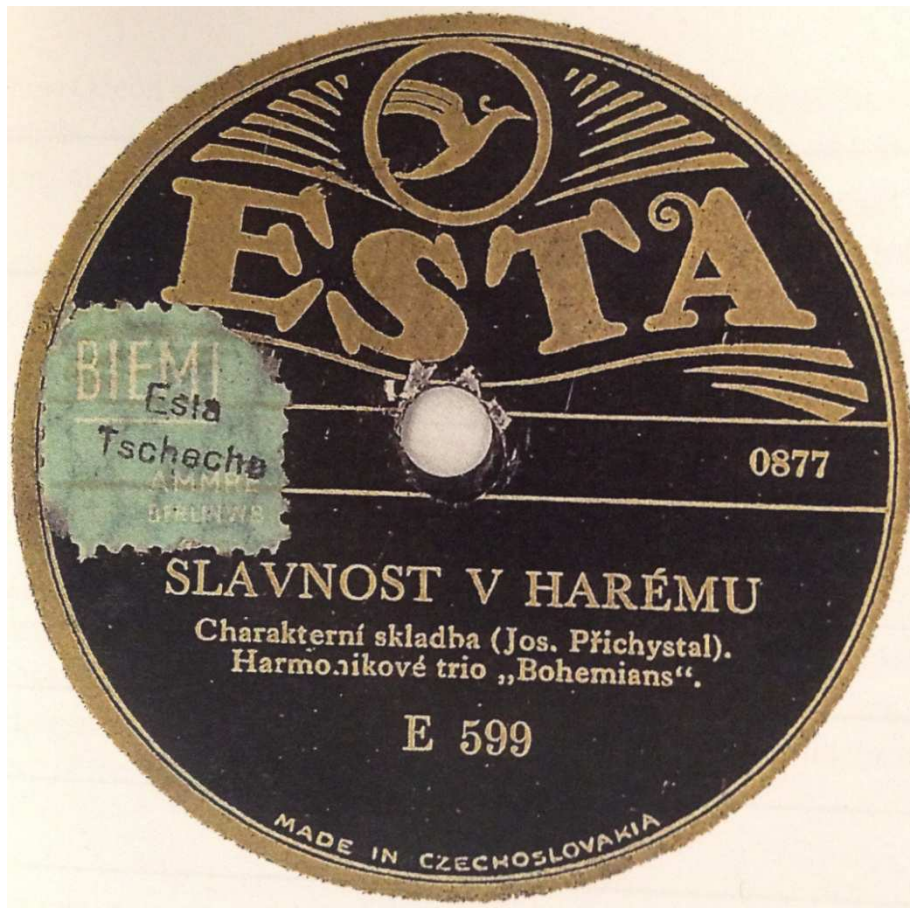
Fig. 2 Label on a gramophone recording by ESTA

One of the goals of our project is to get all the information right at all times. That is why we use the catalogues and shellac discs labels mentioned above.