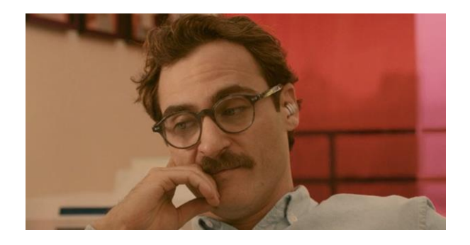
Fig. 4. Operation system called Her communicates with Theodore (Joaquin Phoenix) using speech synthesis<sup>41</sup>.

Takeaway message: Reading from wearables will be realized using text flow and speech synthesis.