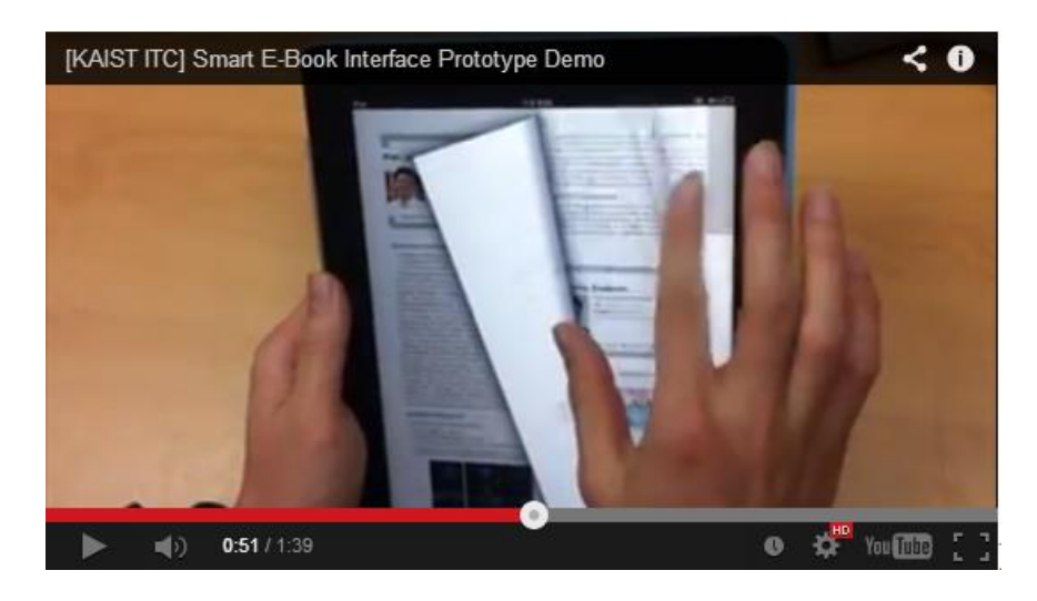
Fig. 2. Multi-touch interface of Smart eBook prototype<sup>39</sup>.

We think graphic user interface of Flipboard or Zite is a suitable form for pleasant consumption of digital content such as blogs, news and Twitter, Facebook or LinkedIn streams. Similar content blocks, or cards if you will, as Flipboard implemented within its application are used by Facebook (See Fig. 3). Facebook also introduced a new Facebook mobile application called Paper (See Fig. 3), which focuses more on the reading experience and content curation. Undoubtedly, Facebook got inspired by usability and interaction flow achieved by Flipboard (See Fig. 3).