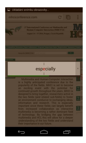
Fig. 1. Screenshot of A Fast reader<sup>35</sup> based on Spritz technology.

There is a strong interest in implementing Spritz technology into wearables. On the other other hand there are cautious opinions on psychological and cognitive aspects of reading using using Spritz. It is very often criticized for problematic information processing and significantly significantly less control<sup>33</sup>. Readers can have difficulties with the text flow. What happens when when reader wants to re-read the last paragraph because something was not understood correctly? Spritz also requires high level of attention not to miss any word. It is question how how much mental effort user must spend on concentration<sup>34</sup>.