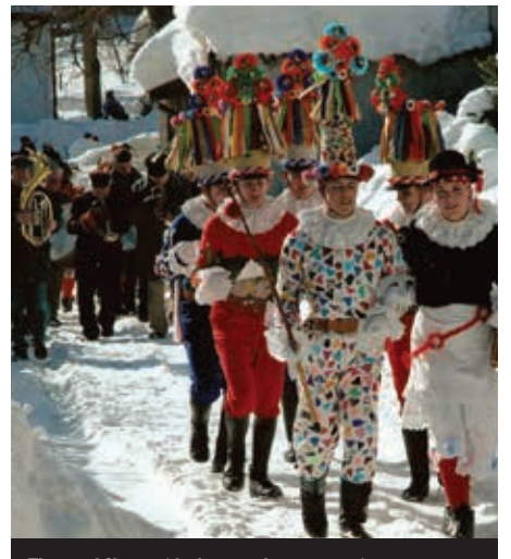
The rural Shrovetide door-to-door processions and masks in the region around Hlinsko were entered into the UNESCO Representative List of Intangible Cultural Heritage of Humanity on 16 November, 2010.

During its whole existence, the Department of European Ethnology has formed the rising generations of ethnologists, so that they are equipped with sufficient theoretical and practical knowledge applicable in various types of professional institutions. This is i.a. also evidenced by frequent employment of graduates in central as well as regional museums and other memory institutions, departments of the Czech Academy of Sciences or the National Institute of Folk Culture in Strážnice. The ability to use the knowledge acquired by professional training in the field of applied ethnology at the university was also proved by an active involvement of graduates from the Department of European Ethnology, Faculty of Arts, Masaryk University, in the preparation of all hitherto elaborated nominations for registration of a phenomenon in the Representative List of Intangible Cultural Heritage of Humanity<sup>26</sup> as well as some proposals for entry into the List of Intangible Objects of Czech Traditional Culture and Folklore.27