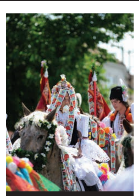
The Ride of the Kings, a traditional festival which is still actively celebrated in four localities in South Moravia (Hluk, Kunovice, Skoronice and Vichov), was entered into the UNESCO Representative List of Intangible Cultural Heritage of Humanity on 27 November, 2011.

The teaching staff and collaborators (visiting lecturers, postgraduate students), mainly